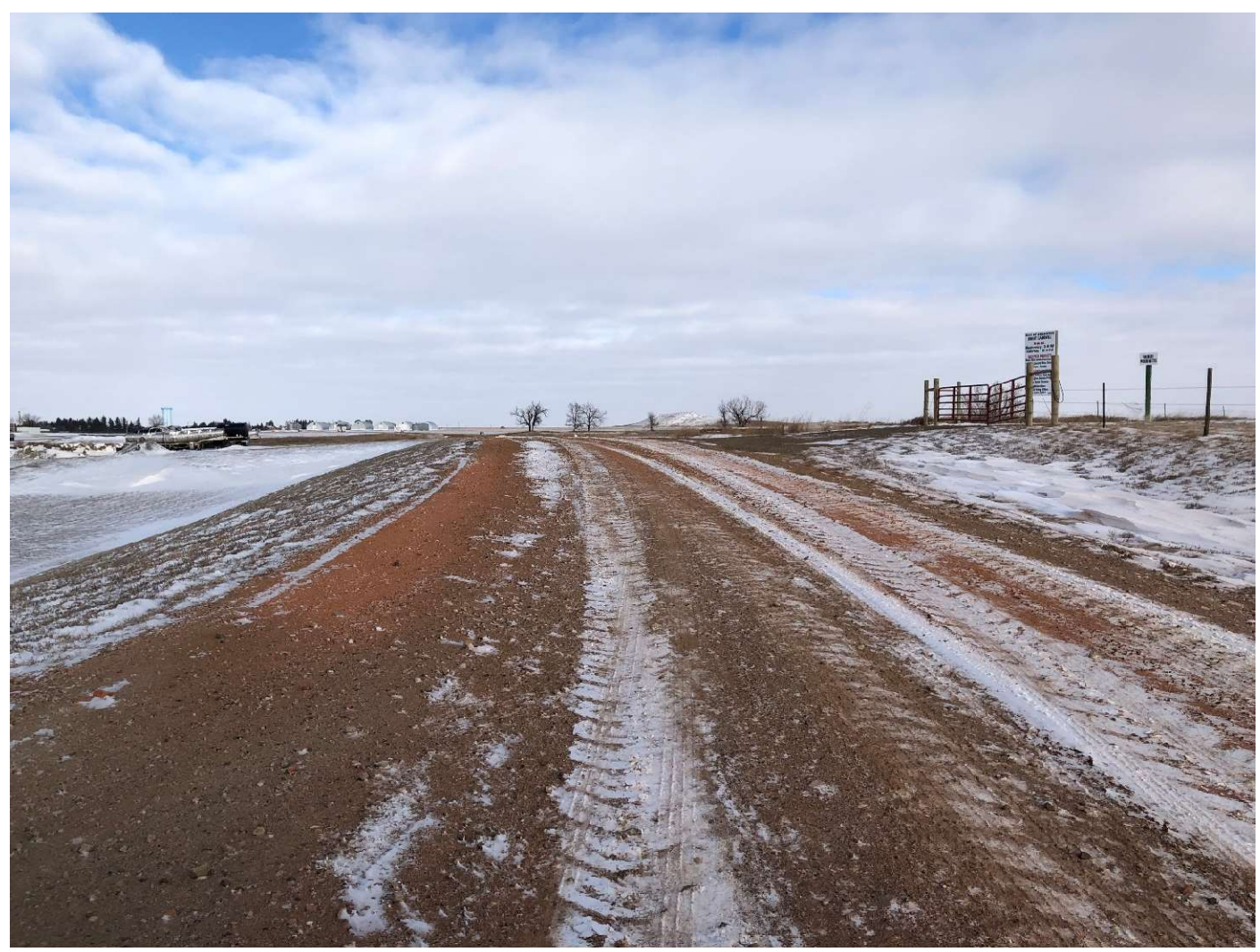
Figure 4: Access Road to Scranton Equity