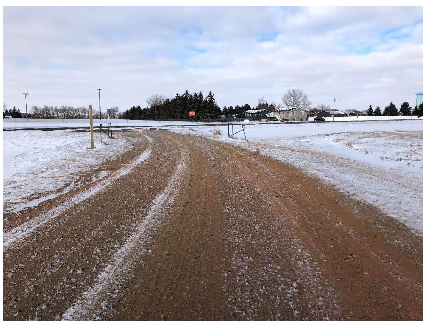
Figure 1: Access Road to Scranton Equity