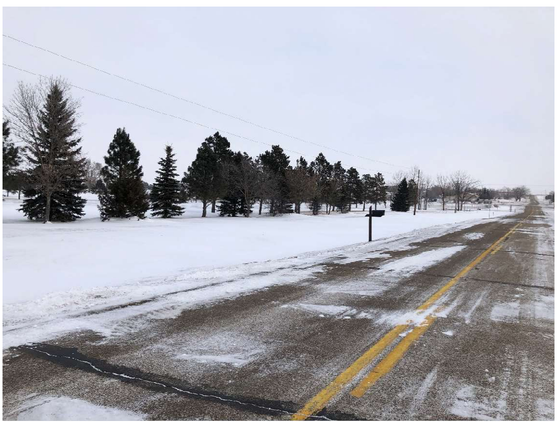
Figure 9: HWY 10 Right of Way, New Salem