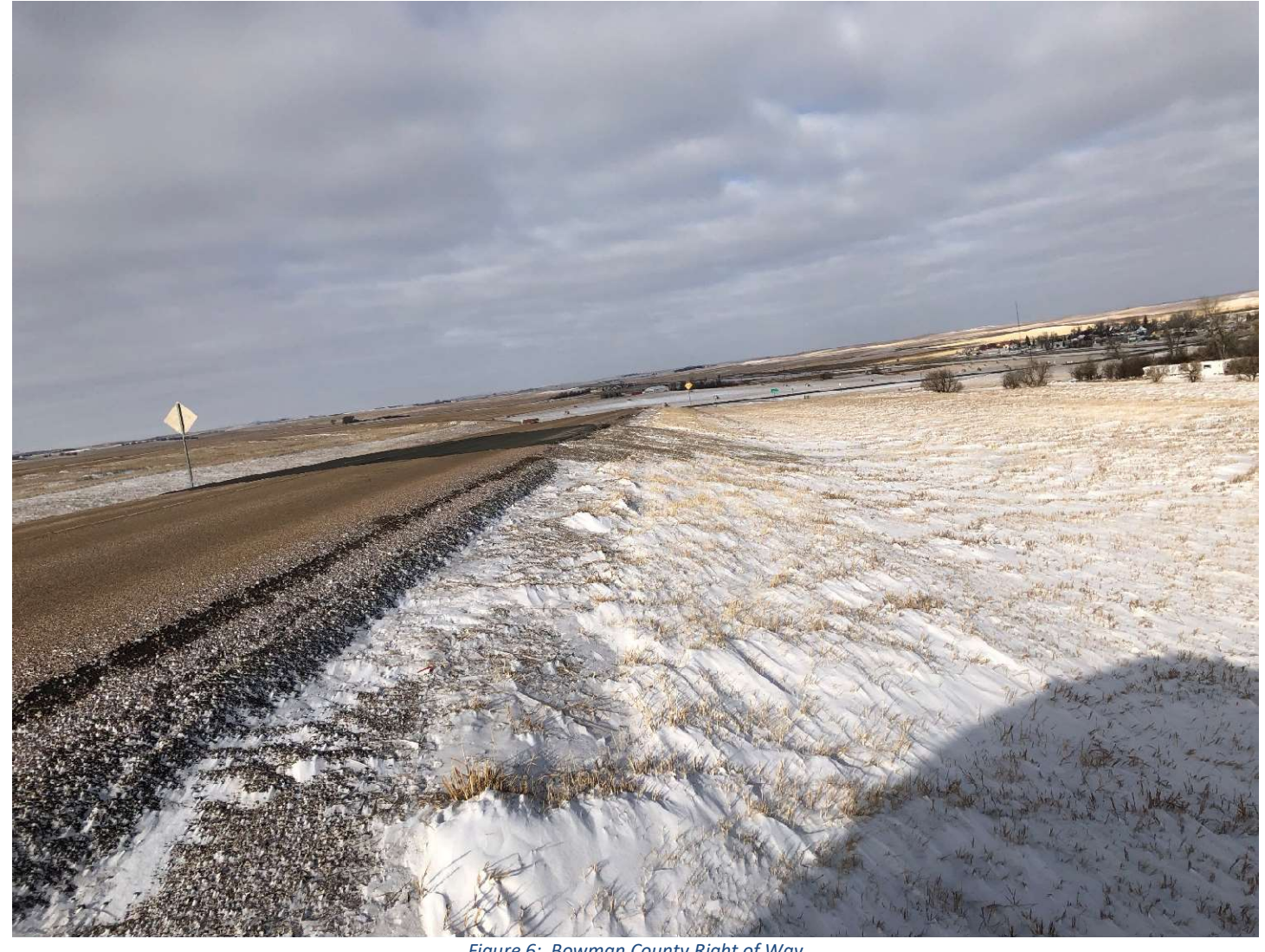
Figure 6: Bowman County Right of Way