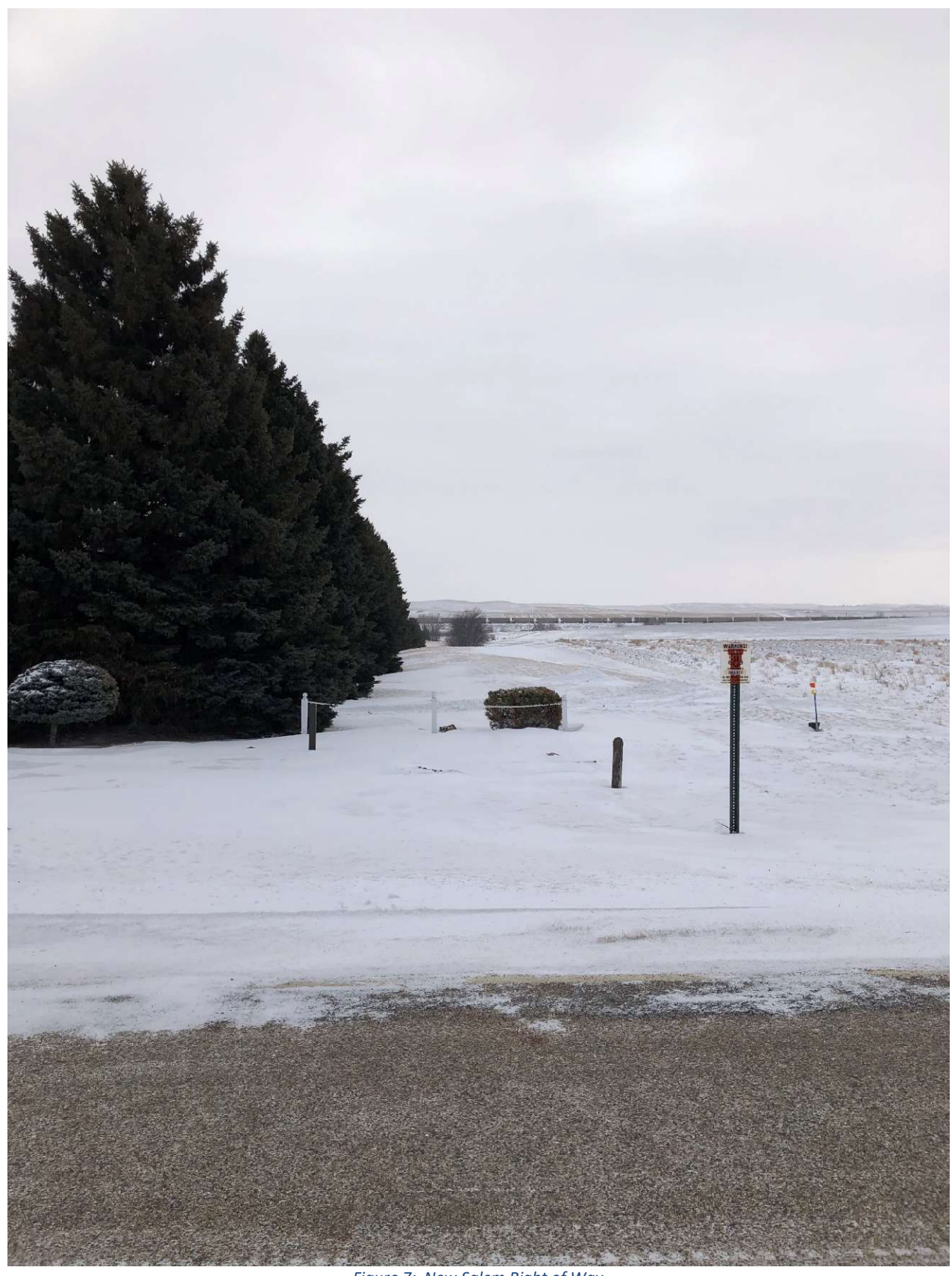
Figure 7: New Salem Right of Way