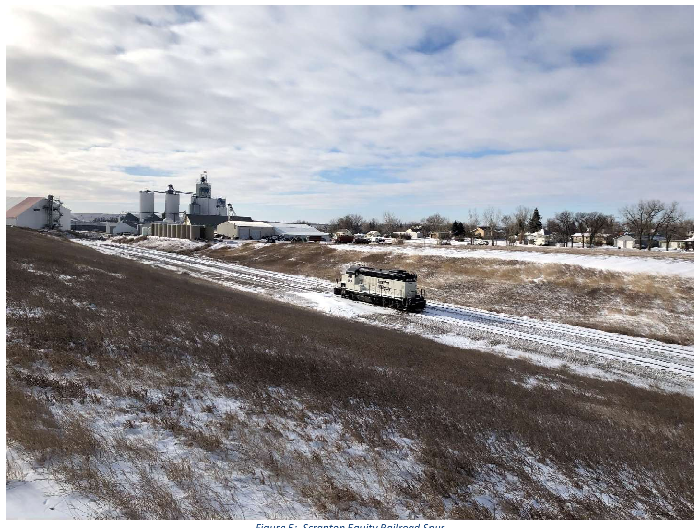
Figure 5: Scranton Equity Railroad Spur