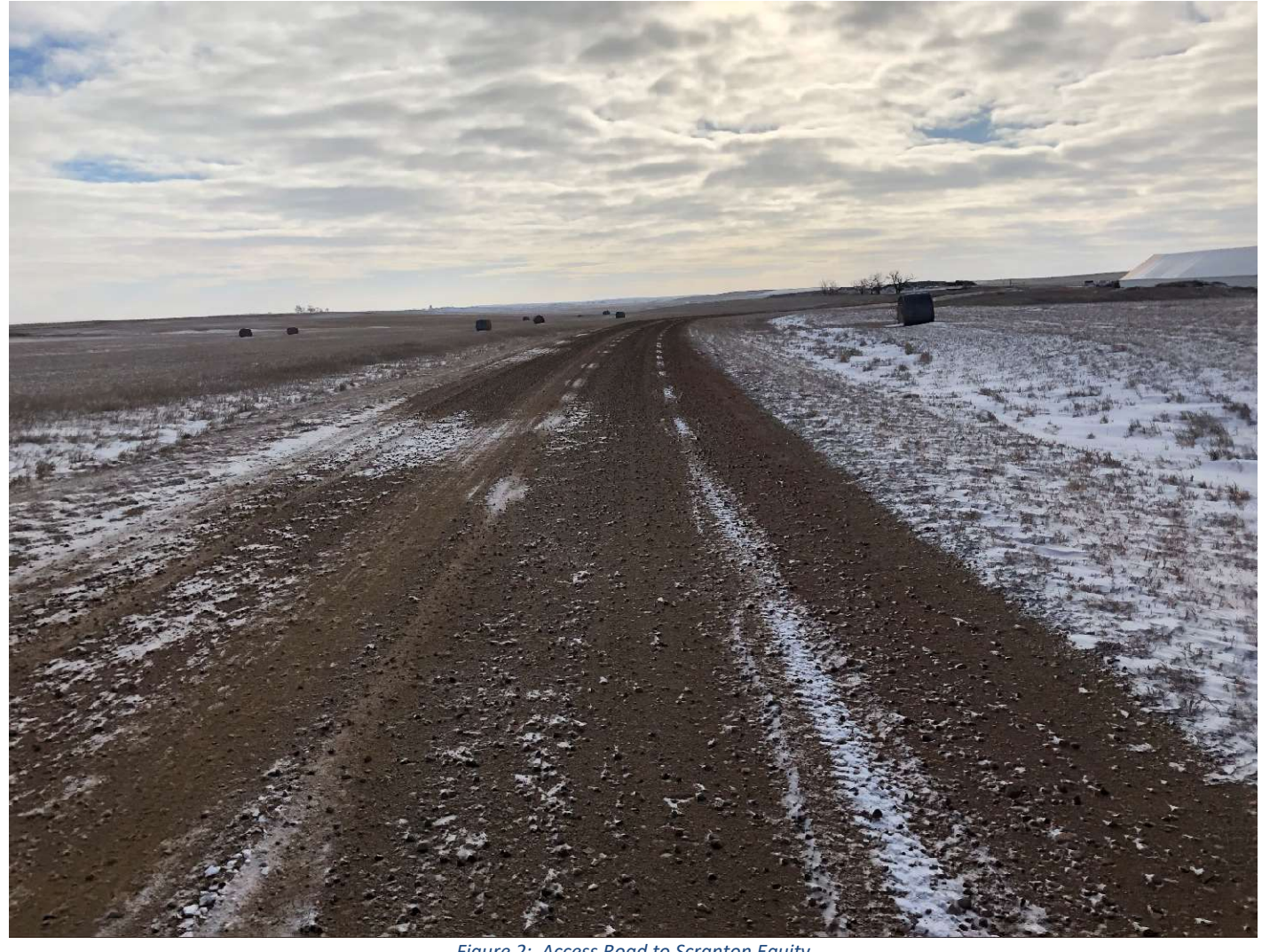
Figure 2: Access Road to Scranton Equity