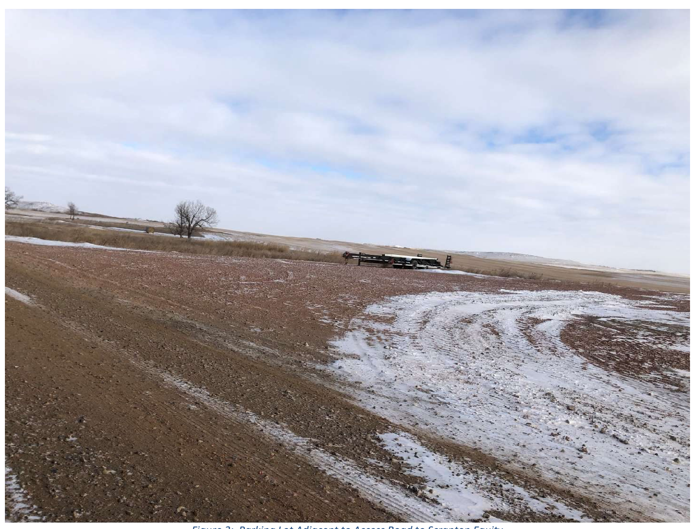
Figure 3: Parking Lot Adjacent to Access Road to Scranton Equity