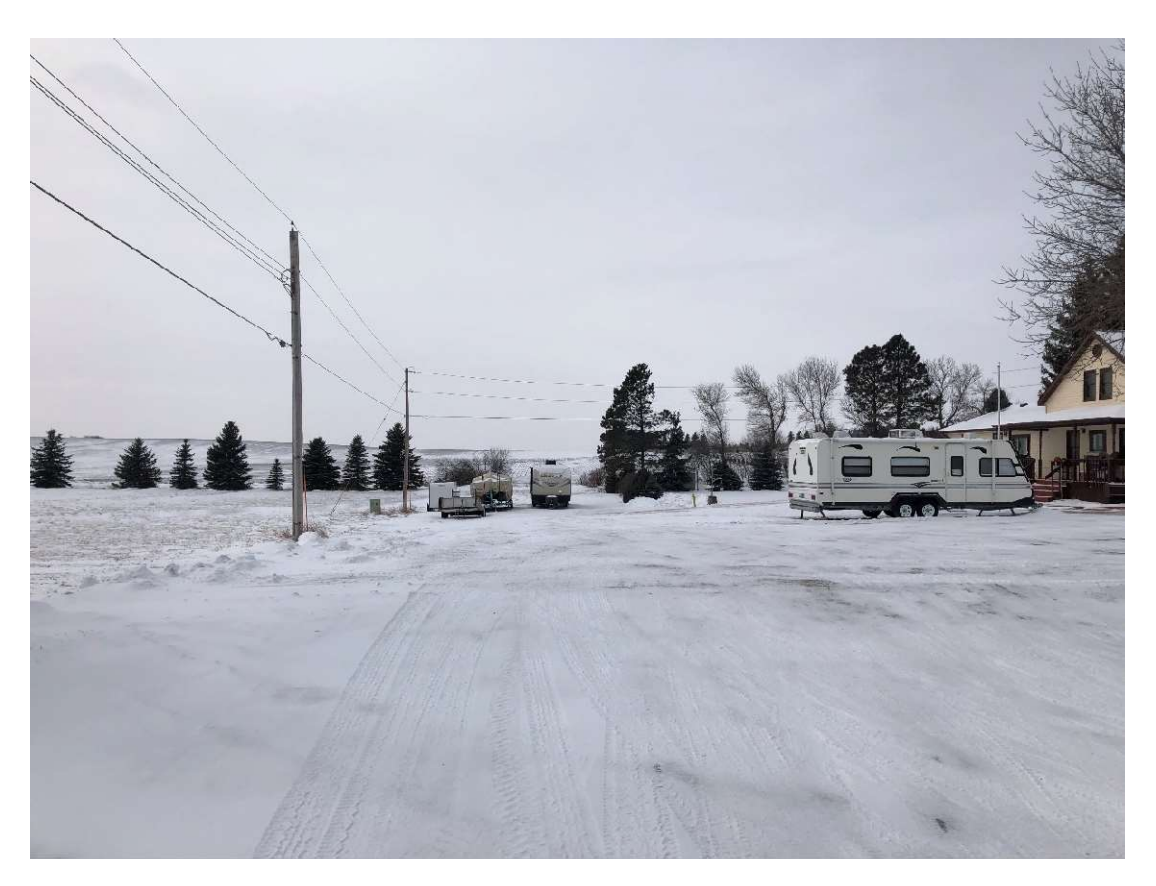
Figure 8: New Salem Right of Way