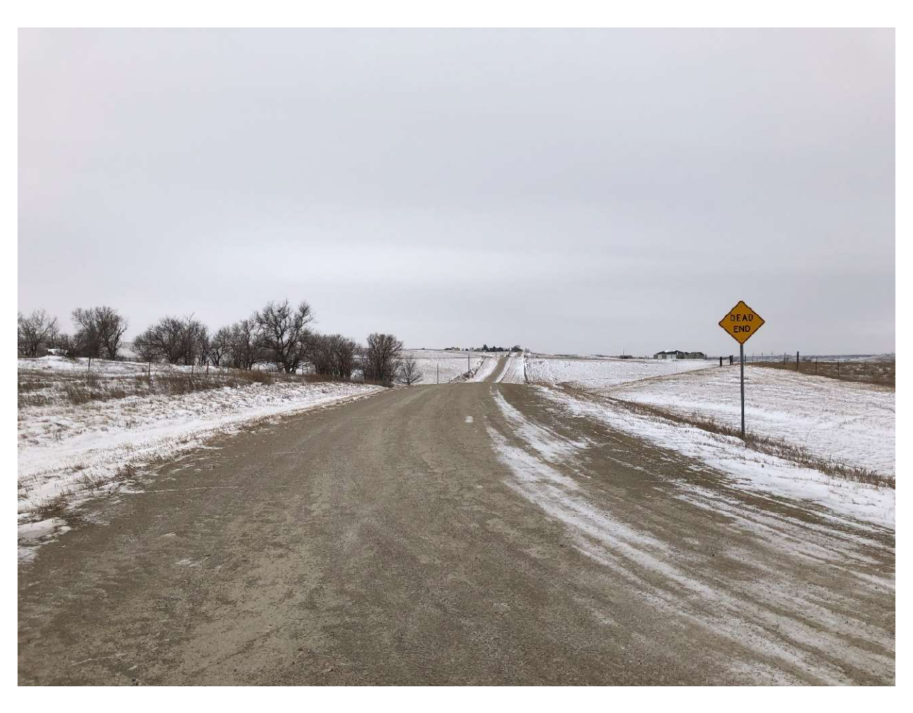
Figure 11 – 38<sup>th</sup> St SW, Stark County Right of Way