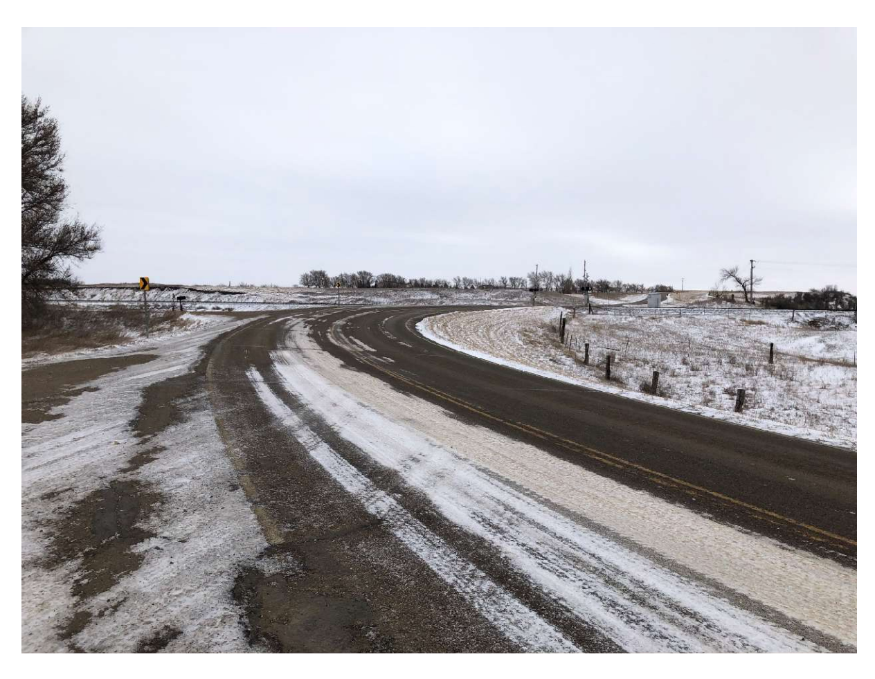
Figure 2 – Lehigh Road, Stark County Right of Way