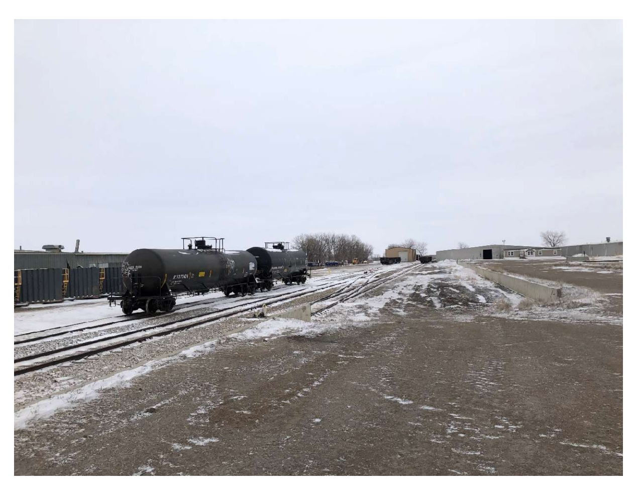
Figure 8 – Gascoyne Materials Handling & Recycling Rail Spur