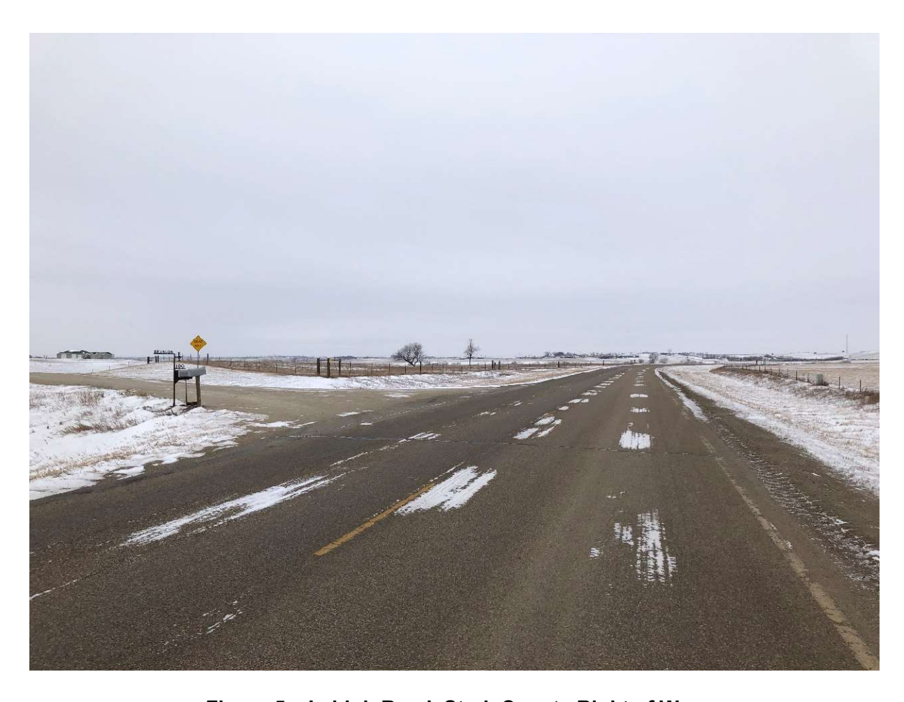
Figure 5 – Lehigh Road, Stark County Right of Way