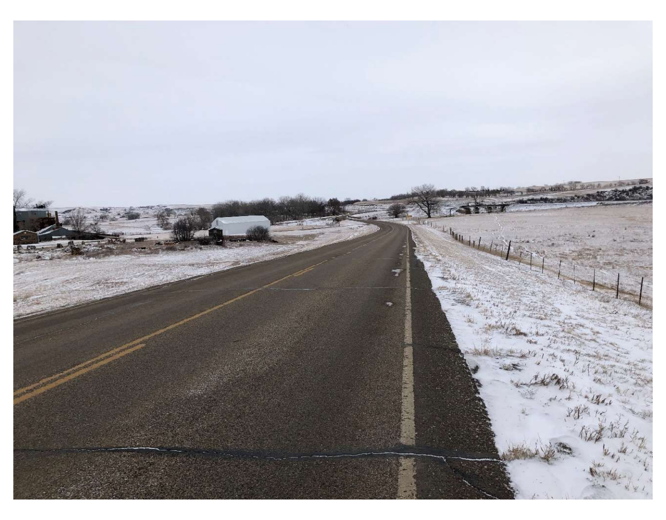
Figure 1 – Lehigh Road, Stark County Right of Way