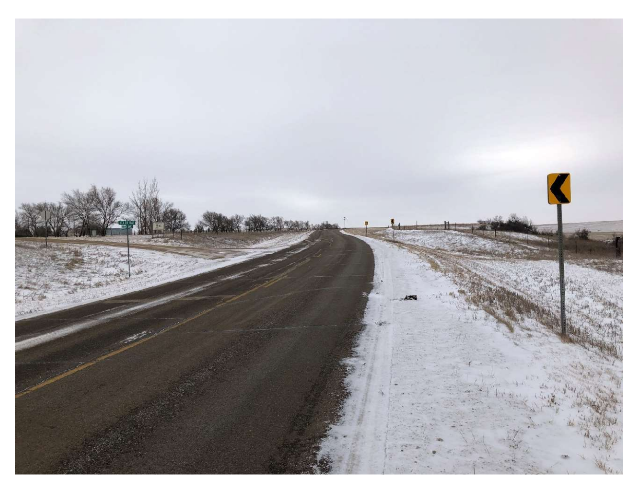
Figure 3 – Lehigh Road and Lehigh Drive Intersection, Stark County Right of Way