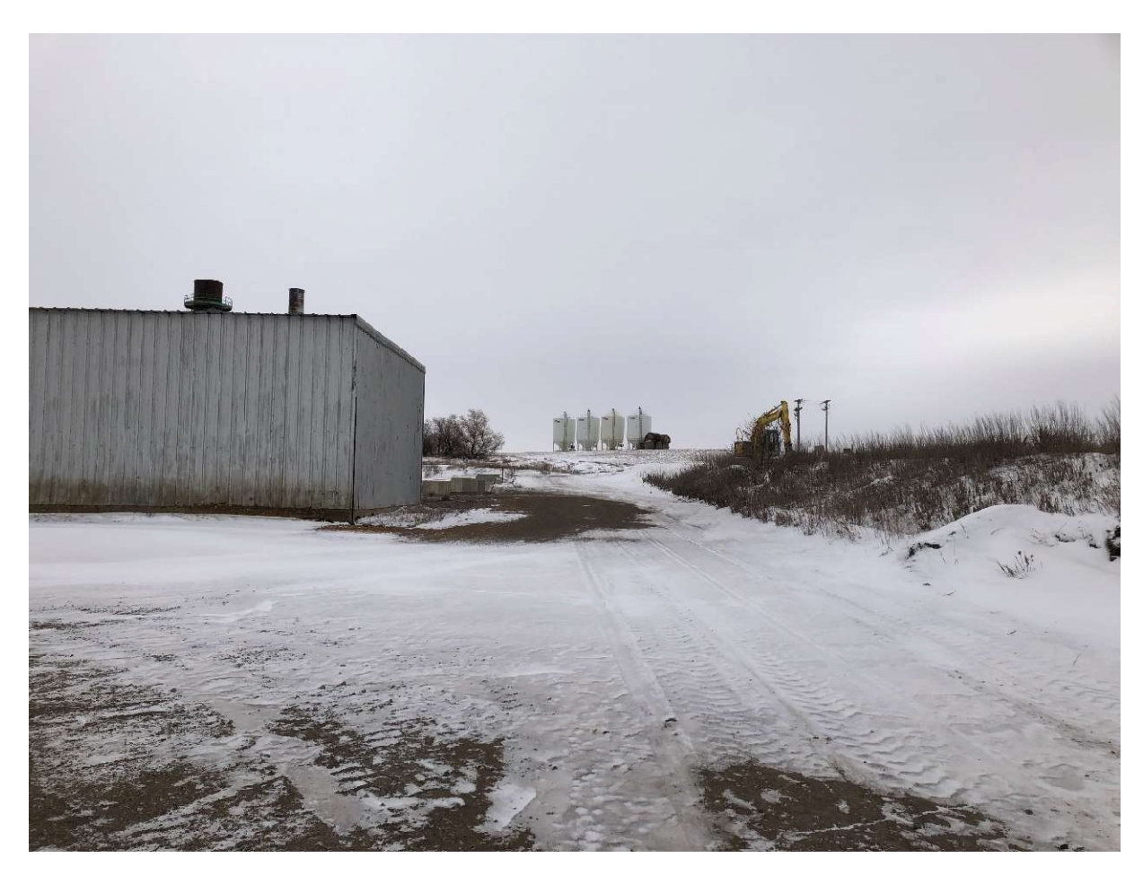
Figure 7 – Gascoyne Materials Handling & Recycling Storage Buildings