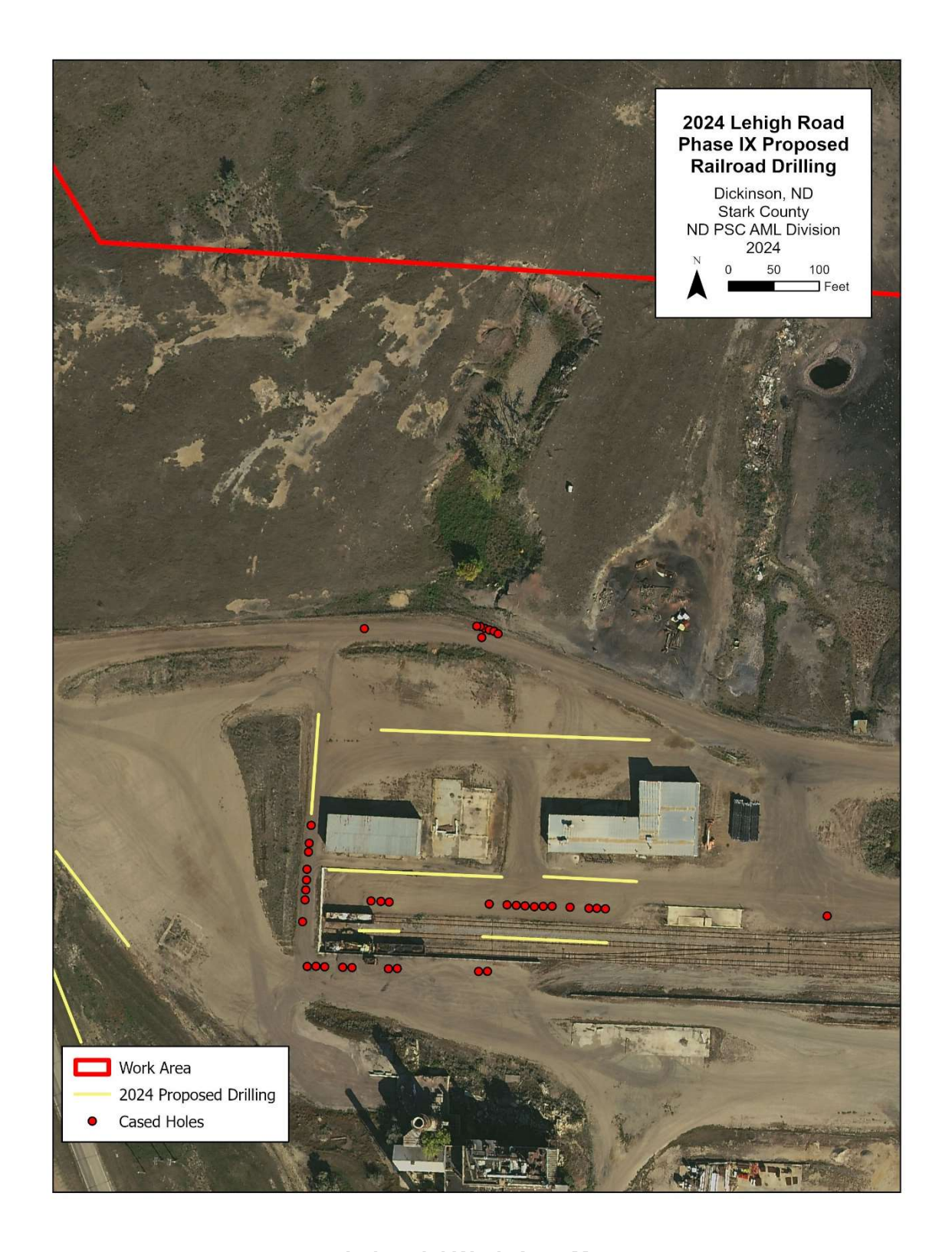
Industrial Work Area Map