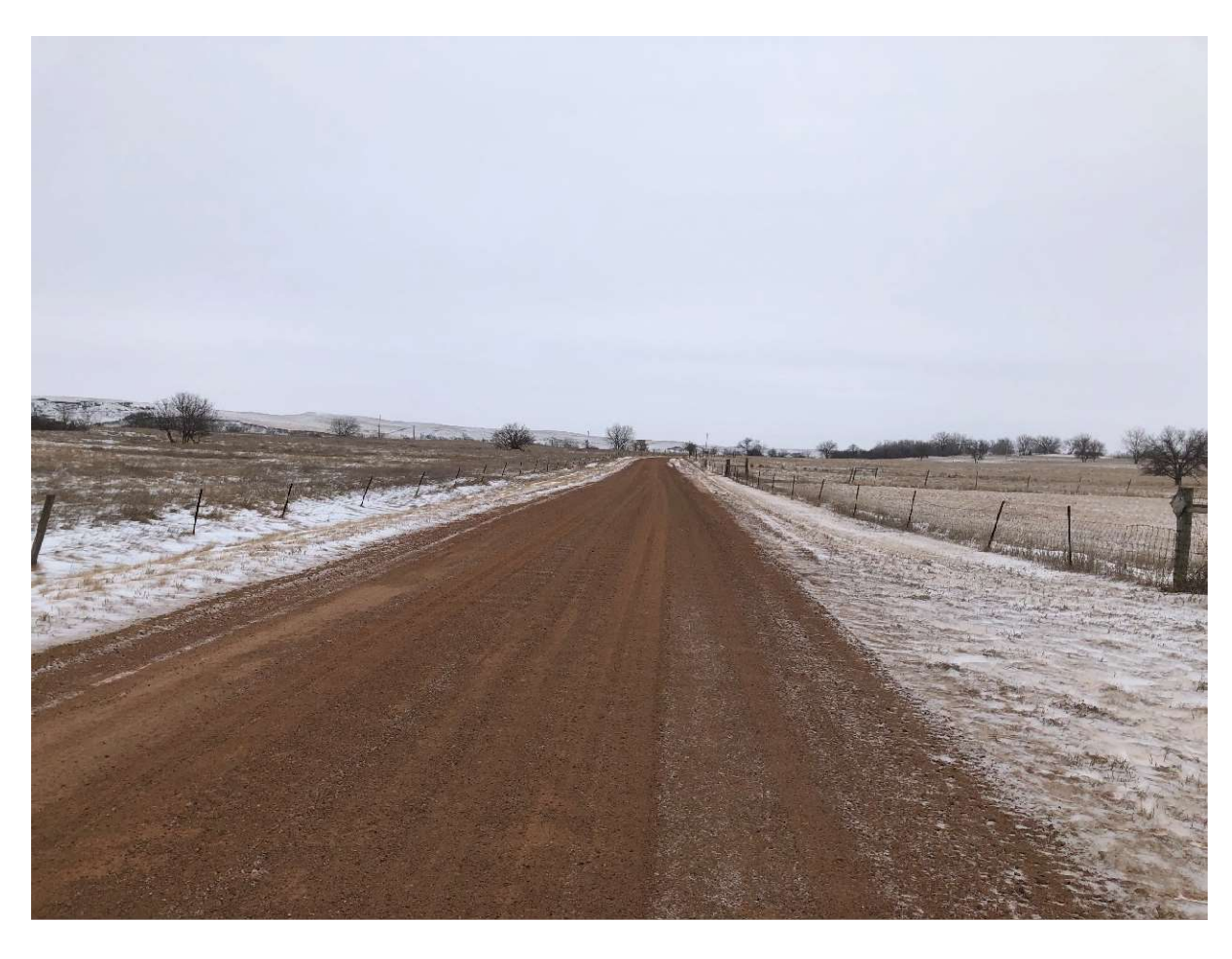
Figure 10 – Lehigh Drive, Stark County Right of Way