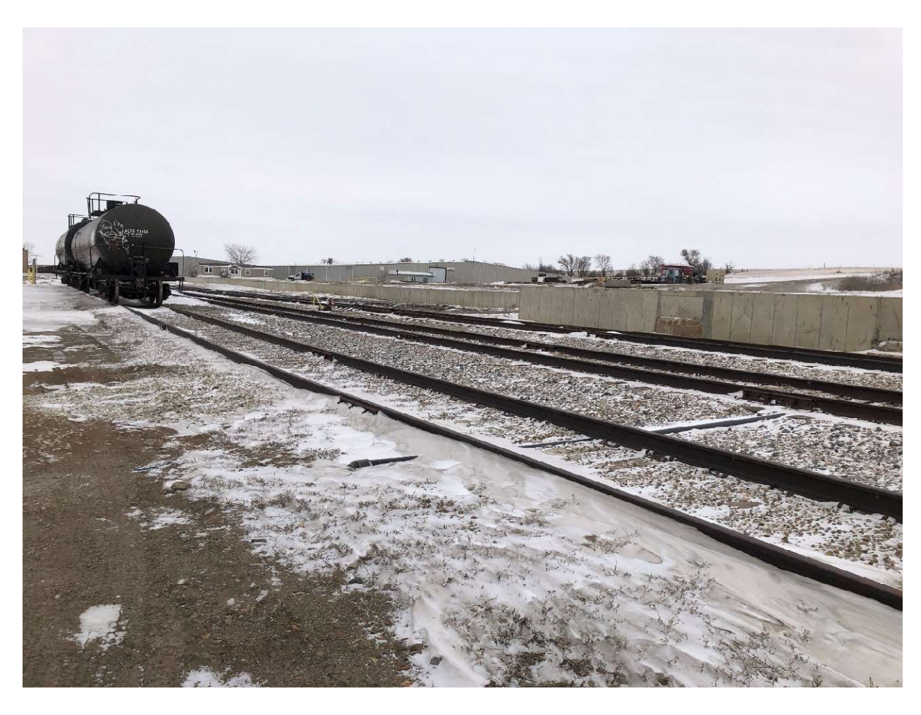
Figure 9 – Gascoyne Materials Handling & Recycling Rail Spur