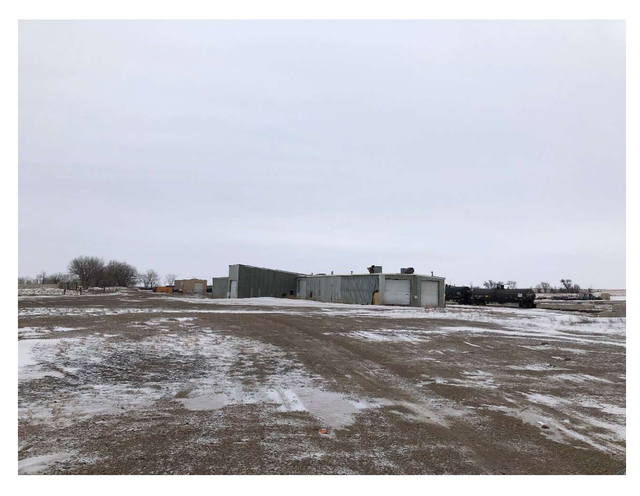
Figure 6 – Gascoyne Materials Handling & Recycling Storage Buildings