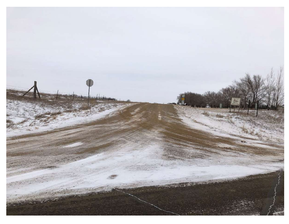
Figure 4 – Lehigh Road and Lehigh Drive Intersection, Stark County Right of Way