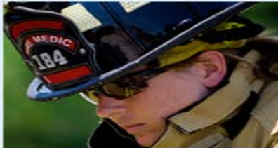
Government & Emergency Officials