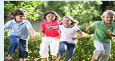
Residents & Businesses