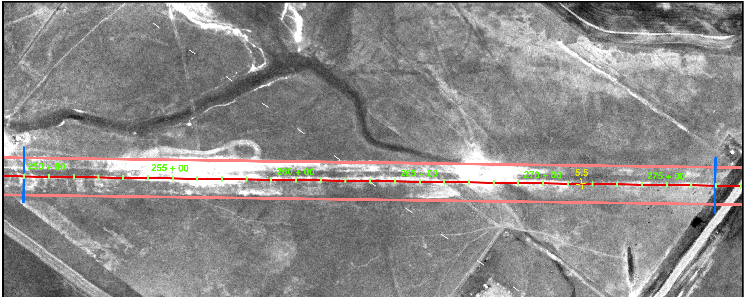
Vegetation Associated with Survey Points (No survey points recorded)