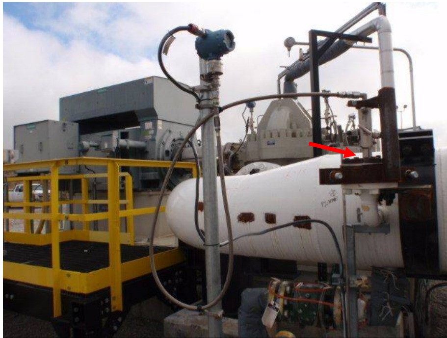
Figure 1. Original PT-10x1 & PT-10x3 manifold design. The red arrow points to the stress concentration area in the manifold "neck".