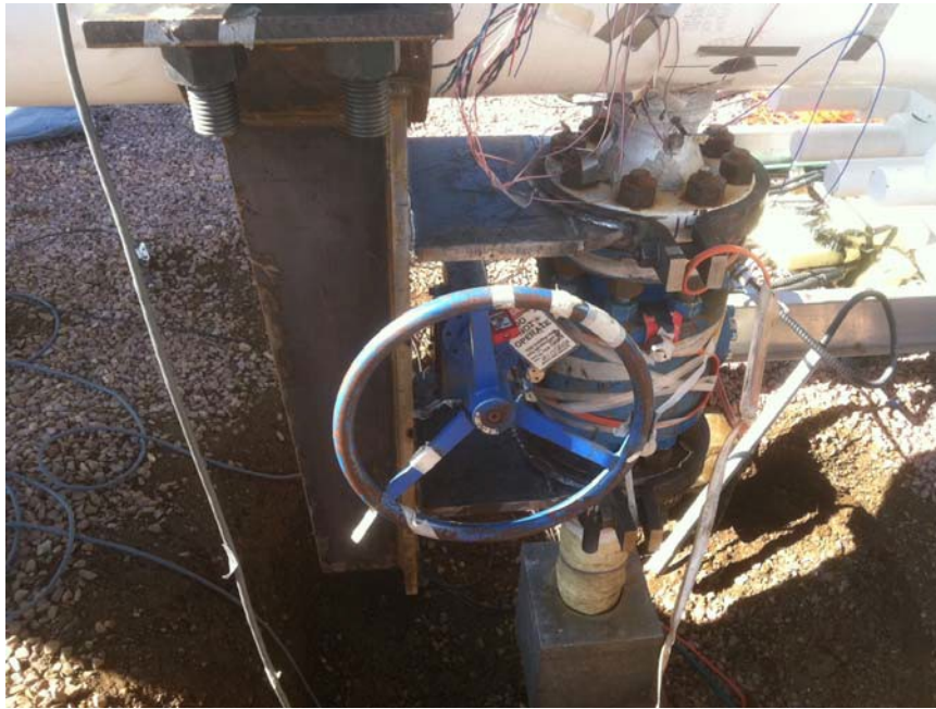
Single plane TV-0052 drain line brace. Design #1 based on the NPS 20 pipe clamp.

Vibration and Strain testing of the single plane drain adjacent to the Pressure Control Valve carried out at Wilber VFD station at 1000 kW energy dissipation across the station Pressure Control Valve determined that piping stresses are acceptable without bracing. Based on the Wilber testing results and subsequent FEA analysis summarized in Figure 3 below, no bracing of the single plain drains at the VFD stations are required.