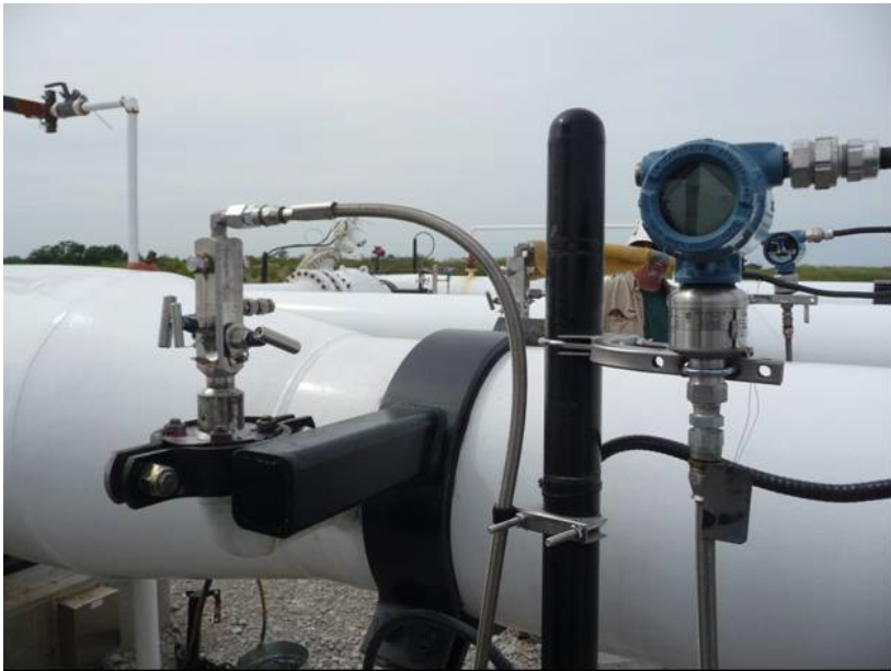
Figure 3. Modified PT-2207 manifold at Patoka Delivery Terminal.