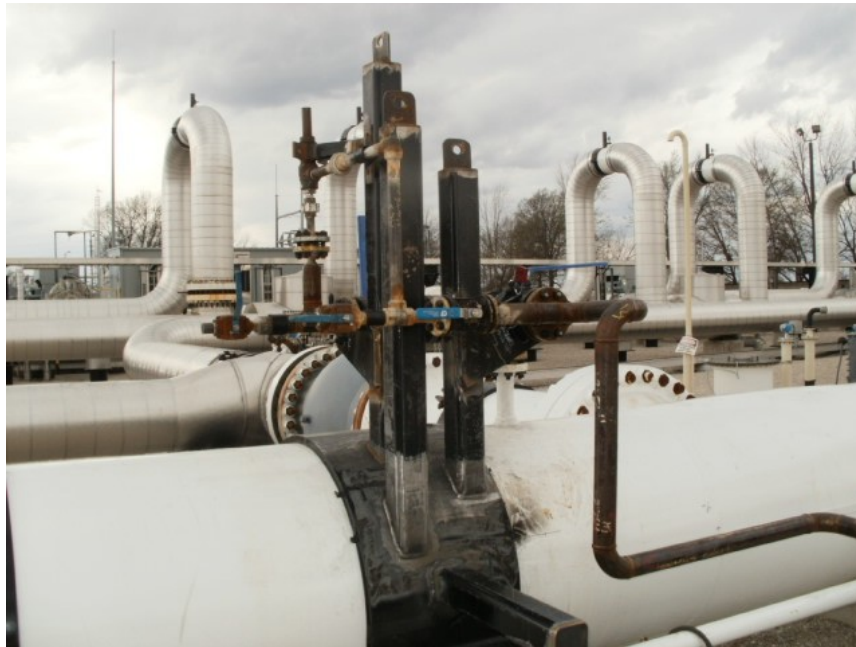
Salisbury pig receiver PSV piping and bracing modification.