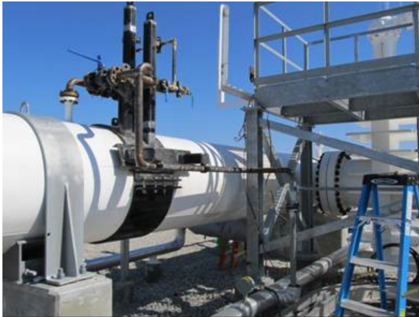
Steele City Cushing Extension pig launcher PSV piping and bracing modification.