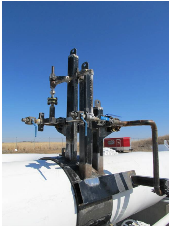
Steele City pig receiver PSV piping and bracing modification.