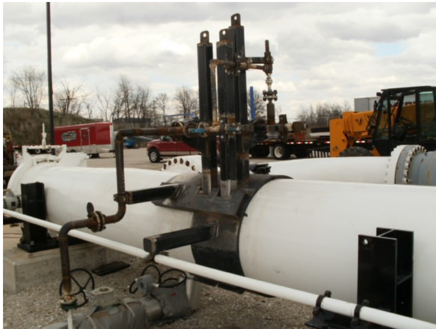
Salisbury pig launcher PSV piping and bracing modification.