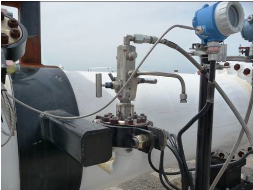
Figure 2. Modified PT-2204 manifold at Patoka Delivery Terminal.

from the Terminal PCV (four manifolds at each Terminal). Figures 2 and 3 show the modification completed on PT-2204 and PT-2207 at Patoka Delivery Terminal.