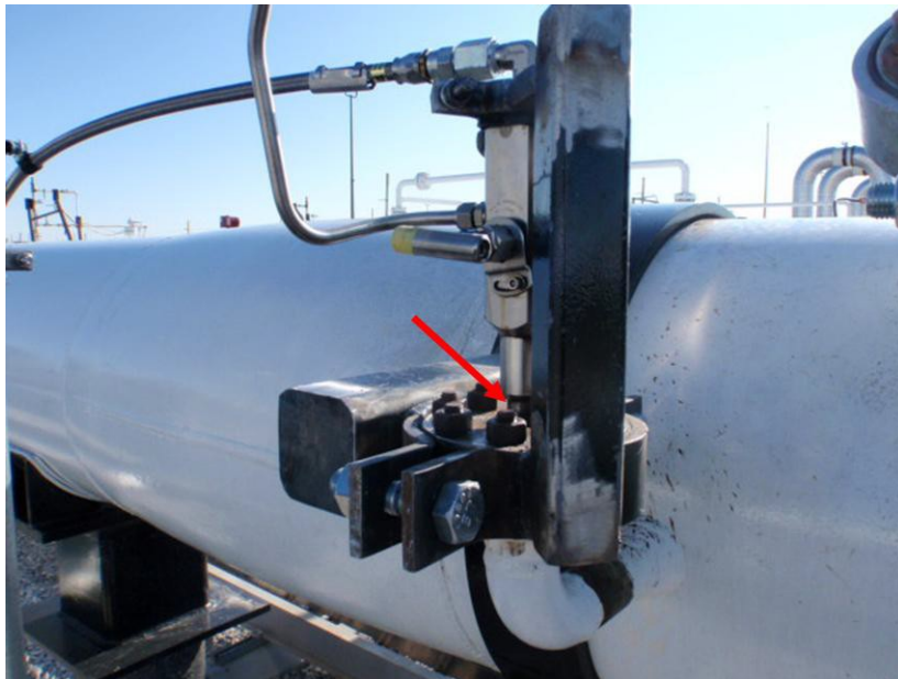
Figure 1. Typical PT-201 & PT-203 nozzle and manifold bracing. The red arrow points to the stress concentration area in the manifold “neck”.

As reported in the April 2012 Monthly Report, validation testing carried out during Q1 2012 Vibration Remediation Work revealed that vibration of the PT-201 and PT-203 manifolds located upstream and downstream from the station Pressure Control Valve exceeded limits specified in the Keystone Vibration Evaluation Criteria at some VFD stations. The manifold bracing, shown below, proved to be ineffective in reducing the vibration to acceptable levels. The concern is the stress concentration area (“neck”) at the bottom of the manifold, indicated by the red arrow in Figure 1.