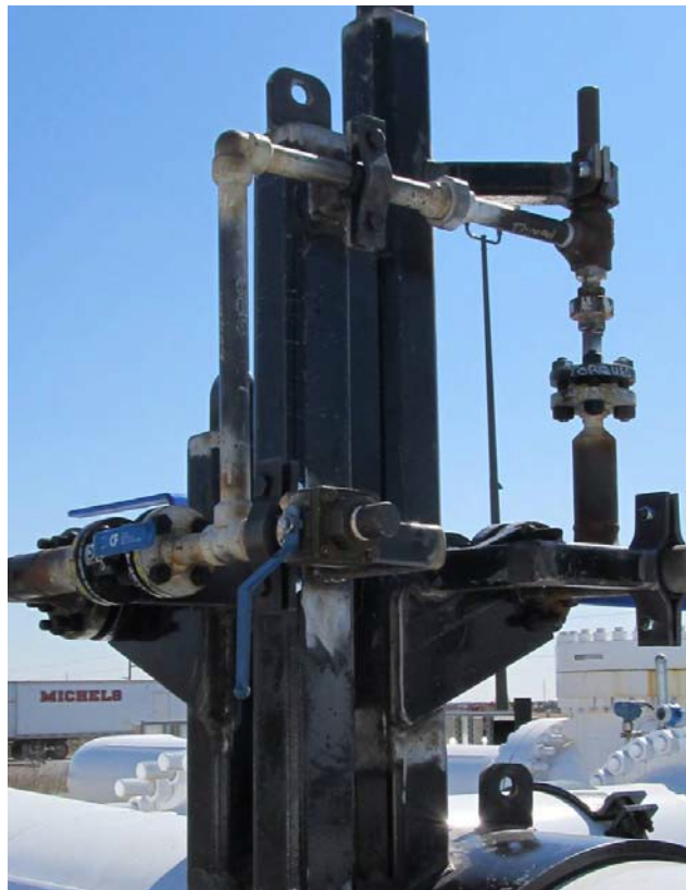
Steele City pig launcher PSV piping and bracing modification.