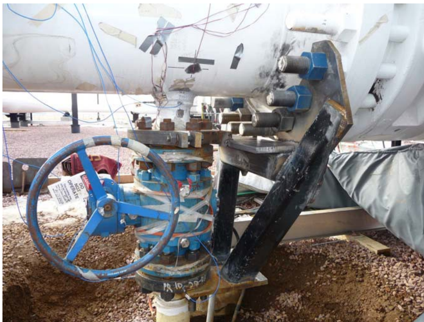
Single plane TV-0052 drain line brace. Design #2 based on the Pressure Control Valve flange grab.