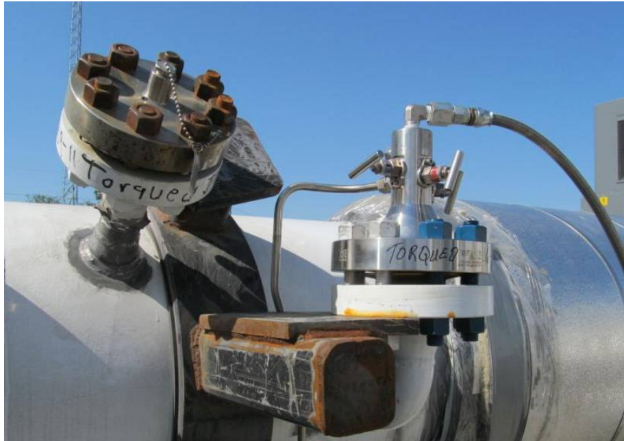
Figure 2. Wide base PT-1041 manifold installed at Seneca Fixed Speed station.