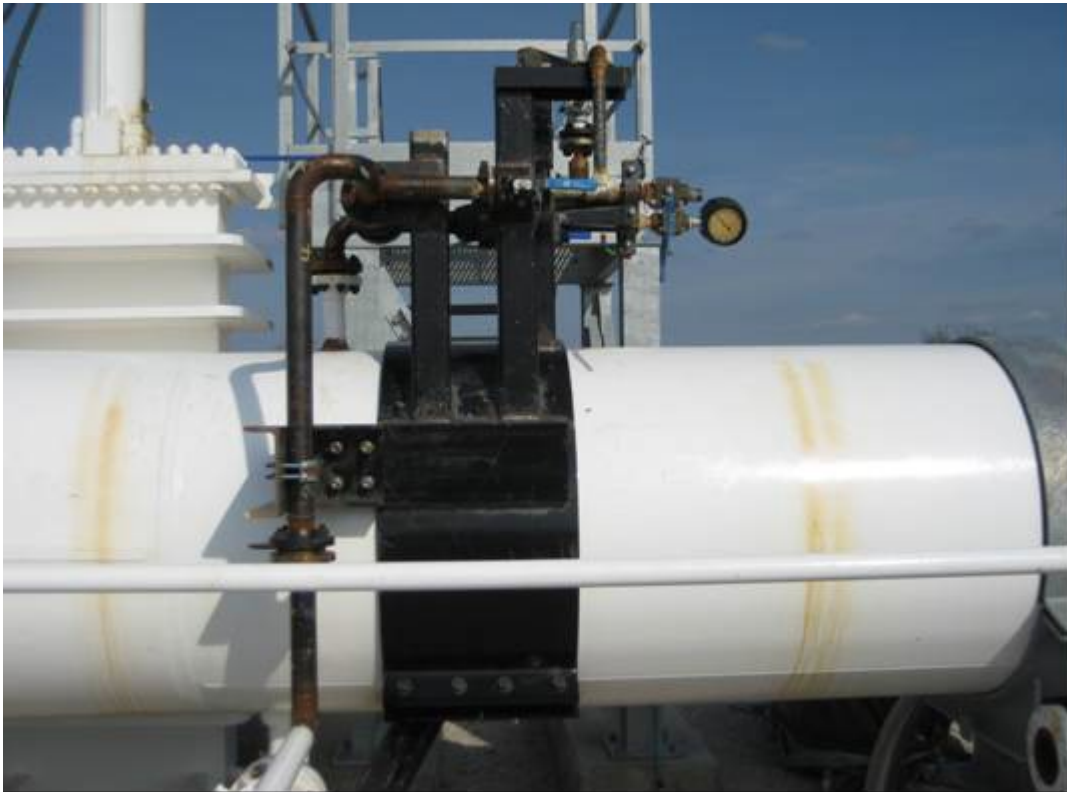
Cushing pig receiver PSV piping and bracing modification

The Pigging Barrel Pressure Safety Valve modifications have been completed at all facilities, including the Cushing Delivery Terminal (one barrel), and the Salisbury (two barrels) and Steele City (three barrels) VFD pump stations, as shown below. This completes the work scope originally defined within the Work Plan submitted to PHMSA on September 1, 2011 and approved on October 21, 2011.