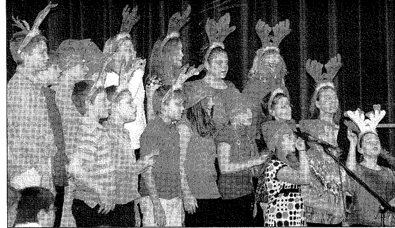
Napoleon 6th grade students singing Jingle Bells