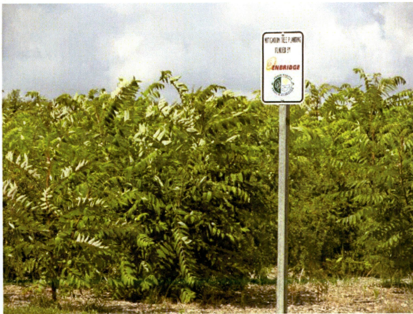
Photo 2. Sign