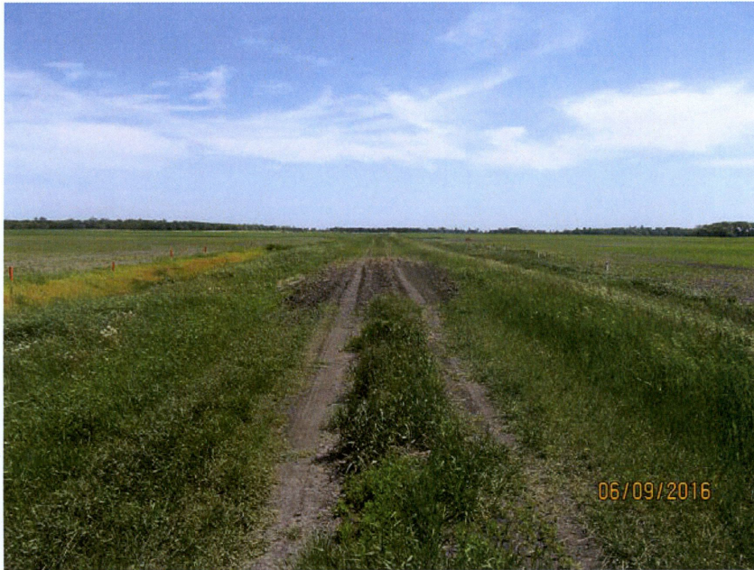
Photo 2 - 148 th Ave NE just to the southeast of Mile 778

(This location is Photo 11 from the Post Construction Inspection Report)