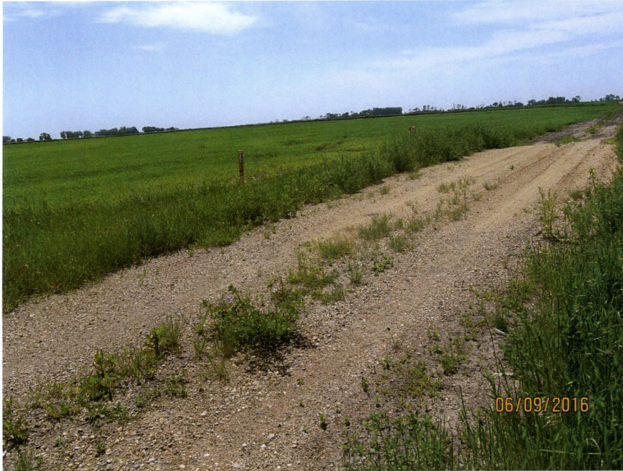
Photo 4 - 154 th Ave NE at Mile 787

(This location is Photo 30 from the Post Construction Inspection Report)