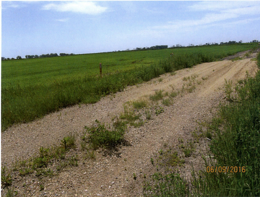
Photo 4 - 154 th Ave NE at Mile 787

(This location is Photo 30 from the Post Construction Inspection Report)