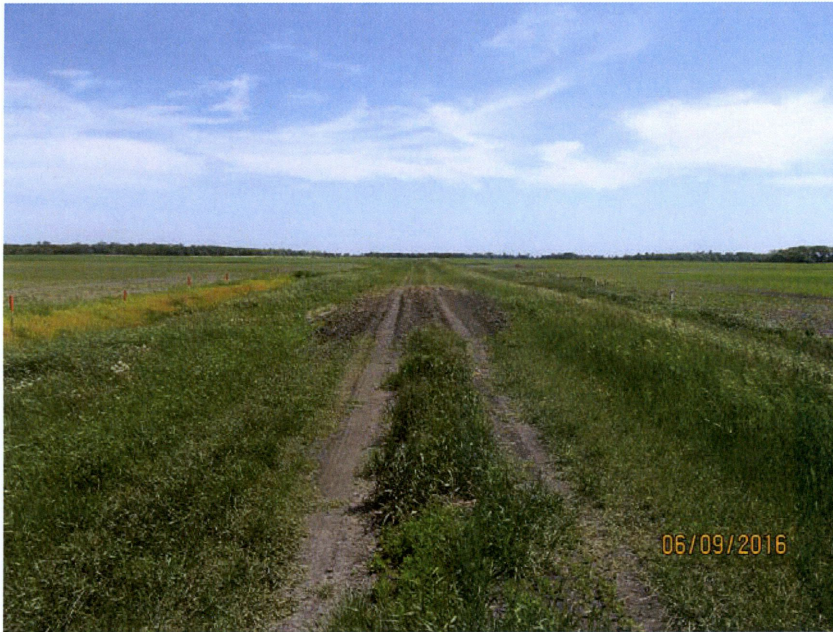
Photo 2 - 148 th Ave NE just to the southeast of Mile 778

(This location is Photo 11 from the Post Construction Inspection Report)