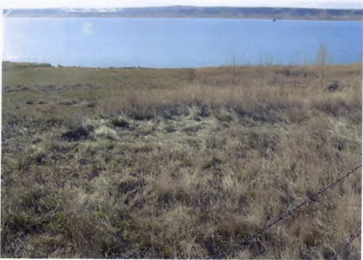
Location 1 Looking SSE