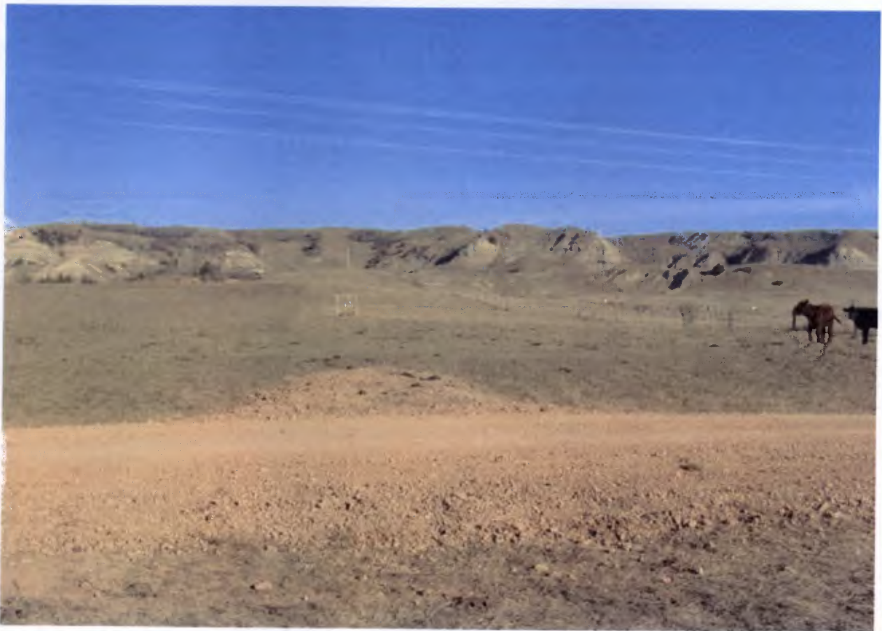
Location 3 Looking North