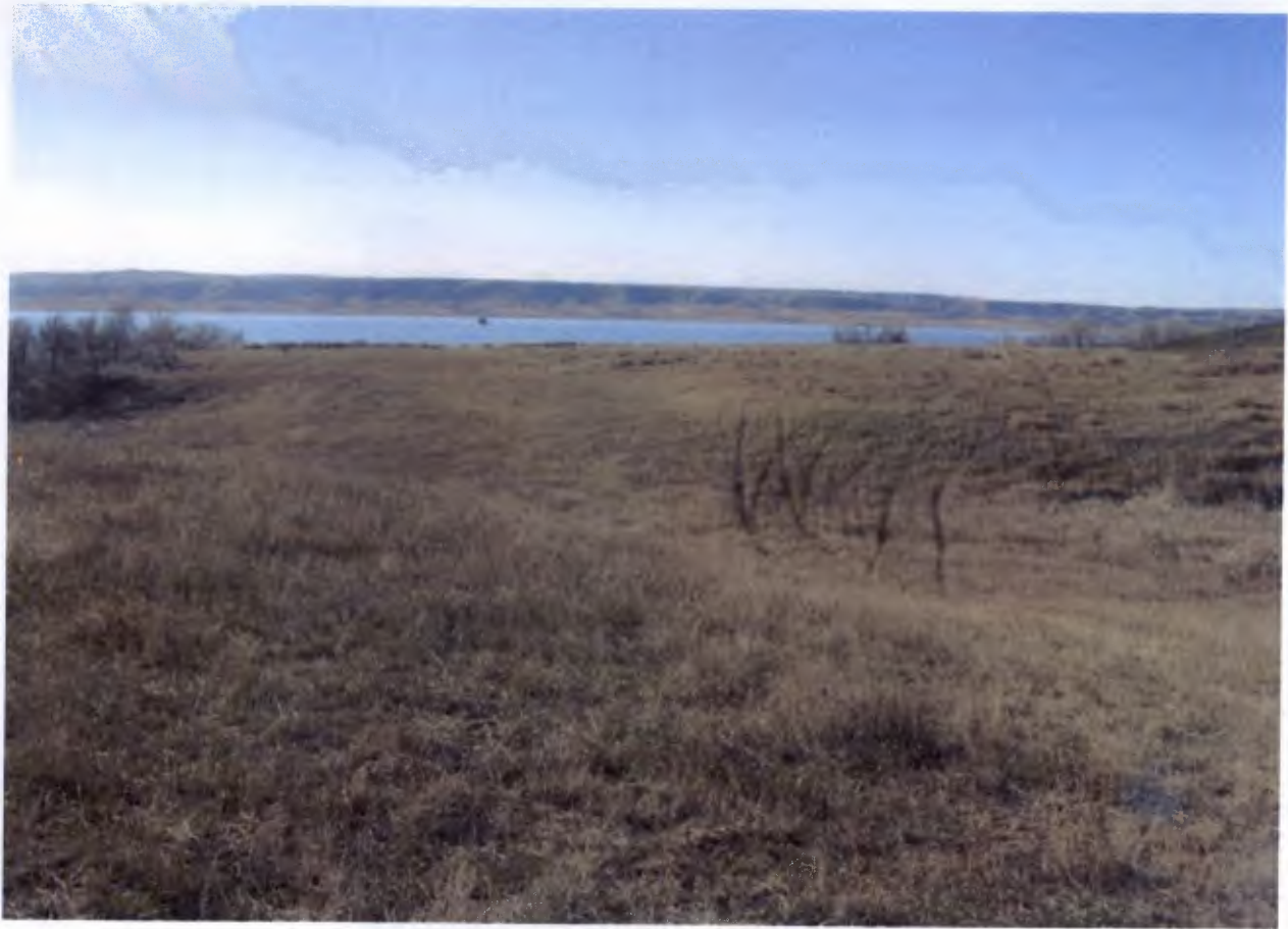
Location 3 Looking South