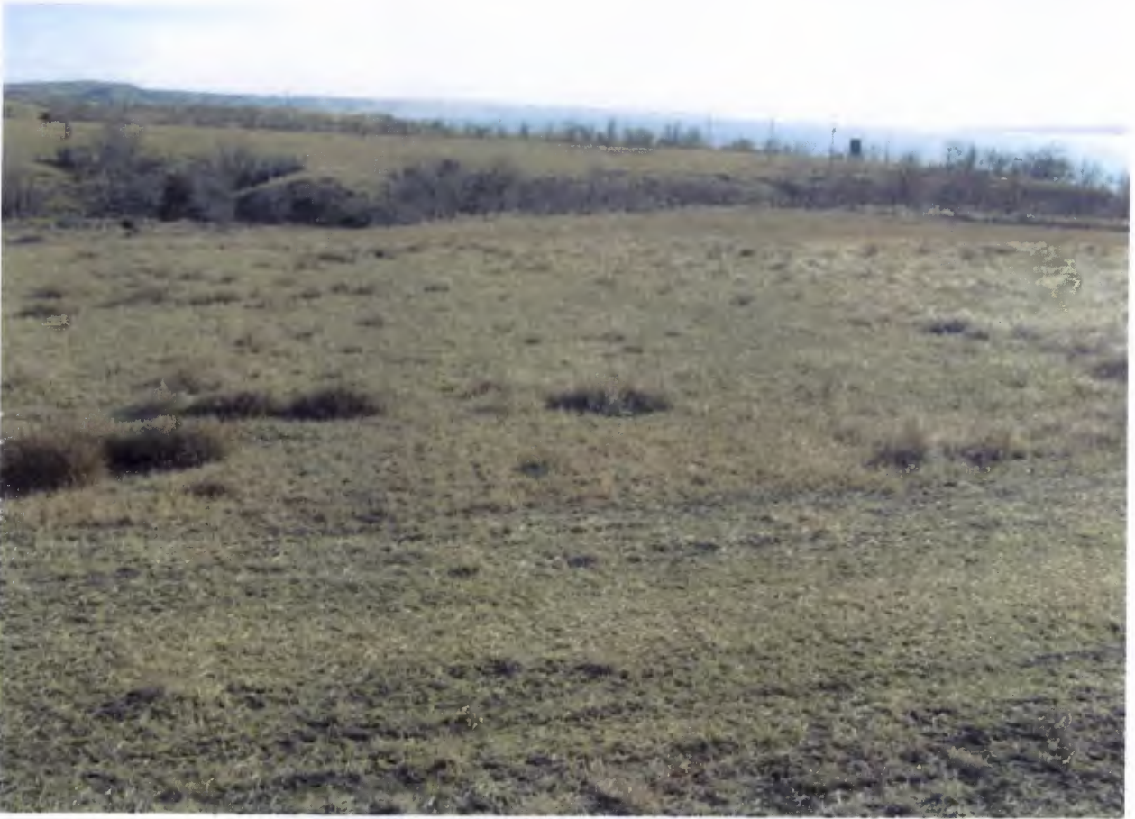
Location 2 Looking SE