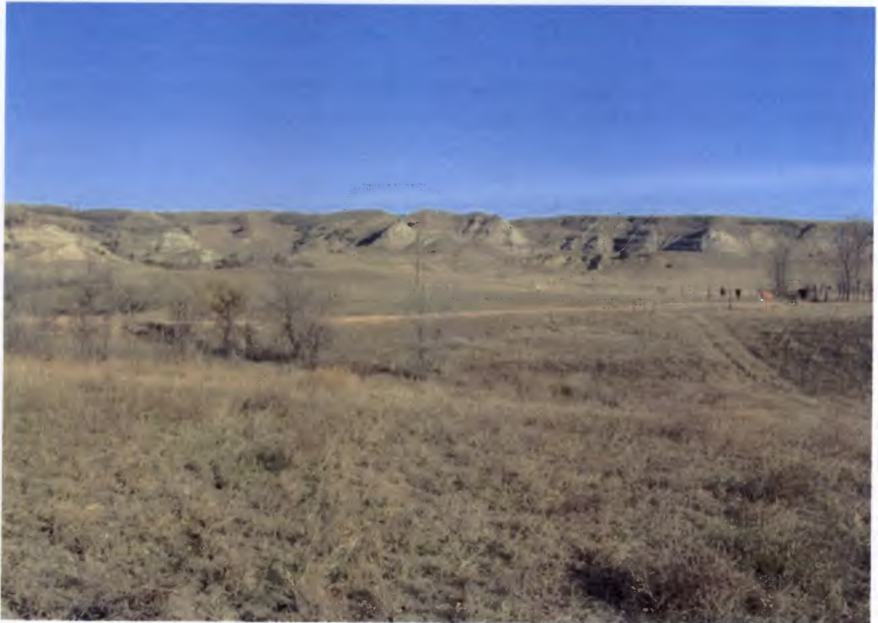
Location 2 Looking NNE