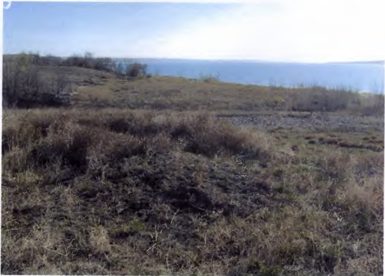
Location 1 Looking SE