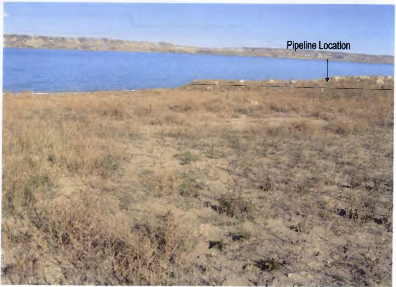
South Side of Pipeline Easement Area (Shoreline)