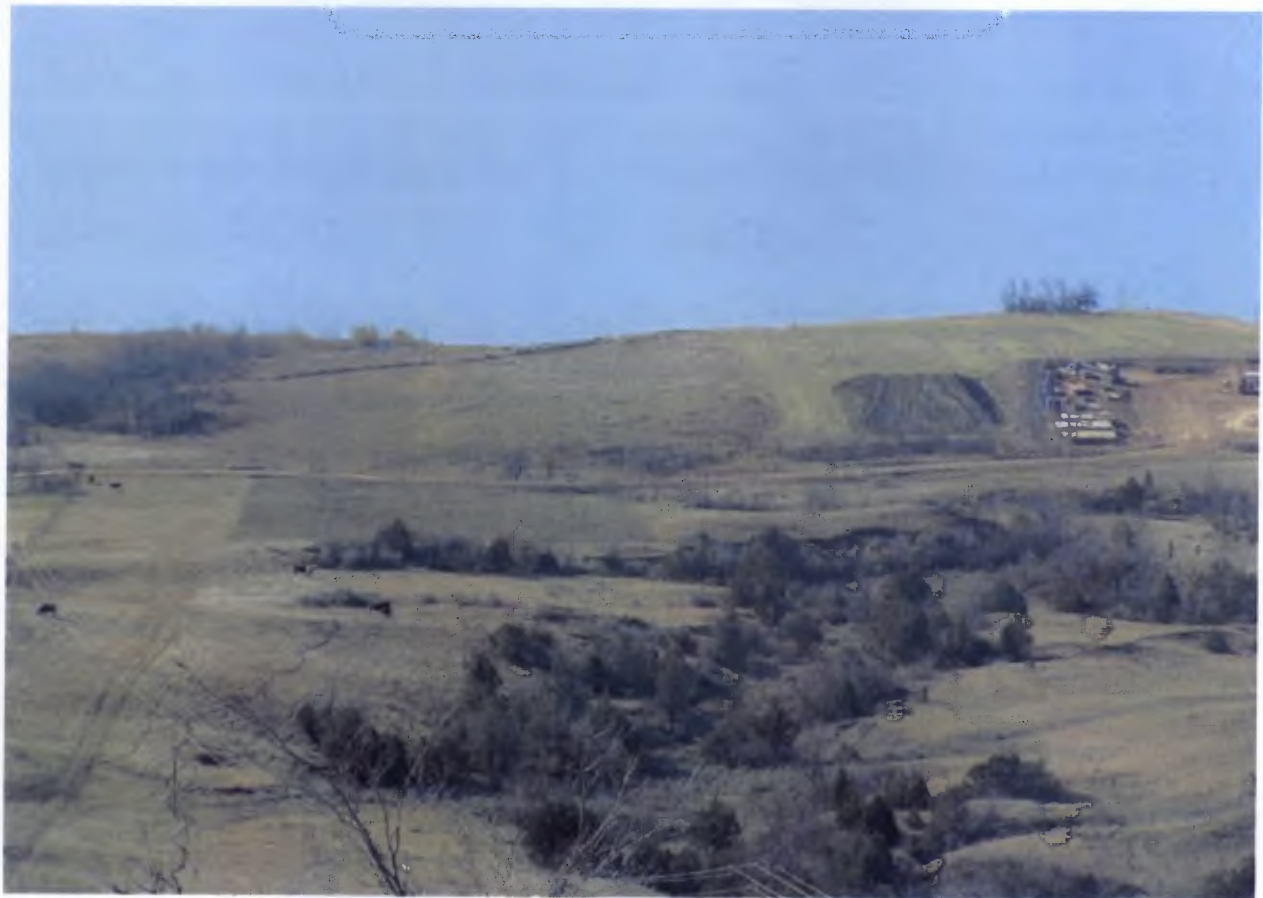
North Side of Pipeline Easement Area