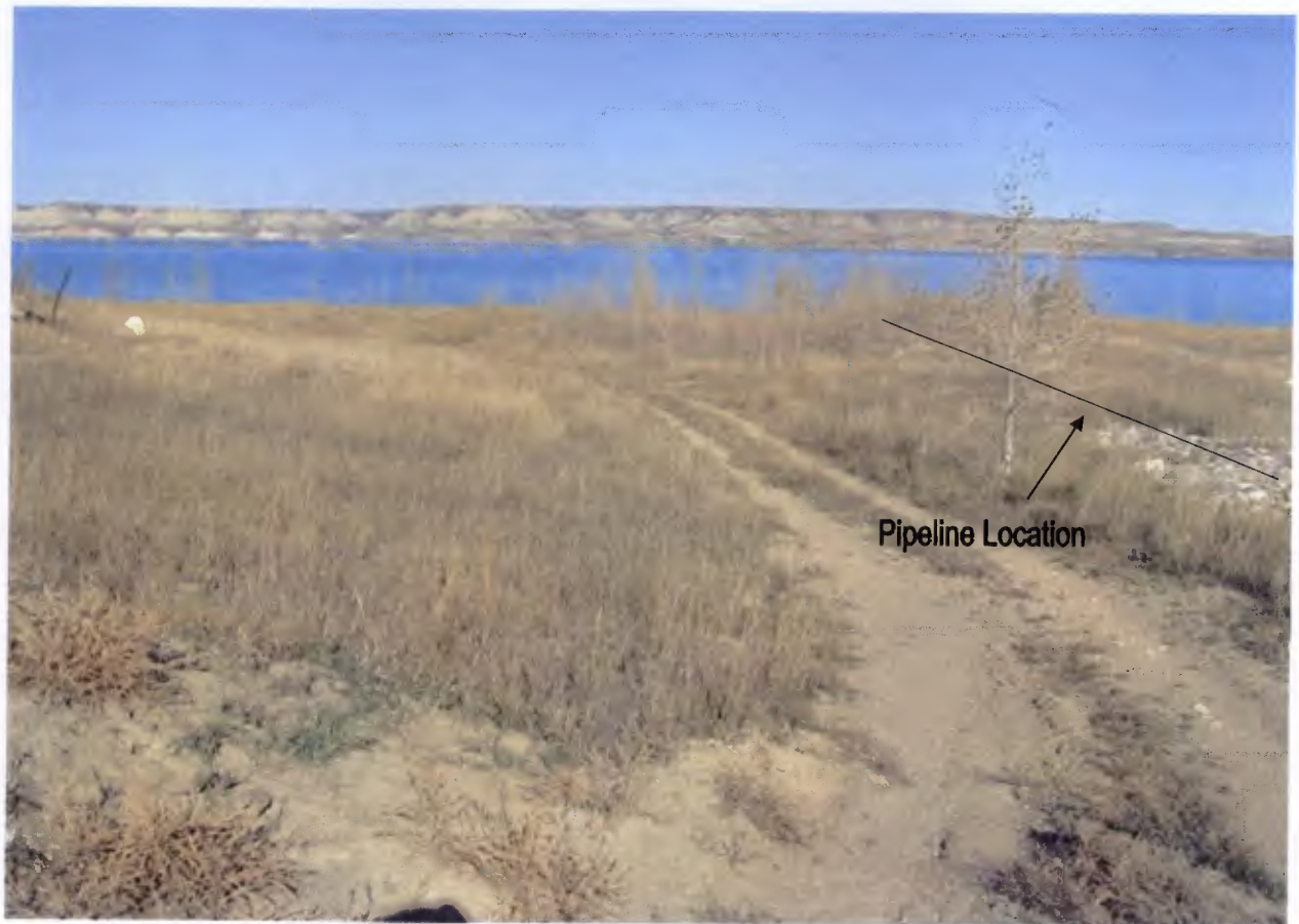
South Side of Pipeline Easement Area