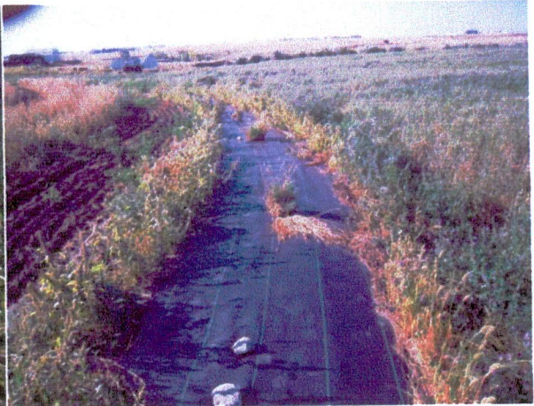
Swensrud tree planting area