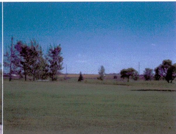
City of Ray (Golf Course) tree planting area