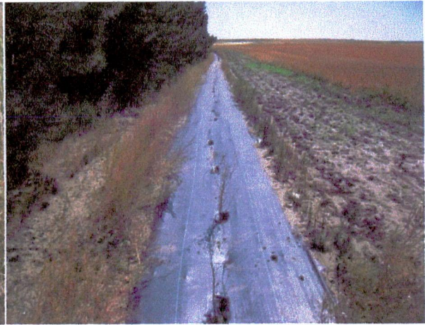
Kalil tree planting area.

Hughes tree planting area - Photographs not available