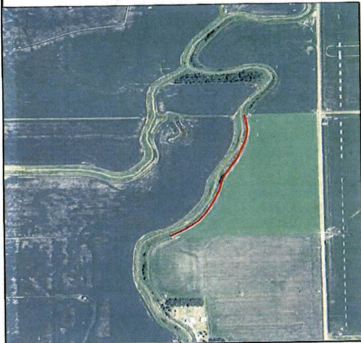
Condition of site at time of planting