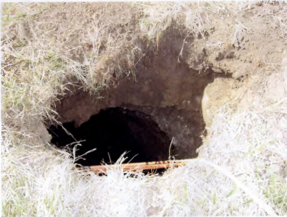
The diameter was 2' increasing to about 10' and 13' deep, extending toward the road.