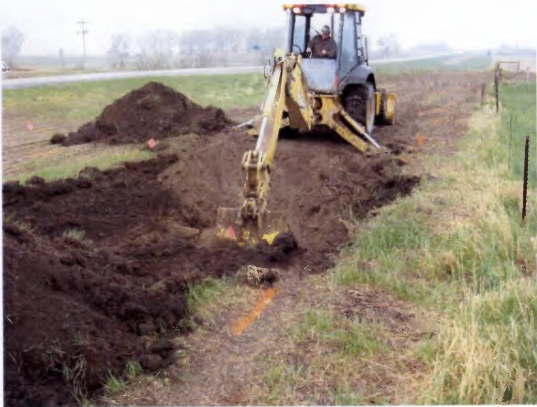
Excavated and filling of sinkhole with approximately 60 cubic yards of dirt.