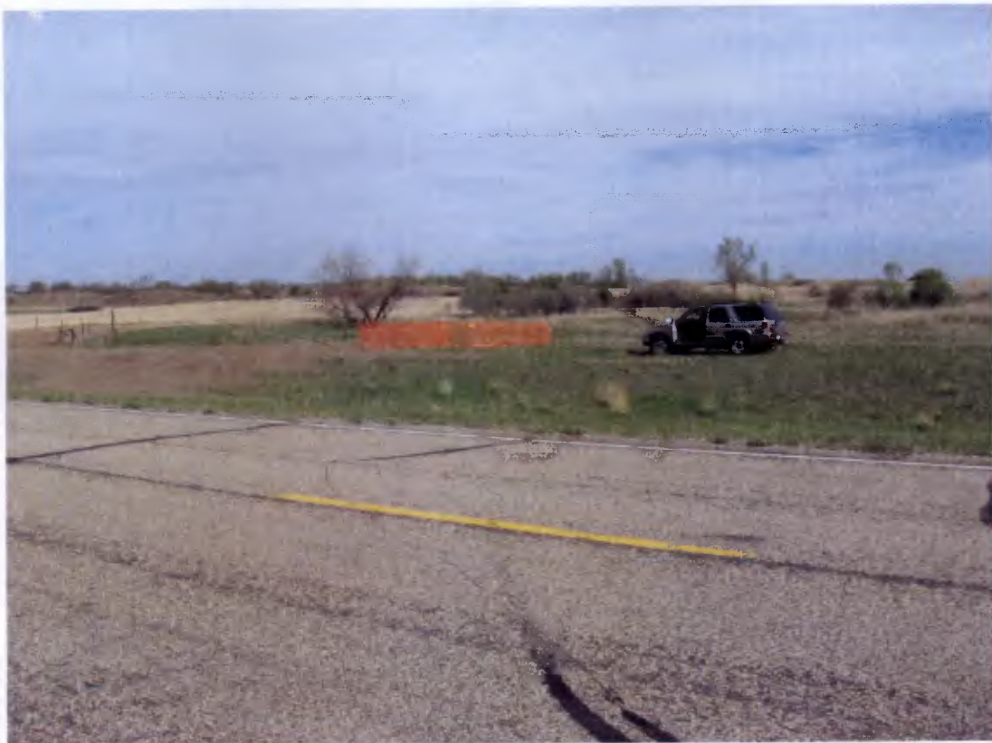
Temporary snow fence erected around the sinkhole to keep people out.