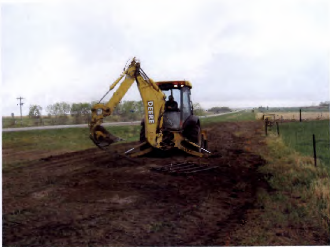
Topsoil was respread and then area was seeded and harrowed.