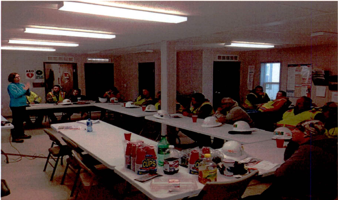
Border Winds - Employee Training