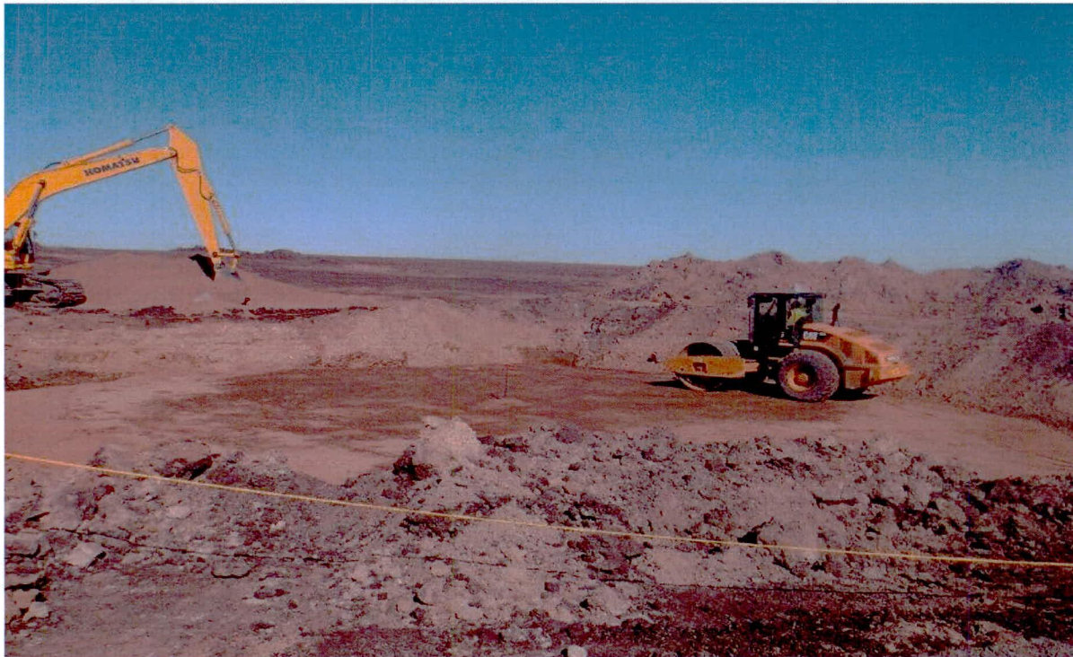
Border Winds; T19 Foundation subgrade compaction