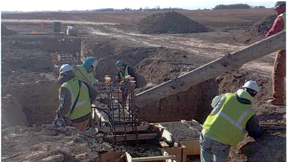
Border Winds - O&M Building Footing Pour