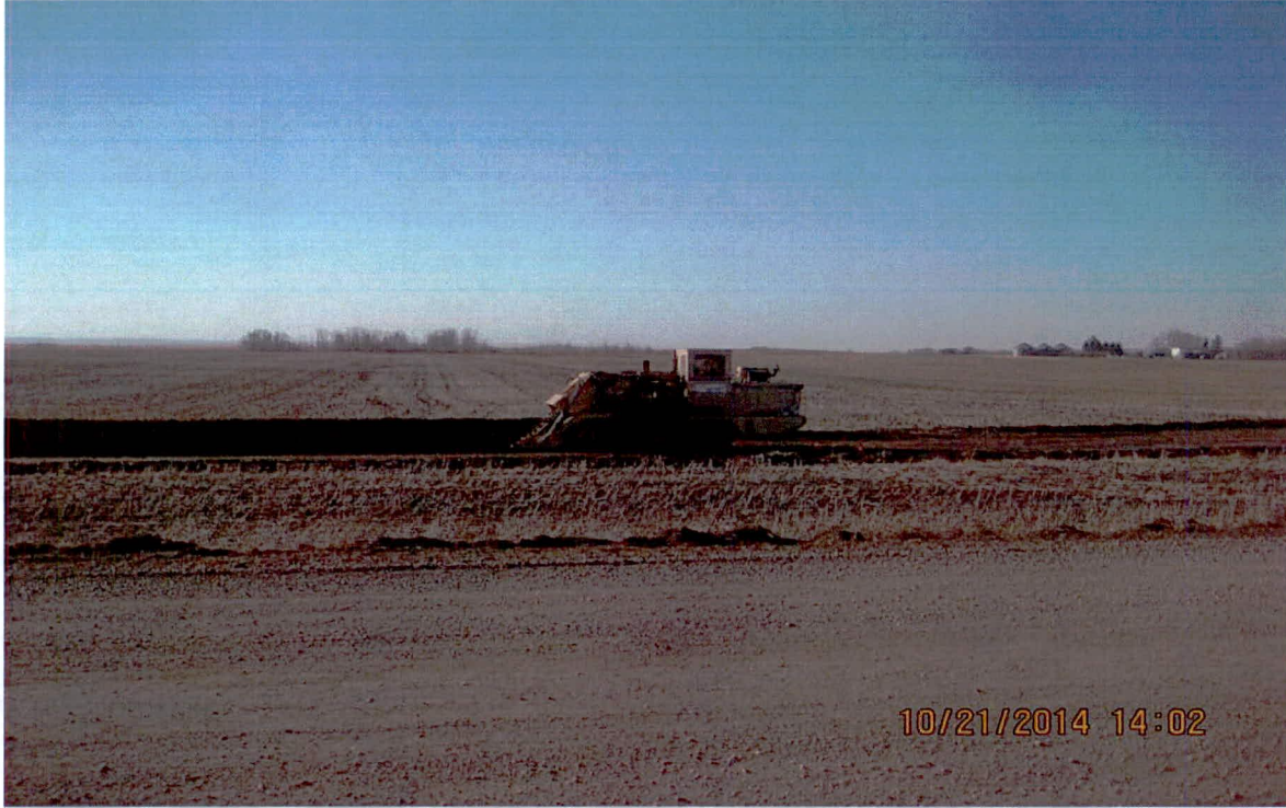
Border Winds - Trenching Operations