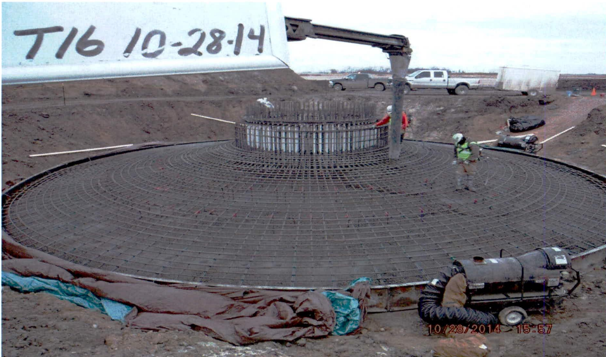
Border Winds - T16 Foundation Base Pour