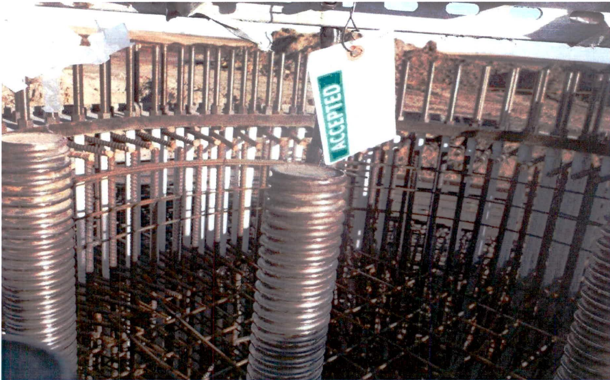
Border Winds; T21 Foundation rebar inspection approval tag