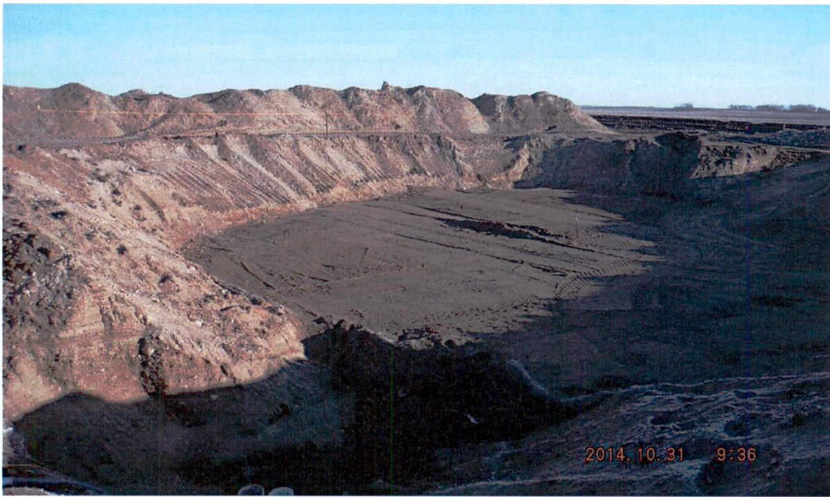
Border Winds – T4 Excavation With Sump