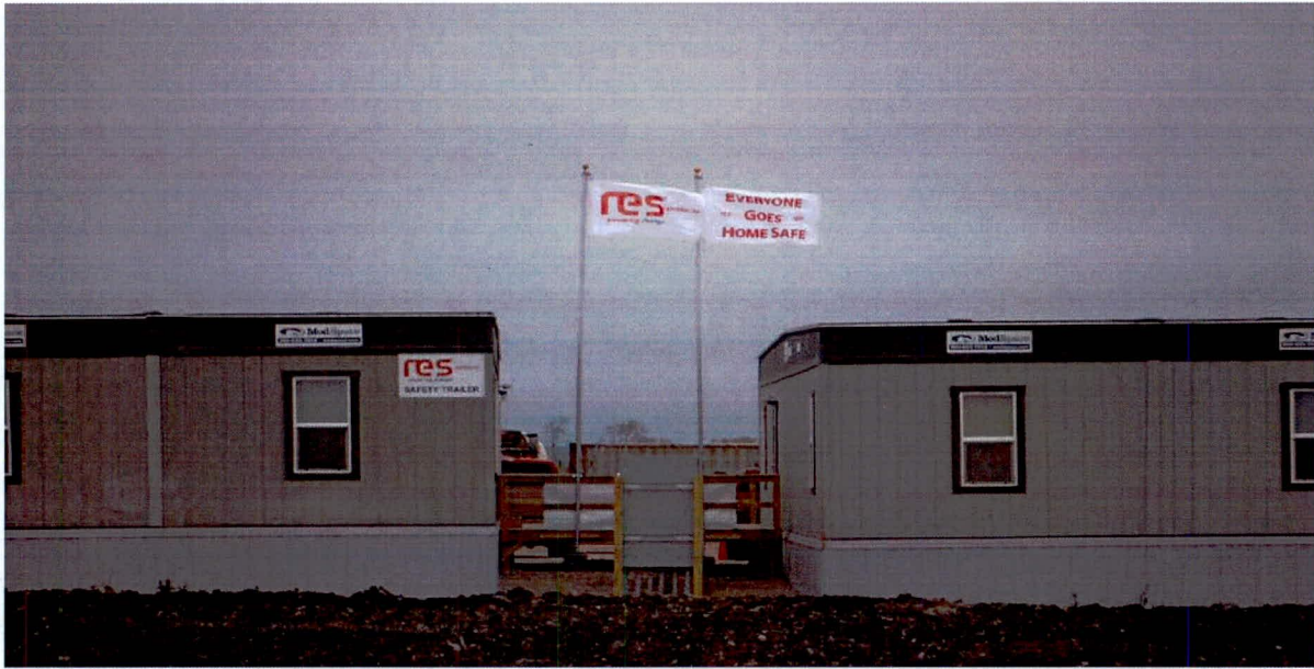
Border Winds; RES and safety flags