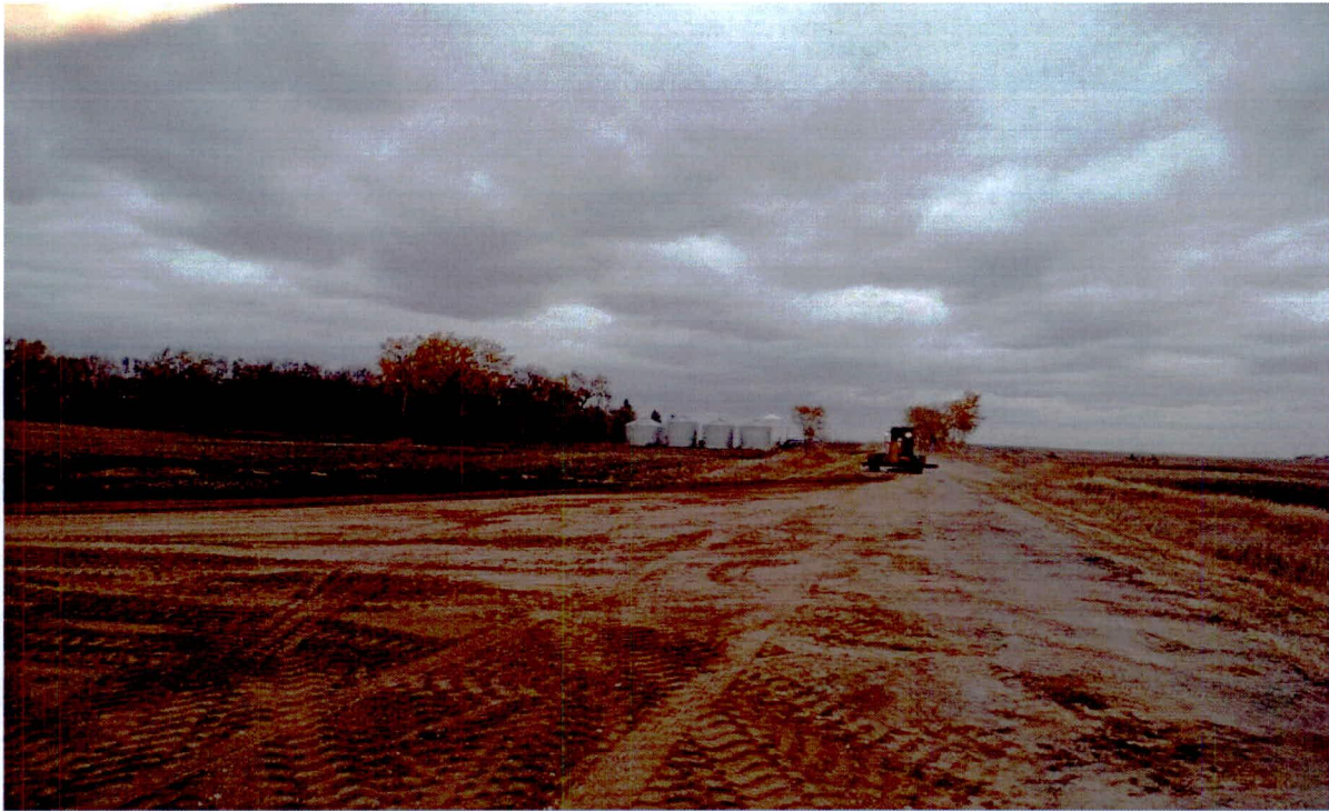
Border Winds; T18 Entrance