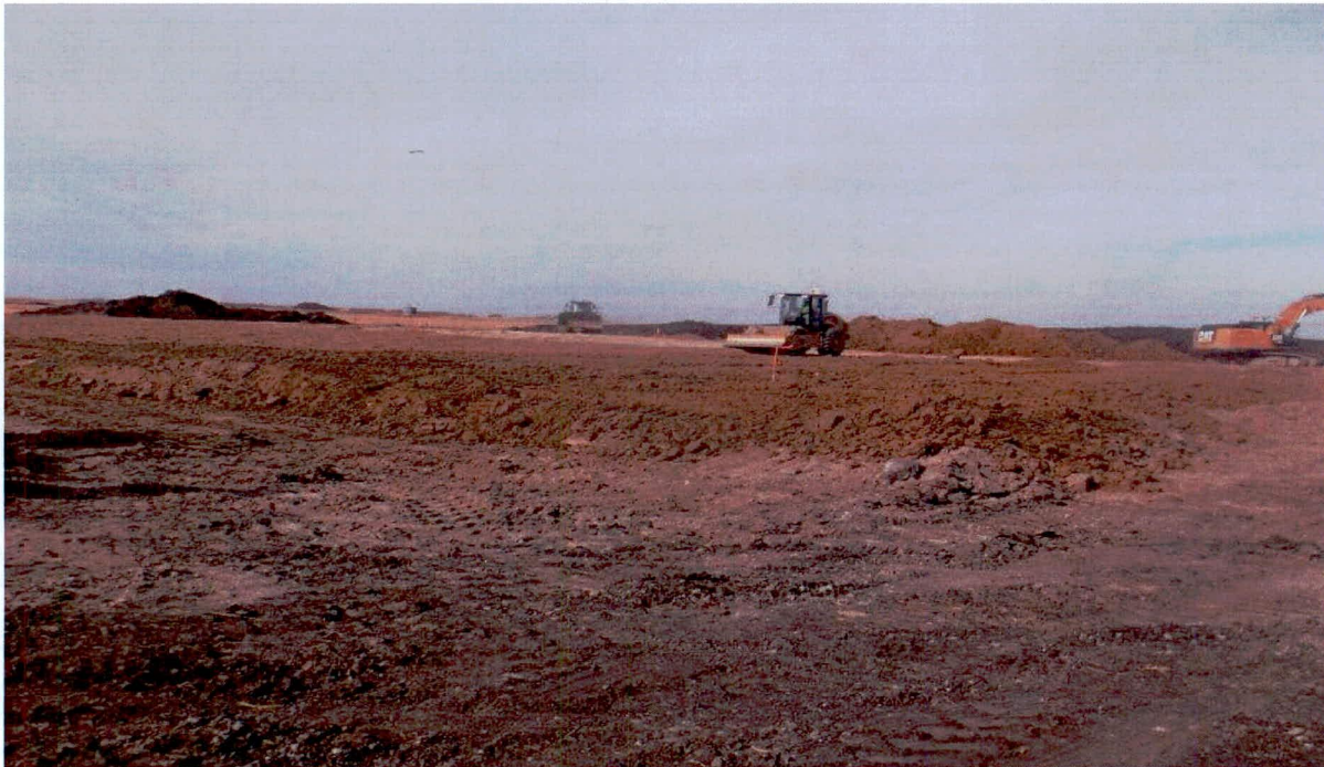
Border Winds; Substation site grading