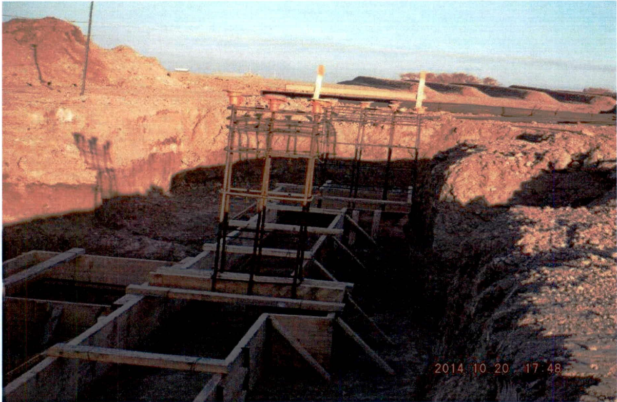
Border Winds - O&M Building Grade Beams and Piers