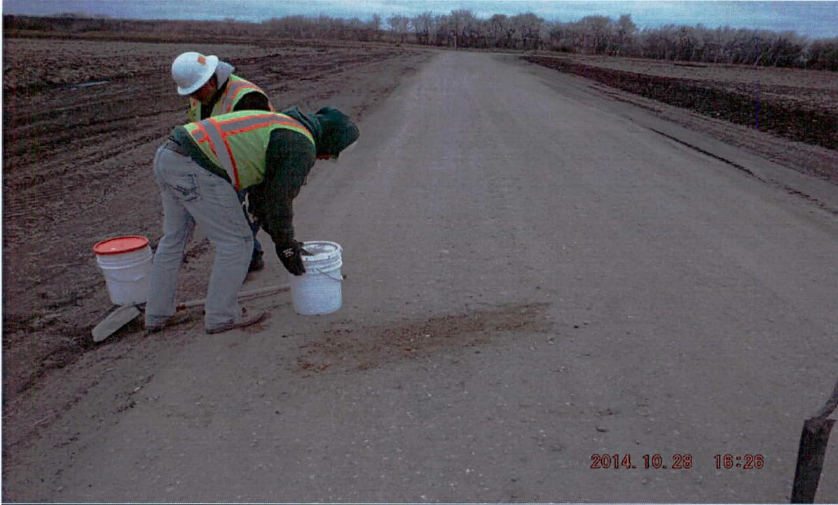
Border Winds – Clean up at T4 Access Road