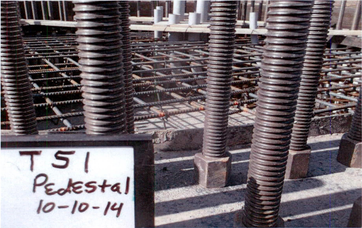
Border Winds; T51 Rebar and conduit