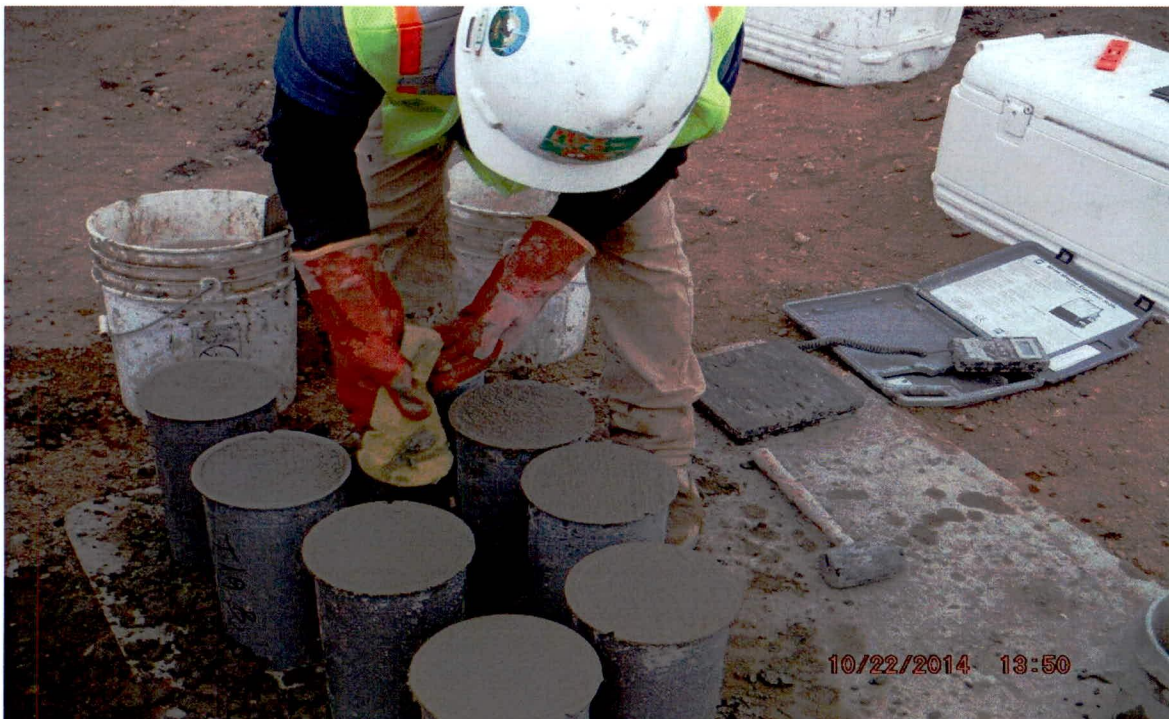
Border Winds - T19 Foundation Concrete Sampling