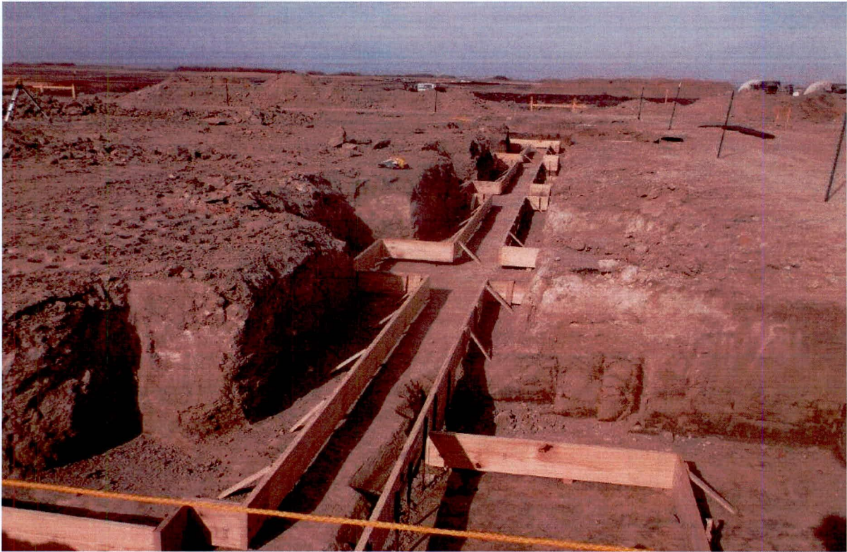
Border Winds; O&M Building footing form (west view)