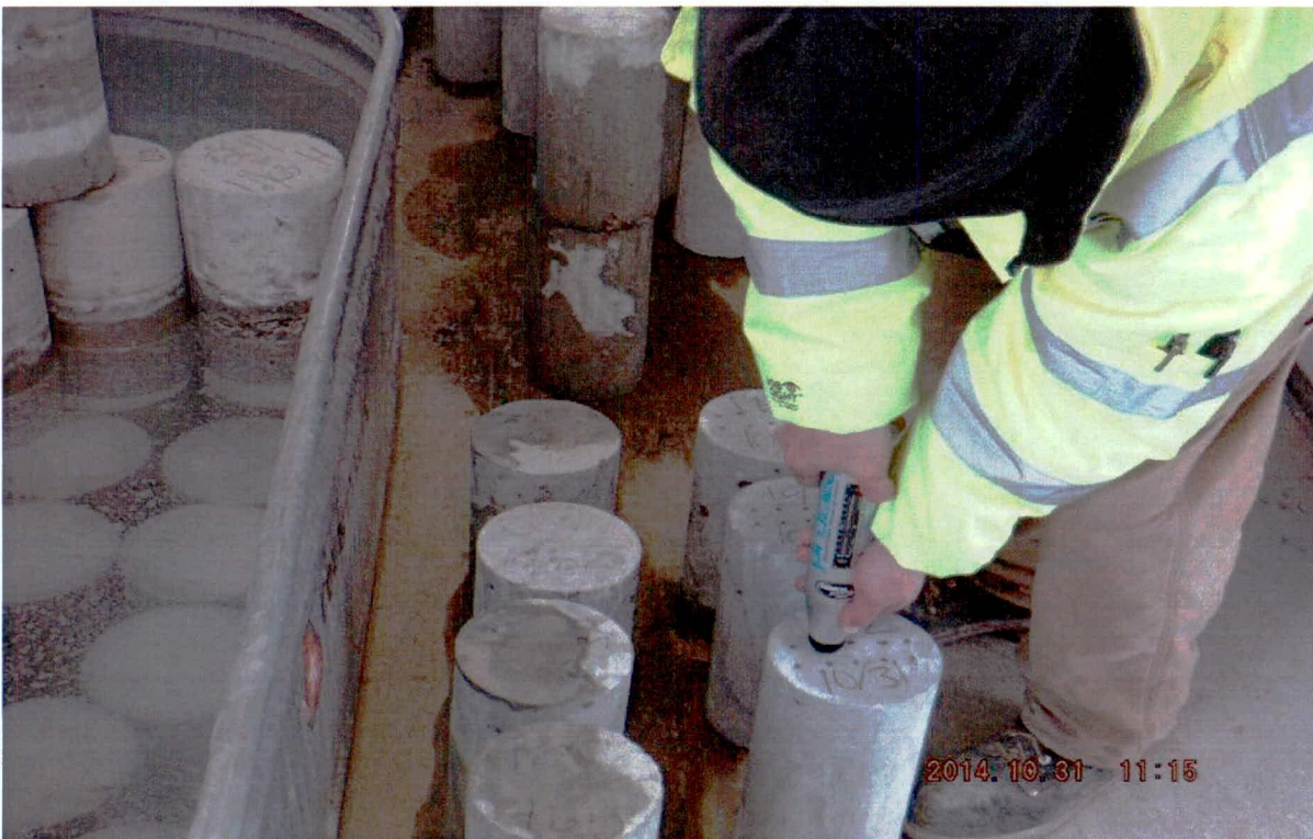
Border Winds – Schmidt Hammer Testing T49 Cylinders