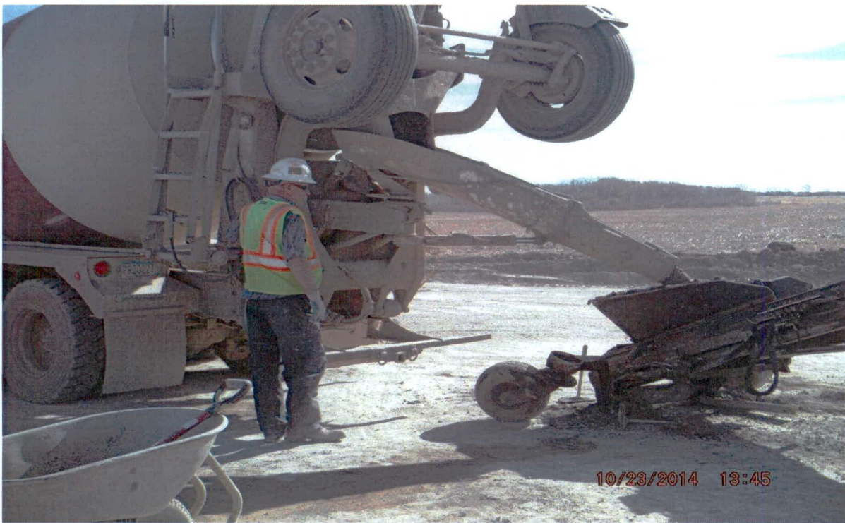
Border Winds - Foundation Base Pour