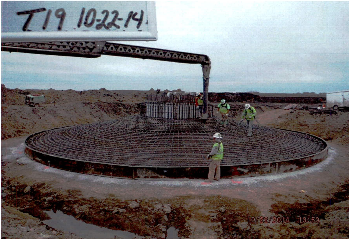
Border Winds - T19 Foundation Base Pour