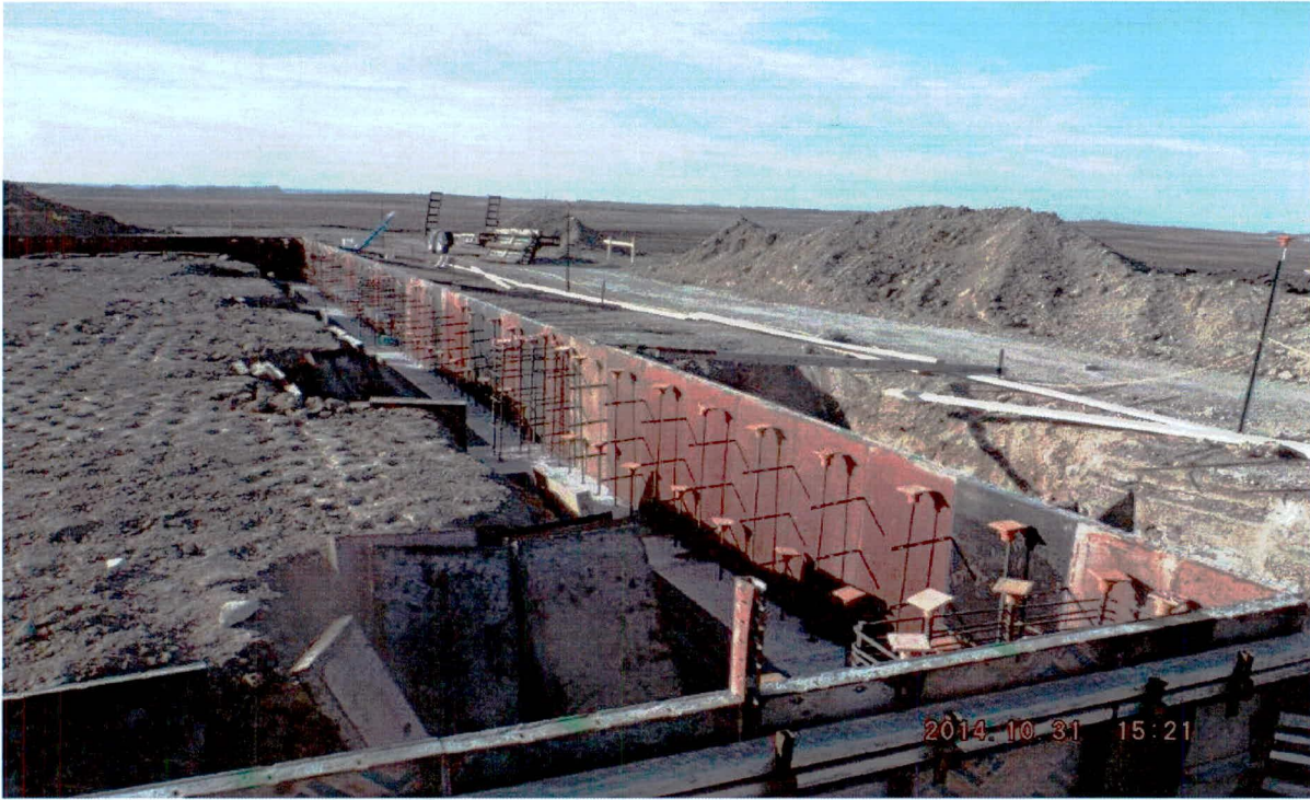
Border Winds – O&M Forming For Wall Pour