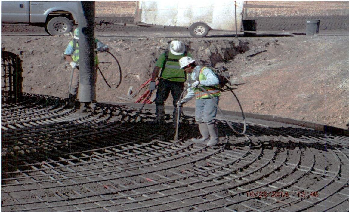
Border Winds - Foundation Base Pour