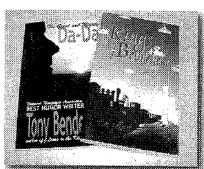
Printing & Publishing