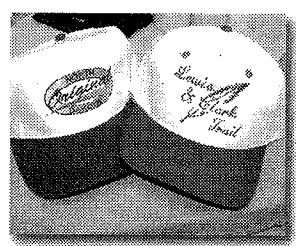
Caps & Sportswear