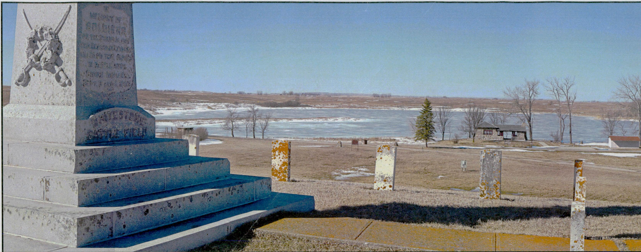
Existing Condition - View to the southwest from Whitestone Battlefield State Park.