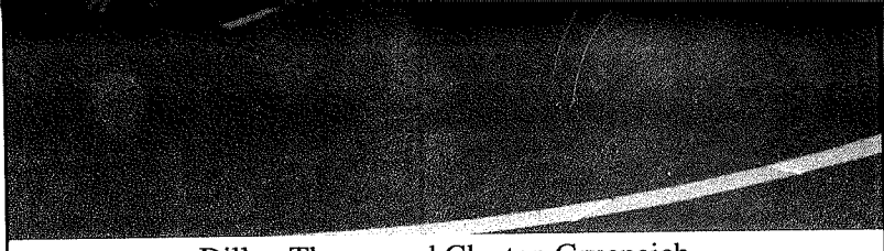
Dillon Thorpe and Clayton Grueneich