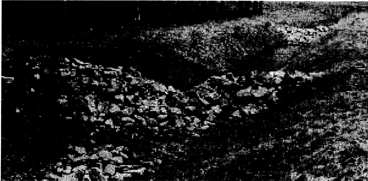
FIGURE 1 - Typical Rock Check Structures