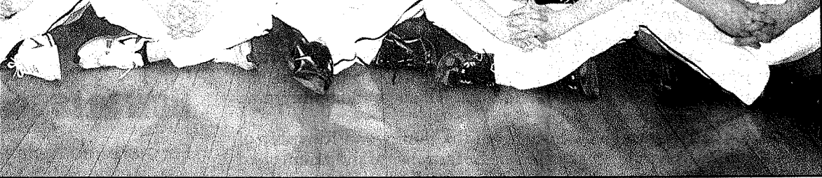
s baseball team.