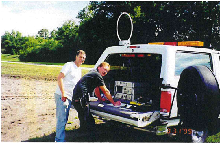
Exhibit 16- Photos of GPS Research Project