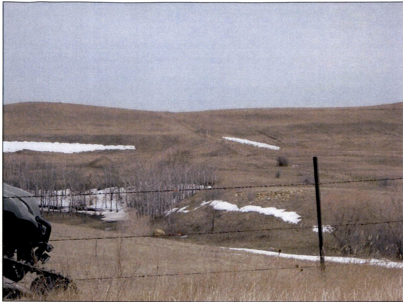
FROM P.I. LOOKING EAST