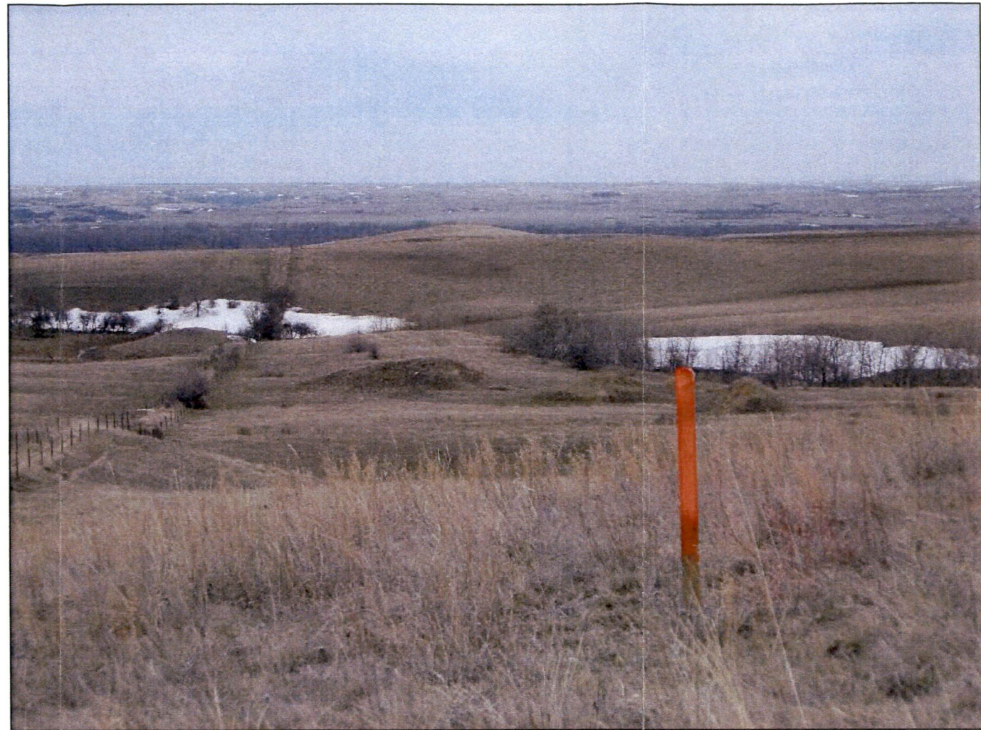
TOP OF HILL LOOKING WEST