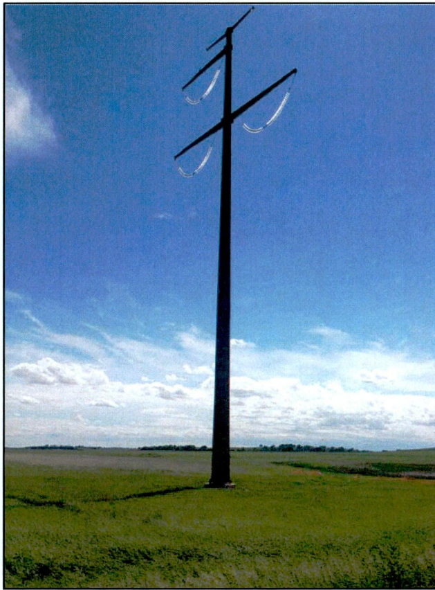
Photo 1: Example observed silt fencing around wetland resources (Pole 953)