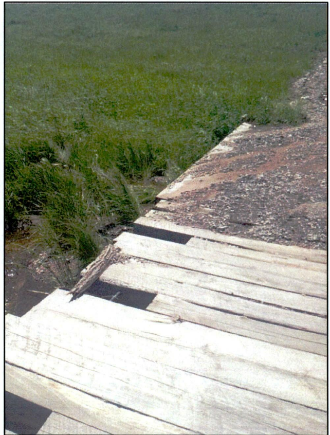
Photo 2: Erosion and sedimentation within intermittent stream (Pole 996)