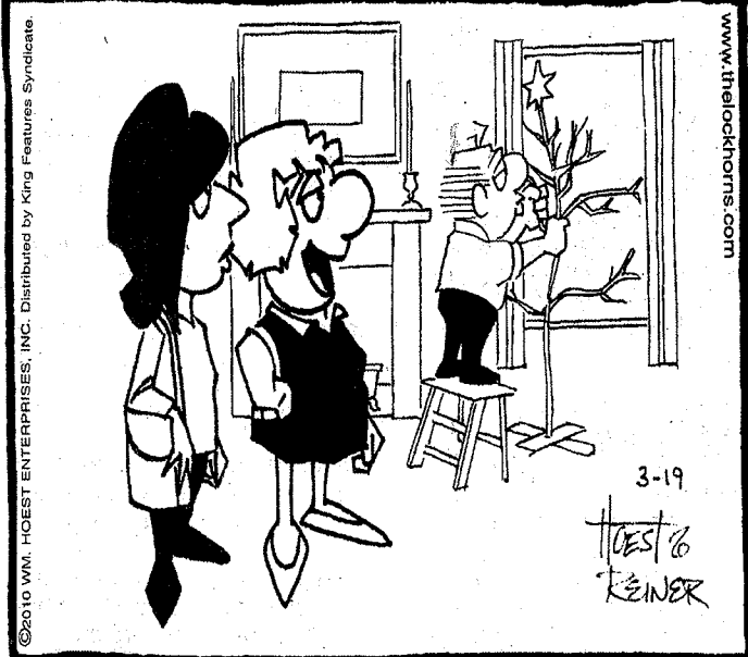
"AH, THE FIRST SIGN OF SPRING... LEROY'S TAKING DOWN THE CHRISTMAS TREE."