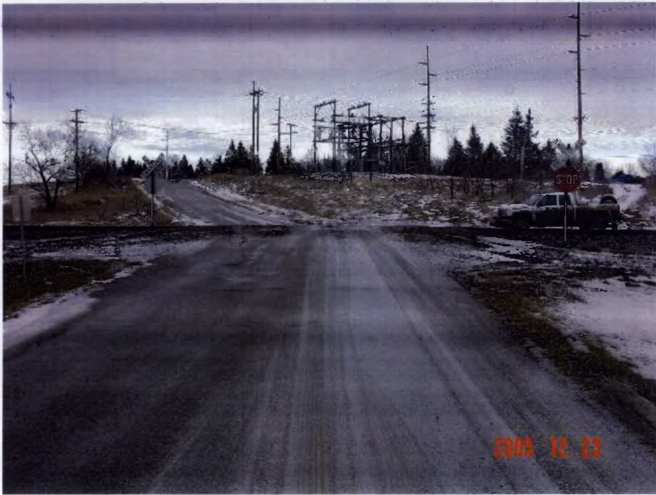
Photograph showing the gravel road leading to the power substation. The gravel road is in the foreground and the power substation is in the background. A car is parked on the right side of the road near a stop sign. The photograph was taken on 12/23/2005.