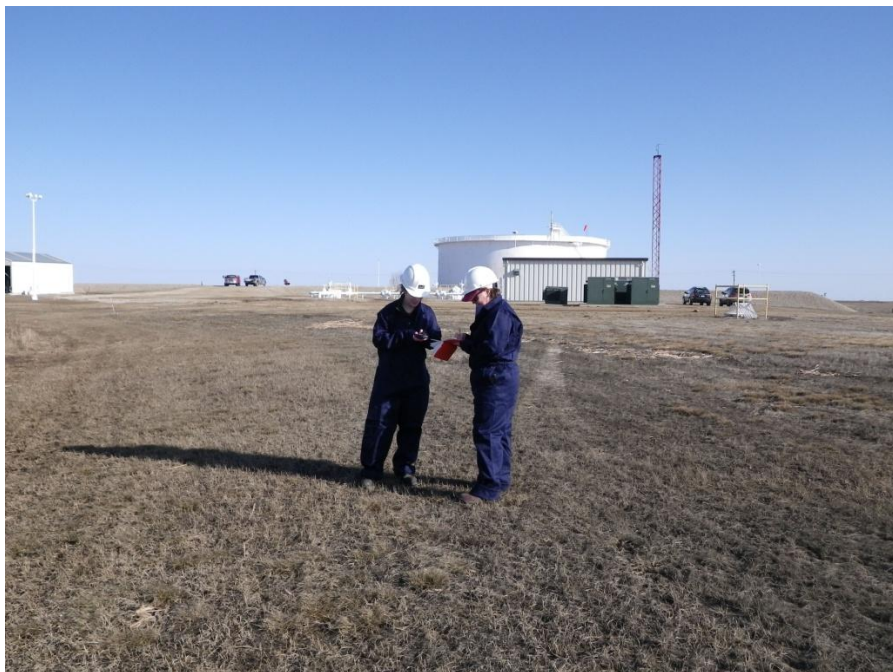
Figure 2: View north over central area in existing Berthold Station (Image #38).