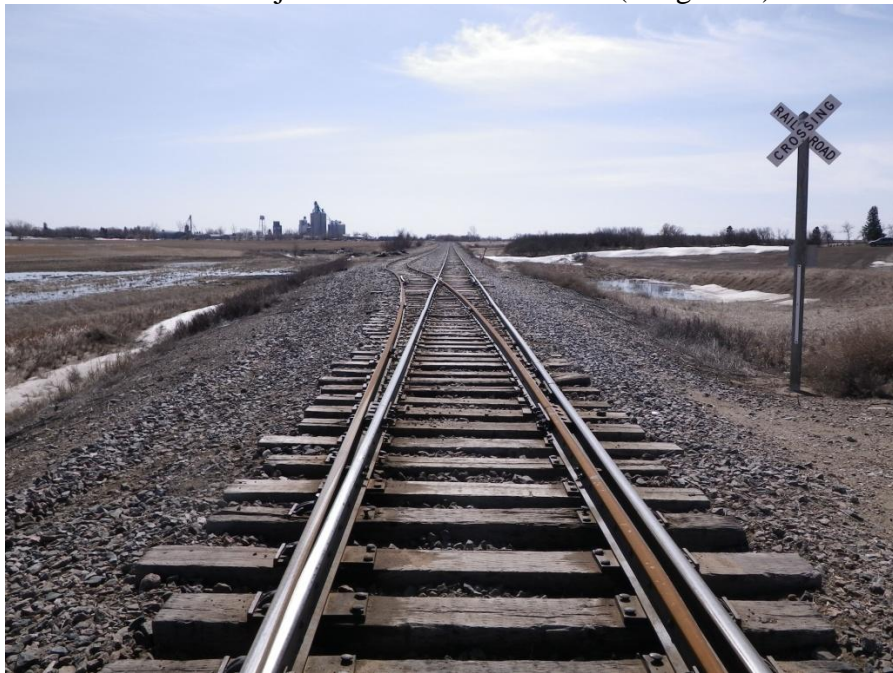
Figure 4: View southeast over railroad site 32WD1627 from western edge of the 80-acre block (Image #47).