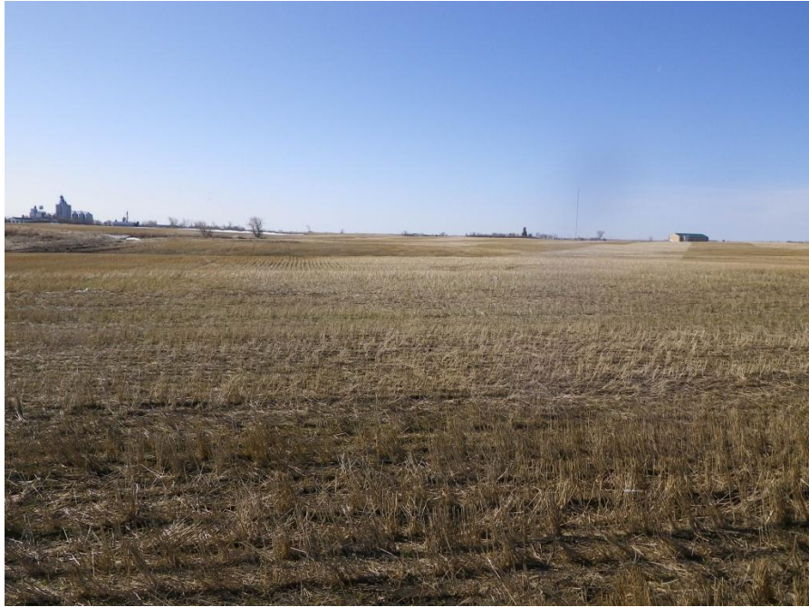
Figure 3: View southwest over 80-acre block. Note: Wildrose Cemetery lies within the trees on the horizon just left of the radio tower (Image #40).