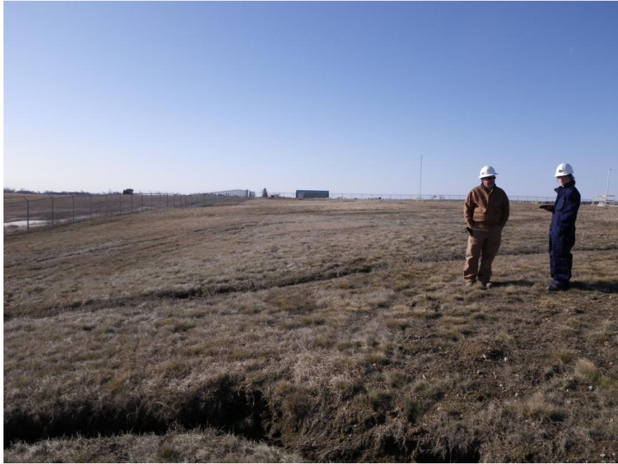
Figure 1: View south of eastern survey area within existing Berthold Station (Image #39).