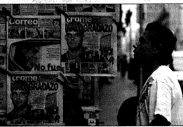
A man browses at a newspaper stand selling papers bearing the images of suspected murderer Joran van der Sloot in Lima, Peru, on Wednesday.

Bidders may obtain one complete set of Bidding Documents for a refundable deposit of $100.00 per set. In addition to deposit or purchase cost, there is a non-refundable shipping charge of $20.00 per set of documents. Submit separate checks for deposits and shipping charges to BVBR Architects, 380 St. Peter Street, Ste. 600, St. Paul, Minnesota 55102. Deposits will be forfeited if documents are not returned to Mathison's Express Press Graphics in usable condition within 45 days after Bids are opened. The successful Bidder shall furnish Performance Bond and Labor and Material Payment Bond in full amount of the Contract prior to execution of the Contract. The Owner may make investigations as deemed necessary to determine the qualifications and ability of the Bidders to perform the work. The Owner reserves the right to reject Bids in whole or in part, to waive bidding irregularities or irregularities, and to reject any and all bids and rebid the project until a satisfactory bid is received. A non-mandatory pre-bid meeting will be held at the Plant Service Director's office in the Penitentiary Central Plant building at 1 p.m., 15 June 2010. Other arrangements may be made through the Architect, subject to the Plant Service Director's approval. 6/3, 10 & 17 - 605502