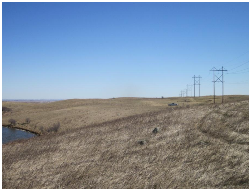
Photo 22. Direction: East. Note the distance of the transmission line from the largest wetland in the LSB WPA in the far left of the photo.