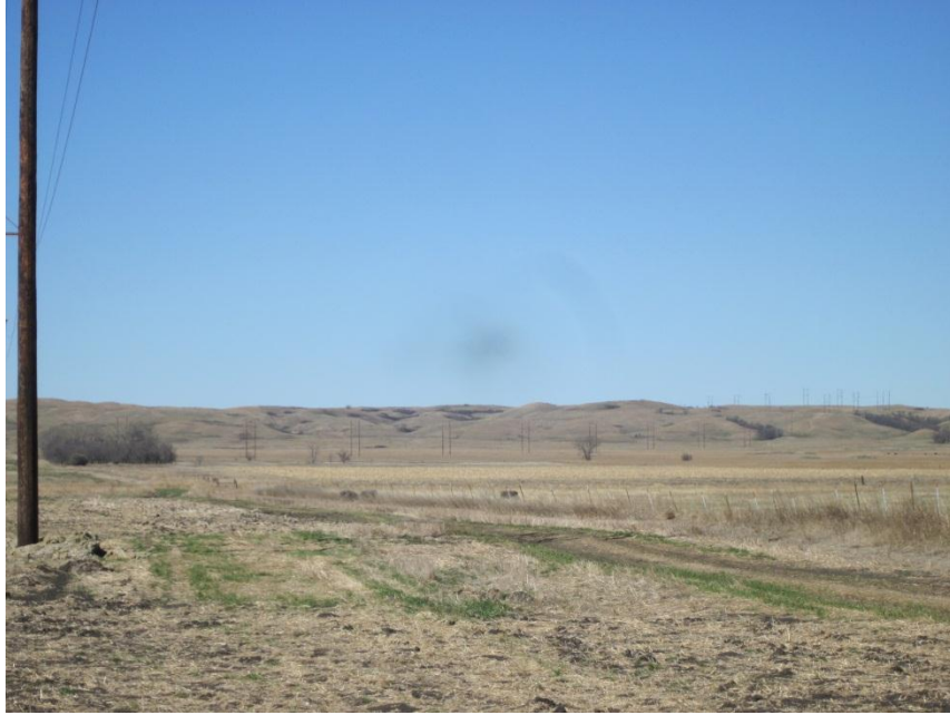
Photo 19. Direction: Northwest. Transmission line running northwest along ridge about 13 miles west of Ellendale substation.