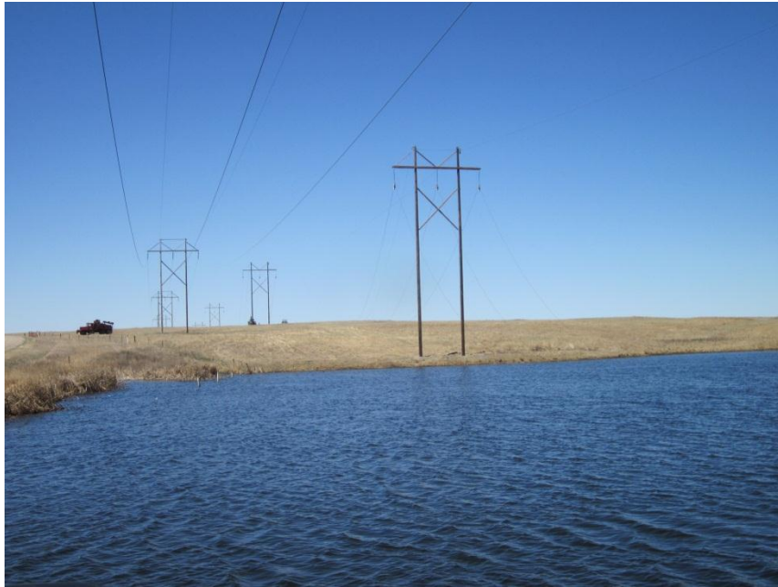
Photo 29. Direction: South. On the far side of wetland crossing from Photo 30. Note lines have not yet been connected to structures from here to the Merricourt substation.