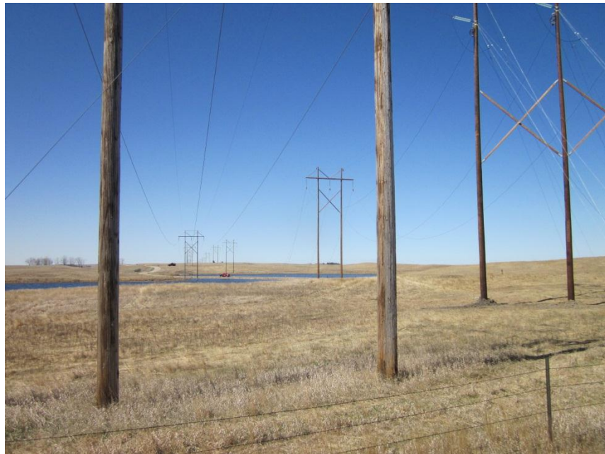
Photo 28. Direction: West. Same location as Photo 29. Existing transmission line in photo, new line to the right. Transmission line spans wetlands with no poles in water and no erosion to water body evident.