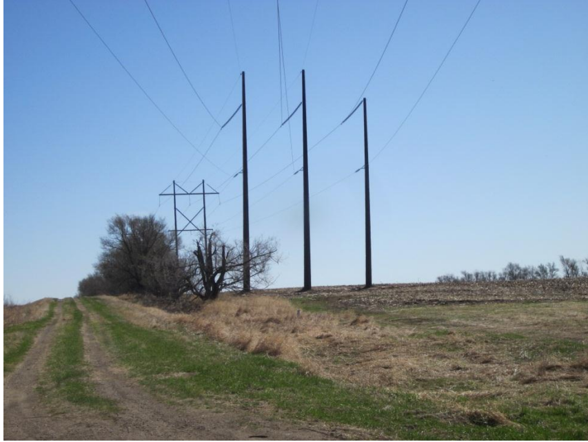
Photo 11. Direction: East. At Pheasant Lake crossing, looking back east toward the Ellendale substation.