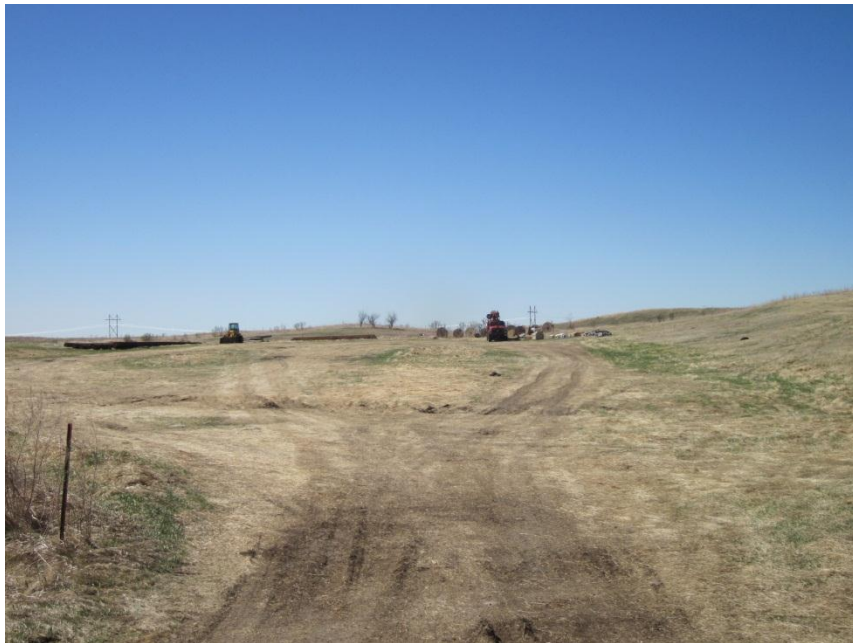
Photo 26. Direction: West. Laydown area leased from landowner Greg Brokaw located in the NE ¼ of the NE ¼ of Section 16, Township 130N, Range 166 W, Dickey county. Laydown area will be used through October 2012 for other line maintenance work nearby. Area seemed in good order without excessive disturbance or erosion present.