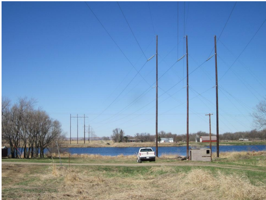
Photo 10. Direction: West. Pheasant Lake crossing. Line jogs slightly to north, avoiding property to the south.