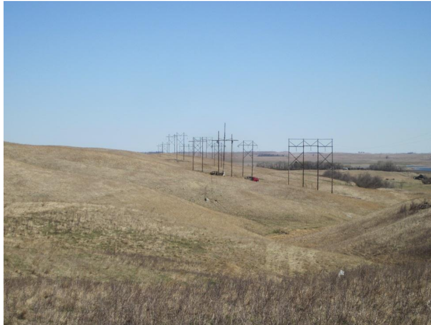
Photo 31. Direction: East. Final few structures being erected within sight of Merricourt substation. Photo was taken at southeast corner of Merricourt substation.