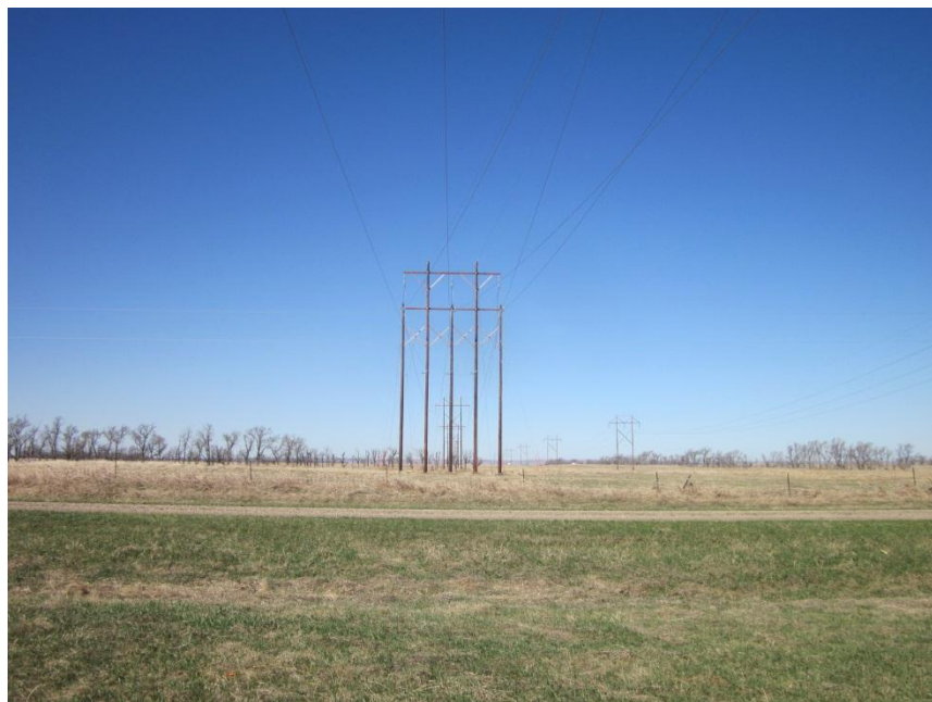
Photo 6. Direction: West. Double circuit transmission line leaving substation traveling west.