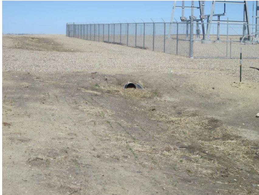
Photo 33. Direction: North. Example of storm water and erosion control measures with culvert underneath access road to substation.