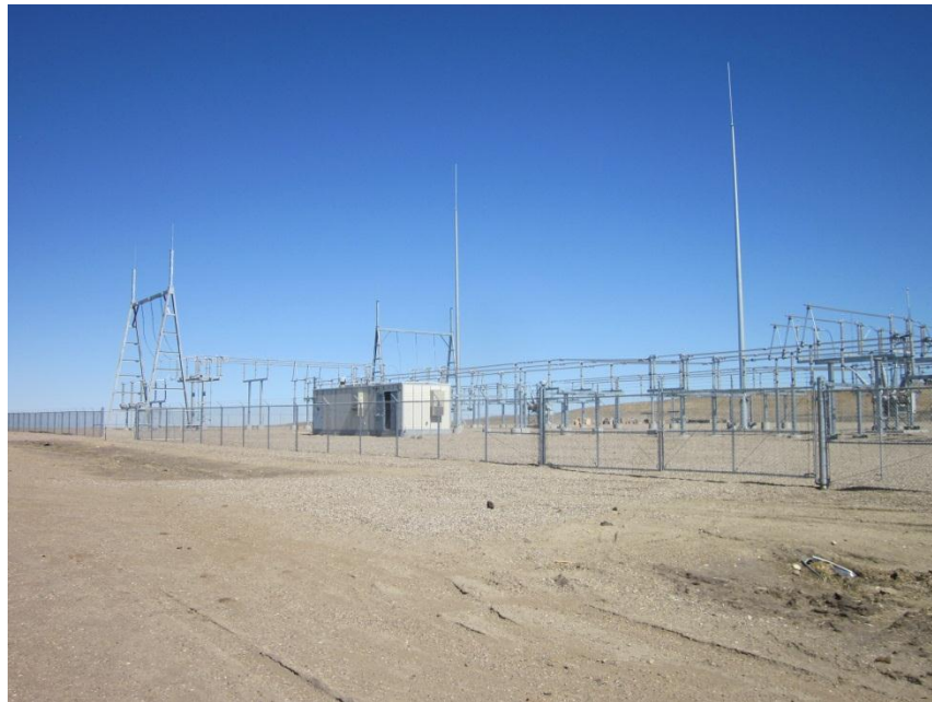
Photo 34. Direction: Northeast. Merricourt substation showing storm water control culverts and approaches. Substation appeared to be in good order with no erosion or other impacts noted.