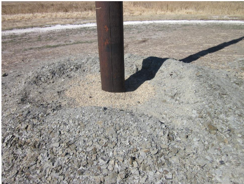
Photo 14. Example post hole filled with aggregate. Shale surrounding the hole was debris from underlying material as a result of post hole drilling. Upon final restoration, material will be cleaned, spread, or hauled away.