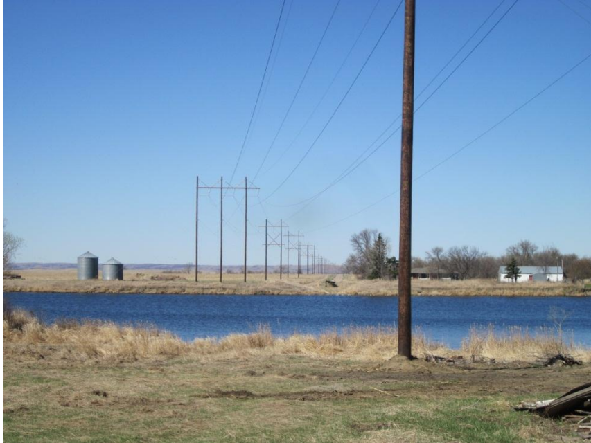
Photo 9. Direction: West. Transmission line crossing Pheasant Lake 5 miles west of Ellendale substation. Poles were about 20-30 ft. from water, with no visible disturbances to the shoreline.