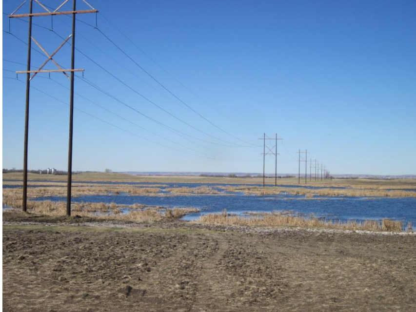
Photo 7. Direction: Southwest. Transmission line crossing wetland about 3 miles west of the Ellendale substation. Notice poles are not located in water but on small island. Disturbance to wetlands was minimal, but still needed final restoration.