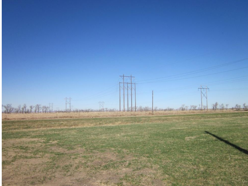
Photo 5. Direction: Northwest. New line leaving the Ellendale substation, which is located just behind where this photo was taken. Notice new line (larger structure on the left) parallels an existing line out of the substation.