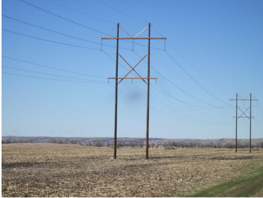
Photo 15. Direction: Southwest. Example H-Frame structure showing double circuit line. This structure is just north of where ND Highway 11 turns north.