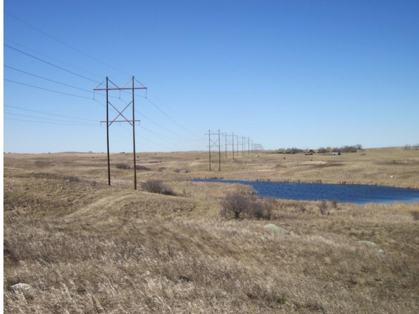
Photo 21. Direction: West. Crossing of wetland within the LSB WPA located in Section 6 of Township 129N Range 65W, Dickey County. Pole locations were outside of wetland areas and no disturbance to wetlands was noted.