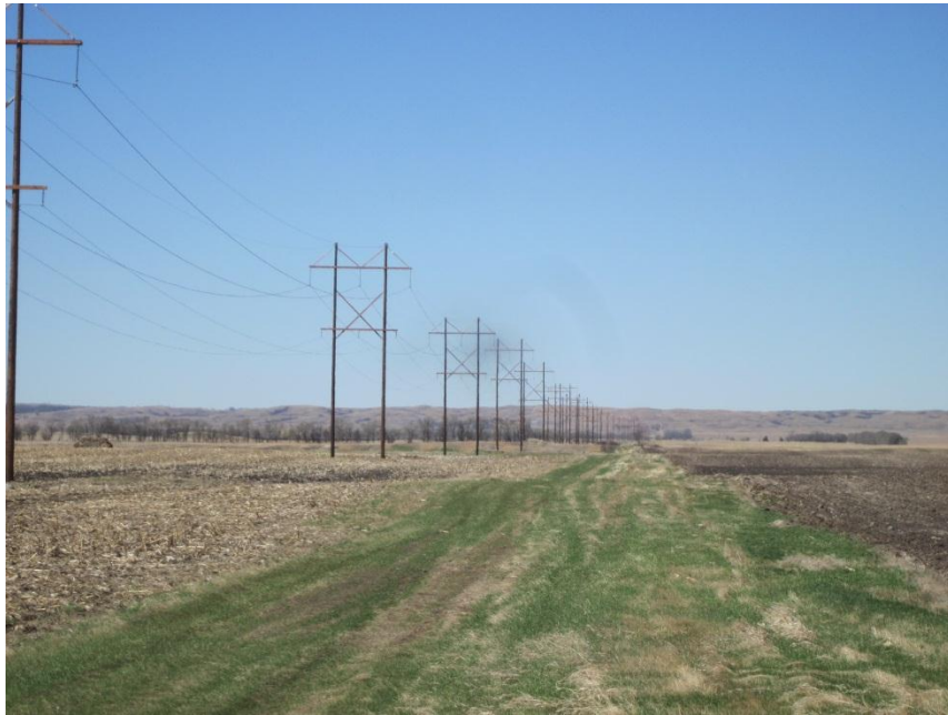
Photo 16. Direction: West. Ridge in the distance is where transmission line turns to the northwest.