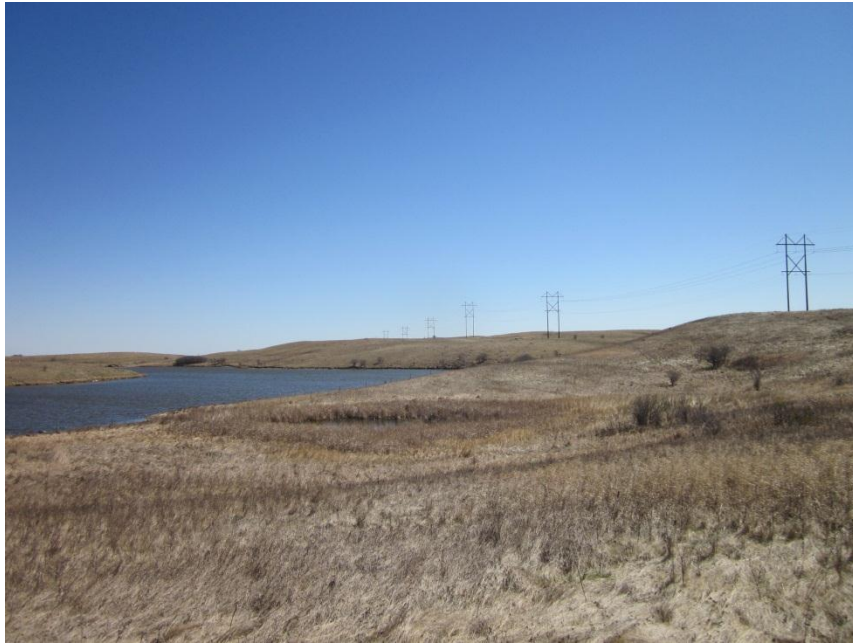
Photo 23. Direction: Southwest. Another photo showing distance of transmission line from largest wetland in LSB WPA.