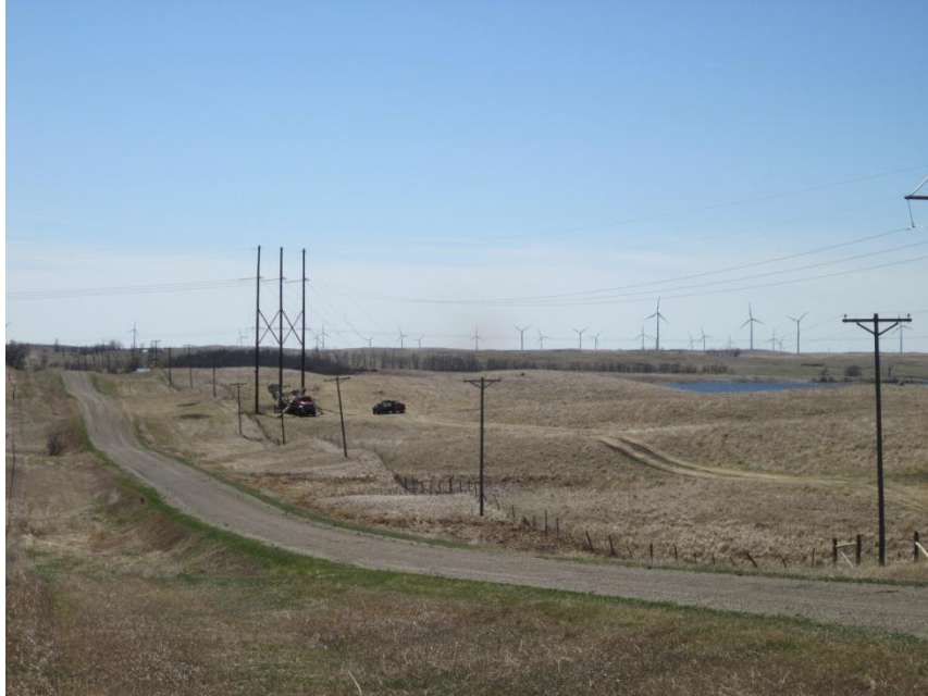
Photo 25. Direction: Linemen working on line approximately 17.2 miles from Ellendale substation. After this point, line is single circuit until it terminates at the Merricourt substation.