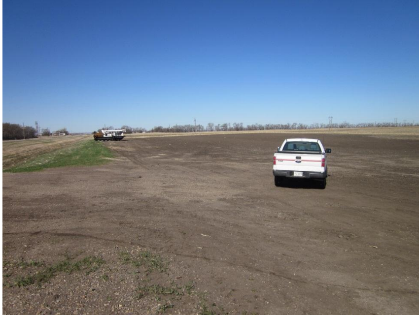
Photo 1. Direction: North. Webster’s laydown site (About 1.75 miles west of Ellendale) that was not used due to wet soil conditions early in the season. In good condition with no erosion or other impacts noted. Tracked vehicle in left background will be removed on completion.