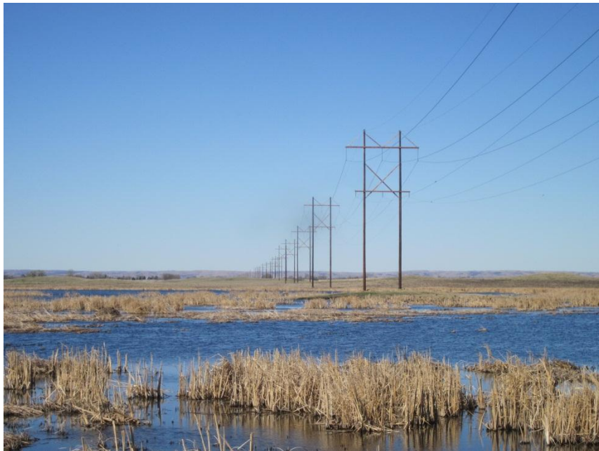
Photo 8. Direction: West. This is a closer picture of the wetland crossing shown in Photo 8. Note structure is not located in wetland, but on small island.