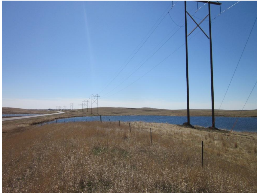
Photo 27. Direction: South. Transmission line crossing a water body about 1 mile north of Brokaw laydown area. Note distance of structures from water. No erosion into water body was noted.