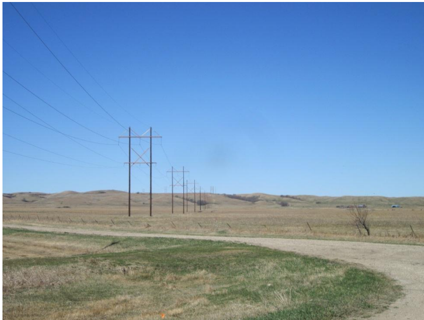
Photo 20. Direction: Northwest. Line running northwest over ridge in the distance.