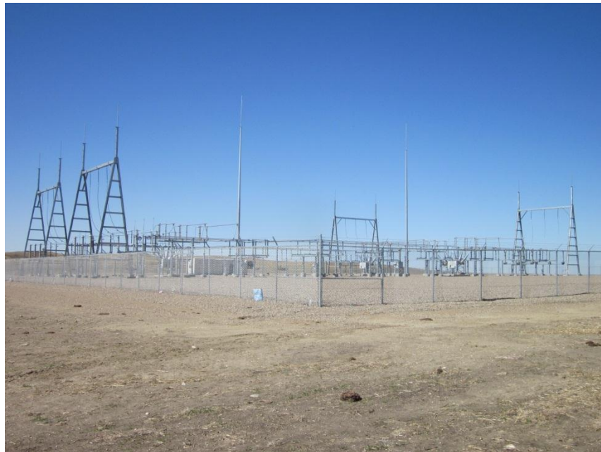
Photo 32. Direction: Northwest. The new Merricourt substation where the transmission line will terminate in Section 34, Township 131N, Range 67W, McIntosh county. No erosion or other issues were evident. During the inspection, final construction activities were ongoing at the substation.