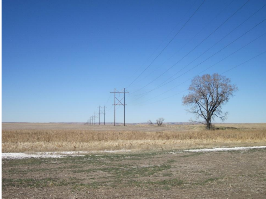
Photo 13. Direction: West. Transmission line spanning a cattail slough approximately 8 miles west of the Ellendale substation.