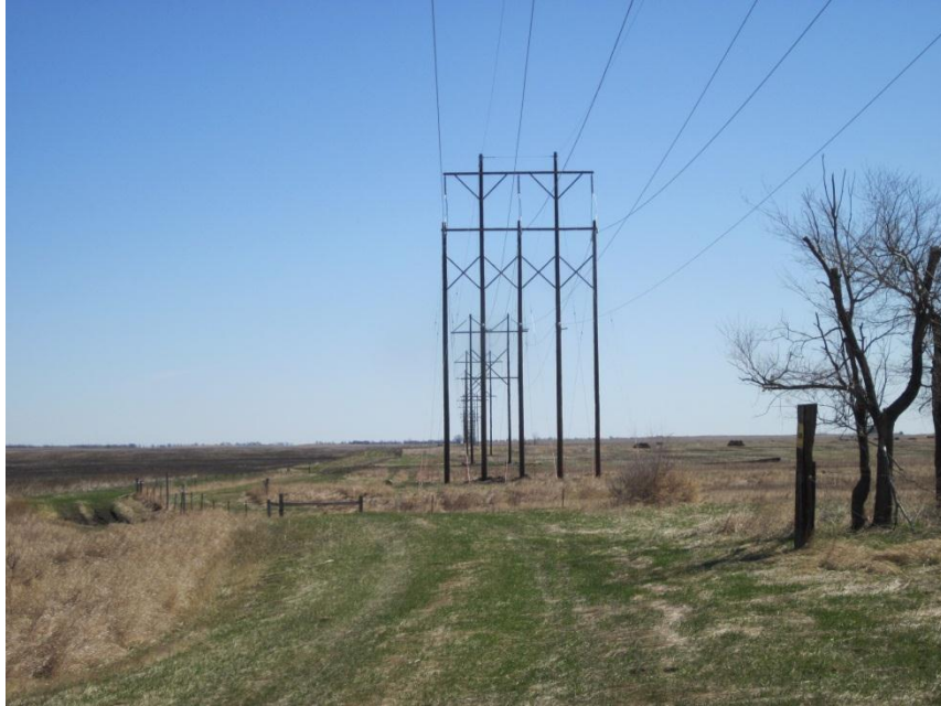
Photo 17. Direction: East. Example storm structure nearby a low wet area that was spanned by the line.