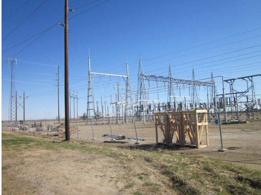
Photo 3. Direction: Northeast. Ellendale substation showing upgraded North bay at the east end of the transmission line. Substation was west of Ellendale in the NW \frac{1}{4} of NW \frac{1}{4} of Section 10, Township 129N, Range 63W, Dickey County. No erosion problems evident and station looked to be in order.