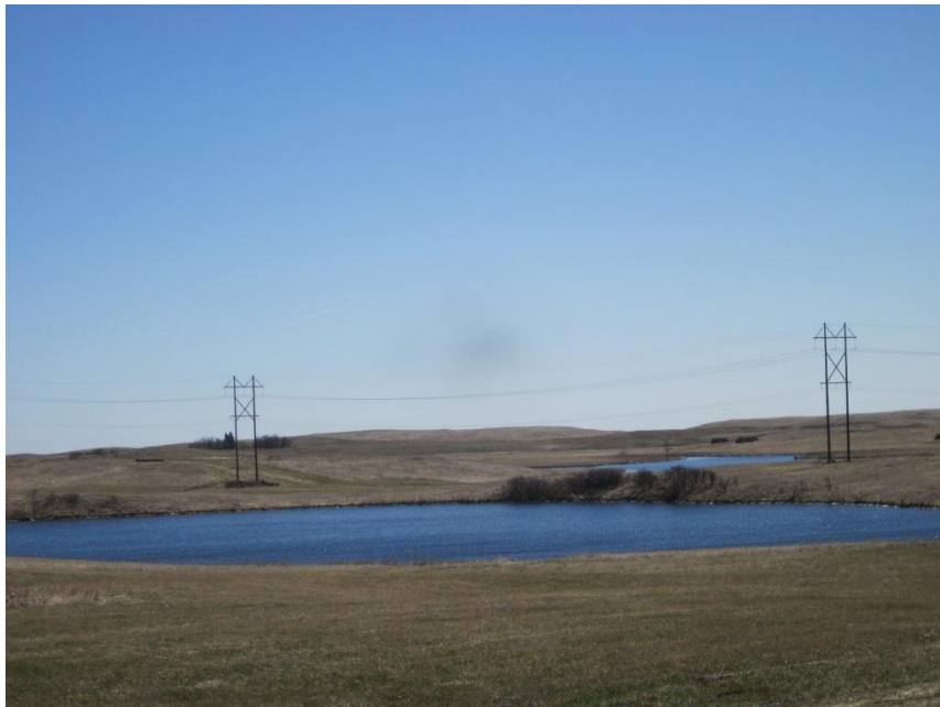
Photo 24. Direction: Southwest. One mile west of the LSB WPA at another wetland crossing. Note distance of transmission line poles from the water.