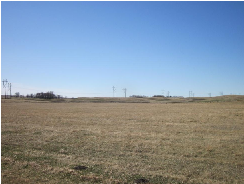
Photo 30. Direction: Southeast. Example span of line within 5 miles of Merricourt substation.