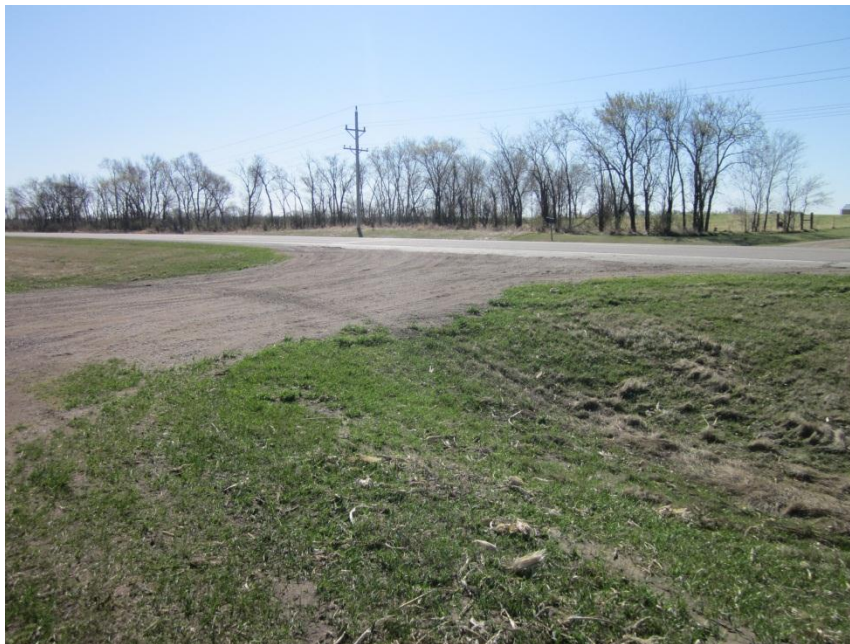
Photo 2. Direction: Southeast. Approach to Webster’s laydown area.