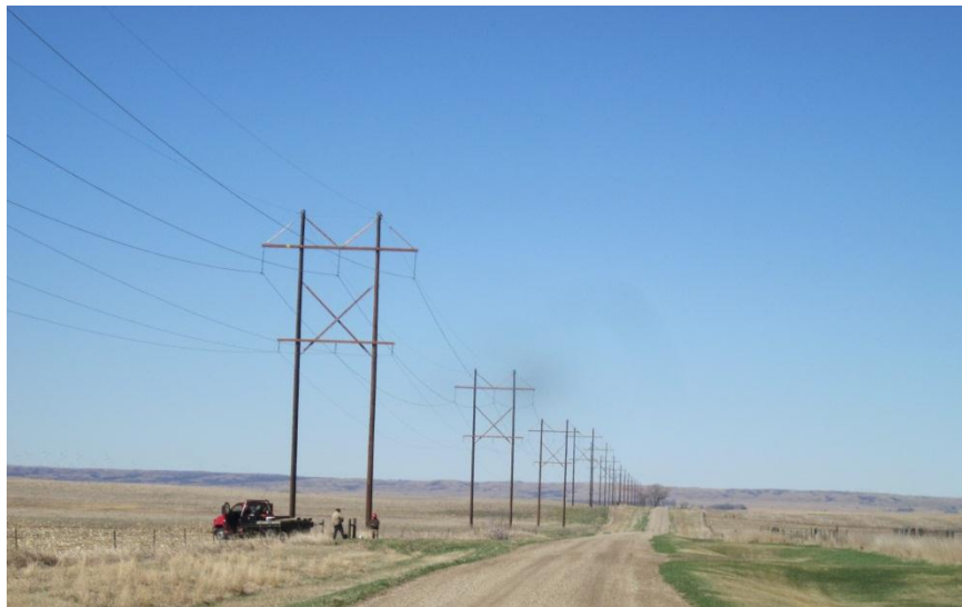
Photo 12. Direction: West. Linemen repairing fences used for access during structure construction.