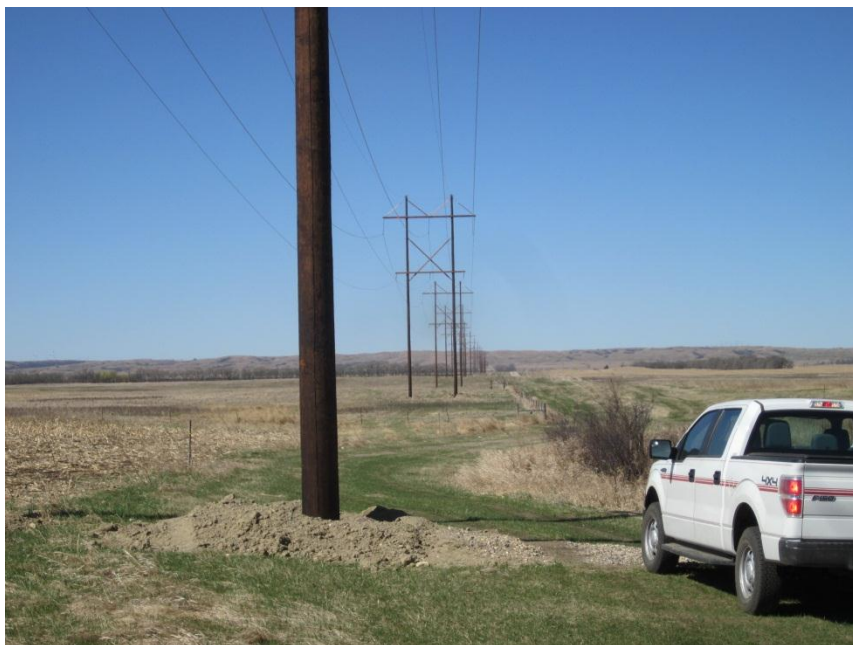
Photo 18. Direction: West. Example of post hole debris that still needs final restoration.