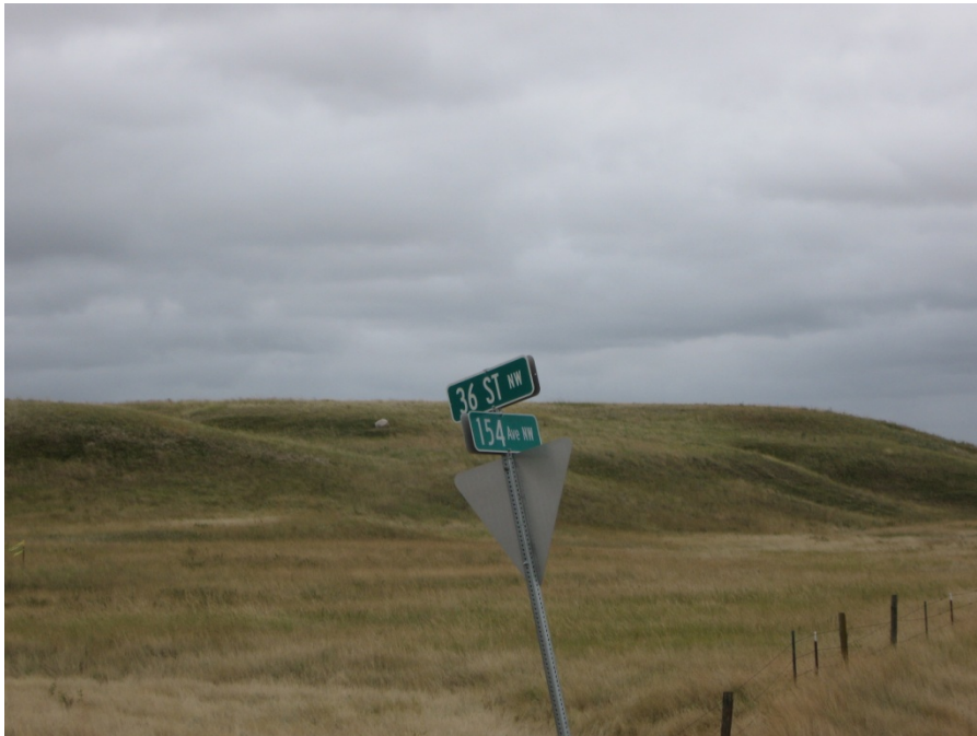
Figure 2: Overview of the APE. View to the West.