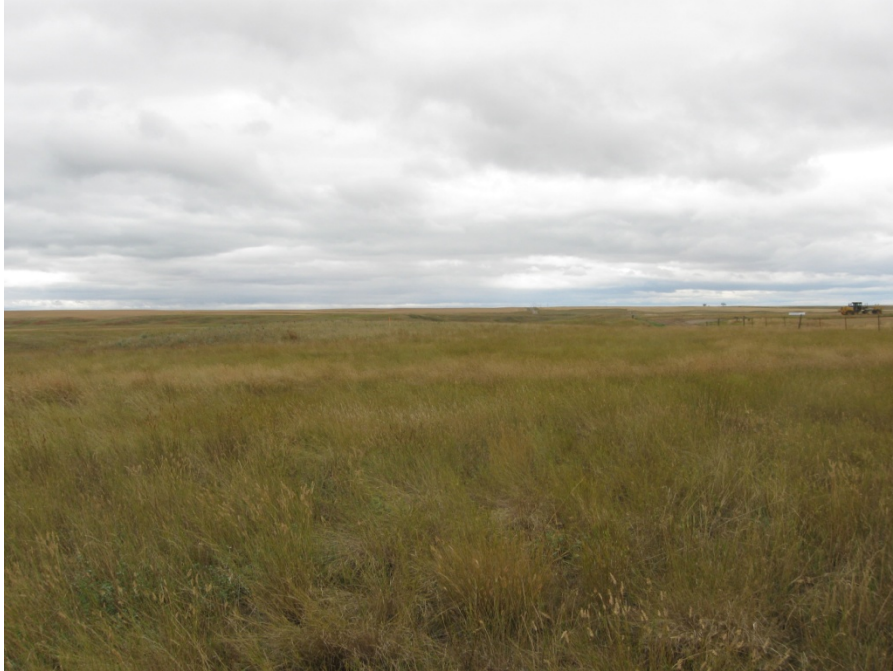
Figure 1: Overview of the APE. View to the East.