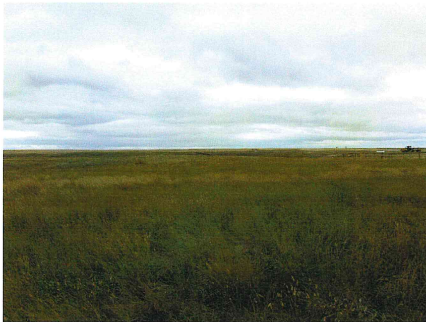
Figure 1: Overview of the APE. View to the East.