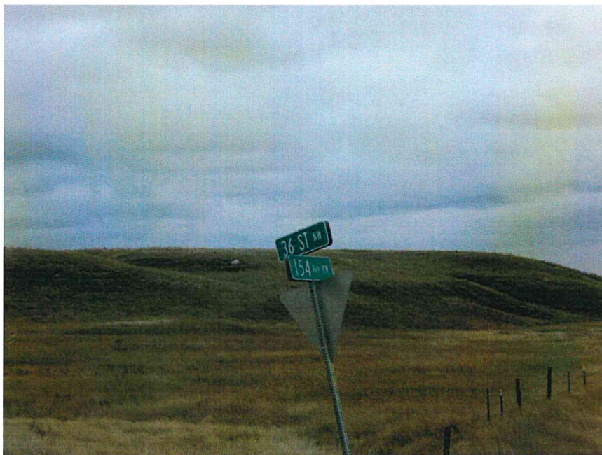
Figure 2: Overview of the APE. View to the West.