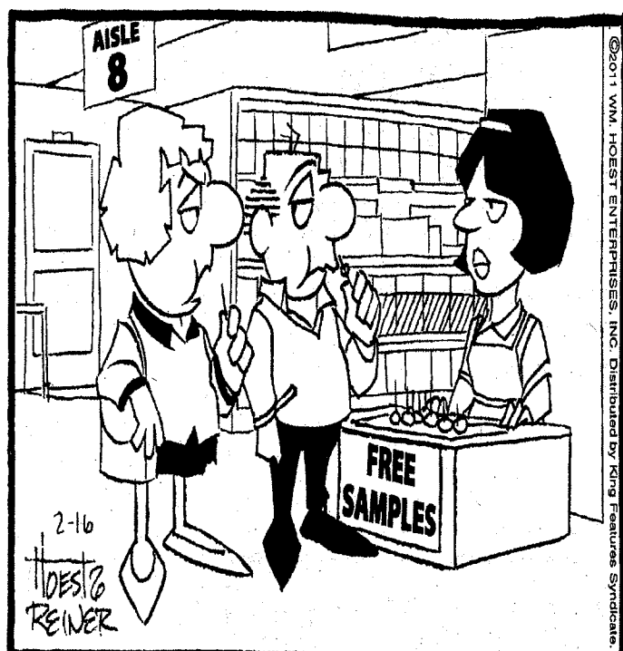
"NO, THIS DOESN'T COUNT AS TAKING ME OUT TO EAT."

BURNER FUEL DELIVERY DRIVER • Must Have Class A CDL with clean abstract • Must have Tanker endorsement • Hazmat is not required • Responsible for delivering burner fuel to heater trucks at oilfield locations Please Fax resume to 701-572-0759 Or call 701-572-0843