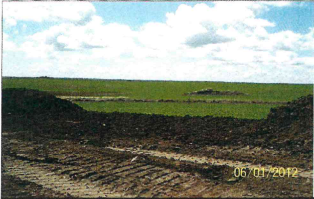
Opening for land owner to get through