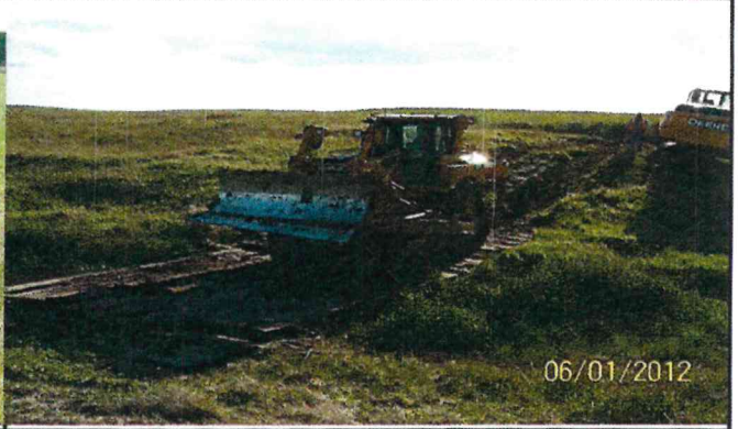
Crossing wet land