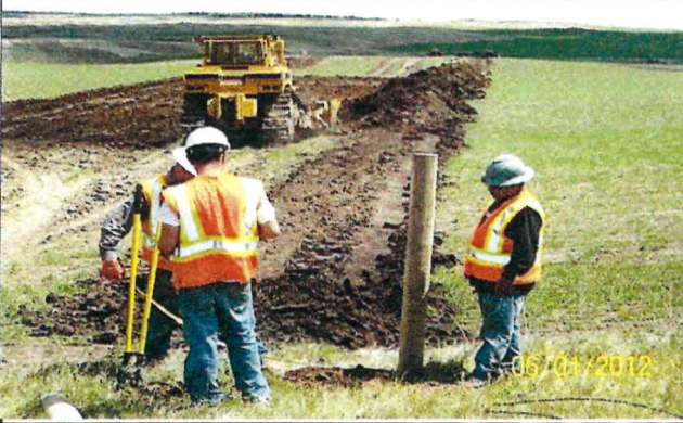
Building gate on R.O.W