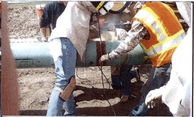
Pipe Gang Kickoff Pictures / Williams County ND between ST#1695+19 and ST#1673+00