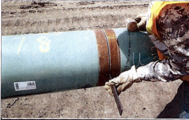
Pipe Gang Kickoff Pictures / Williams County ND between ST#1695+19 and ST#1673+00