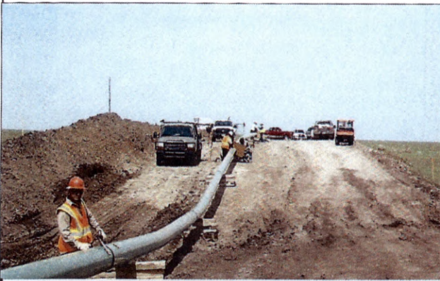
Pipe Gang Kickoff Pictures / Williams County ND between ST#1695+19 and ST#1673+00