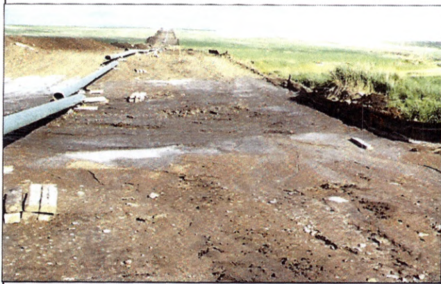
After rain event