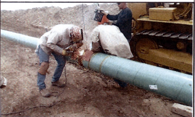
Pipe Gang Kickoff Pictures / Williams County ND between ST#1695+19 and ST#1673+00