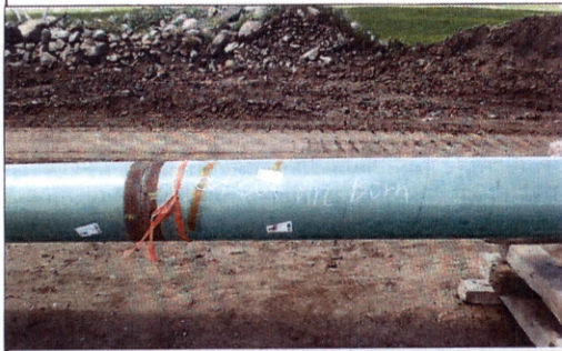
Firing Line / Williams County ND between ST#1350+00 and ST#1406+12