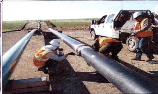
putting on 2 part epoxy