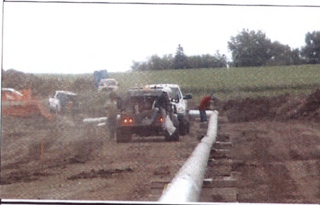
Firing Line / Williams County ND between ST#1345+00 and ST#1269+00