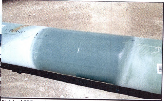
Finished FBE coating