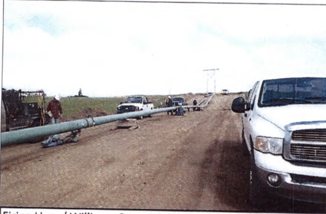
Firing Line / Williams County ND between ST#1345+00 and ST#1269+00