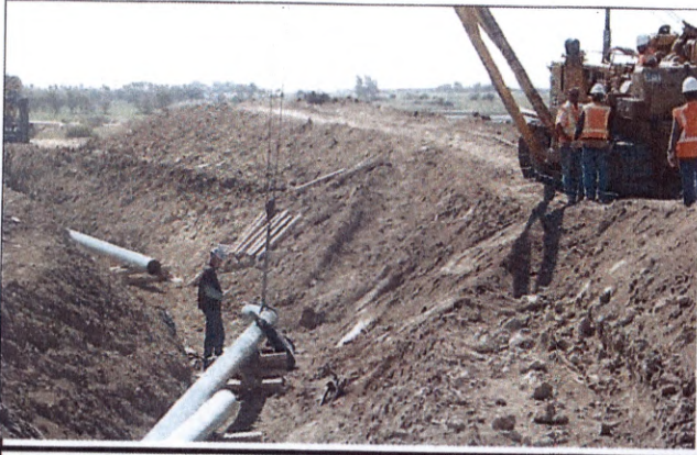
Tie In / Williams Co ND Lowering in crew / tie in weld near P.I. ST#1365+93.97