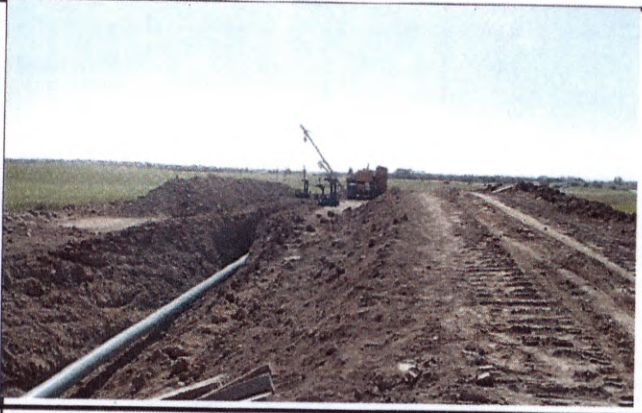
Tie In / Williams Co ND Lowering in crew / tie in weld near P.I. ST#1365+93.97