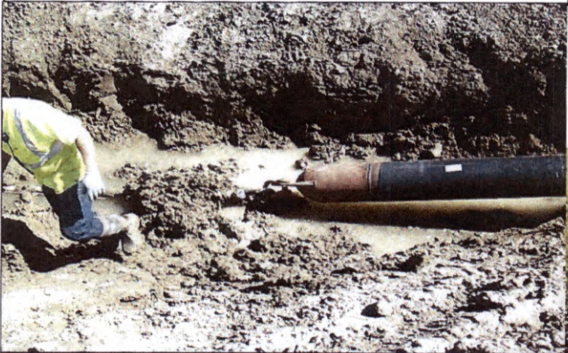
Bore at 68th Ave