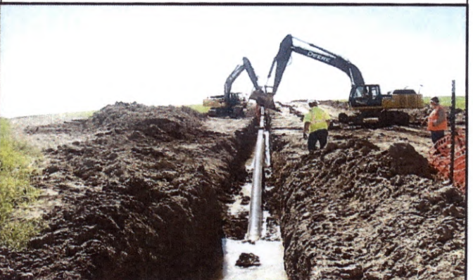
Bore at 68th Ave