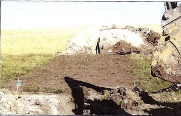
Tie In / Williams Co ND