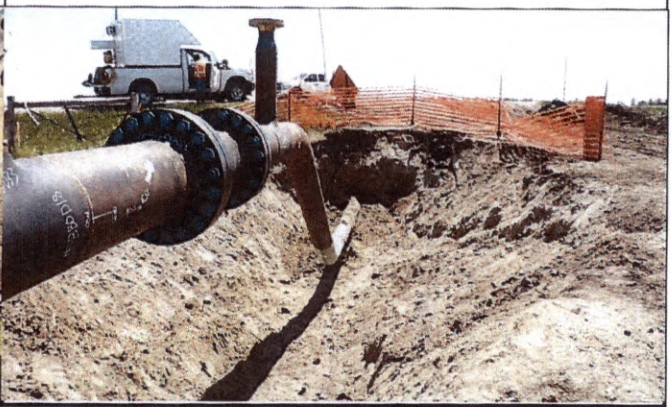
Tie In / Williams Co ND