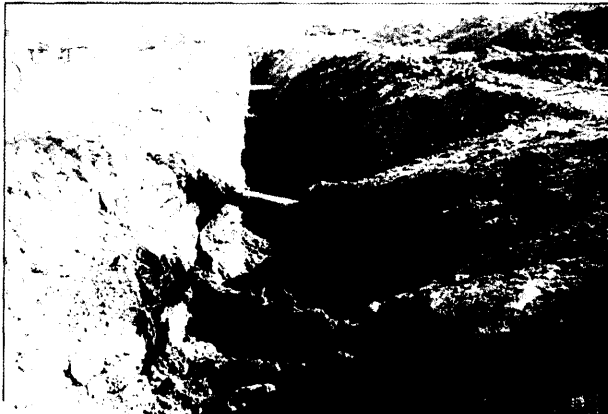
Pipe to cross under.