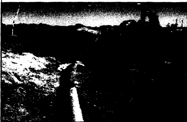
Tied-in pipe and sack breaker.