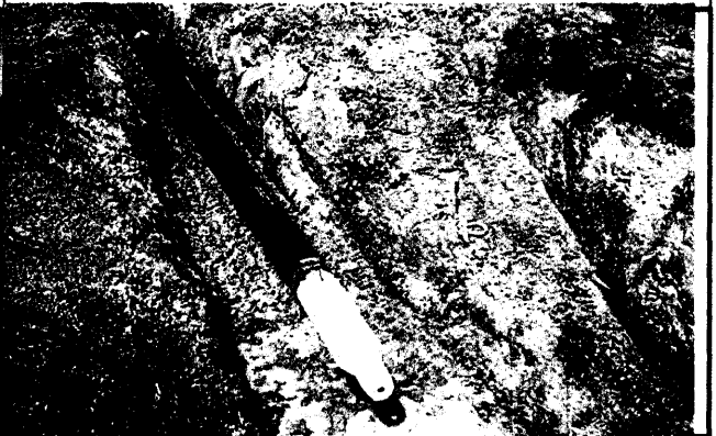
Pulled bore pipe.