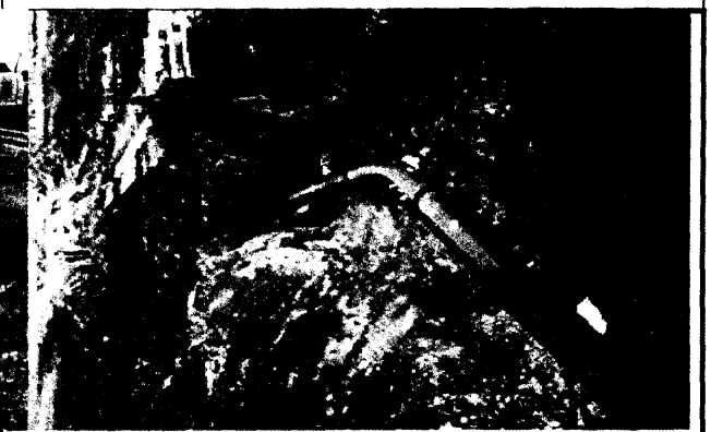
Tie-in to bore and lowered in pipe.