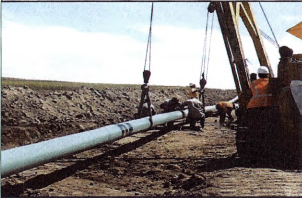
Pipe gang welding pipe