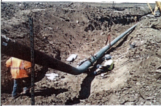
Pipe gang welding in at tie-in point