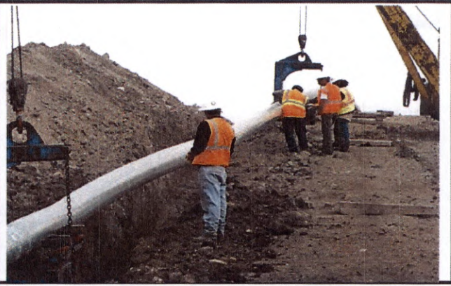
Prep for lowering in.