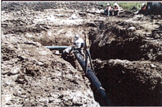
Bore pipe tie-in