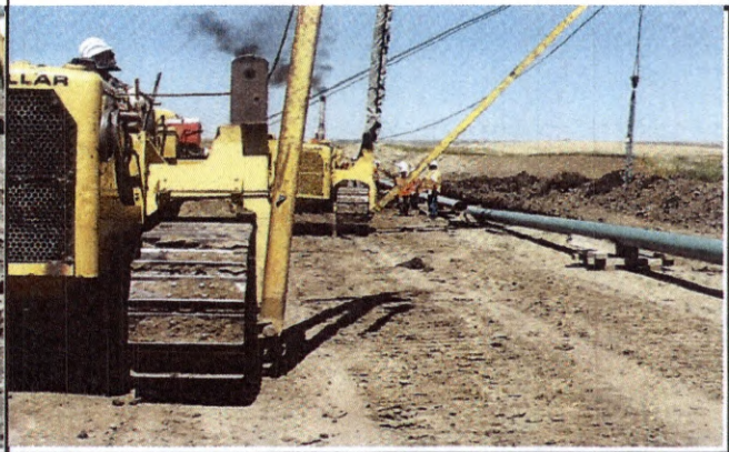
Prep for pipe gang welding