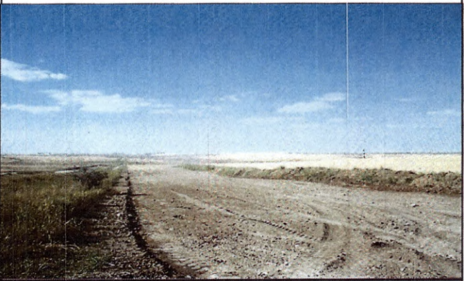
ROW clean up prior to topsoil replacement.