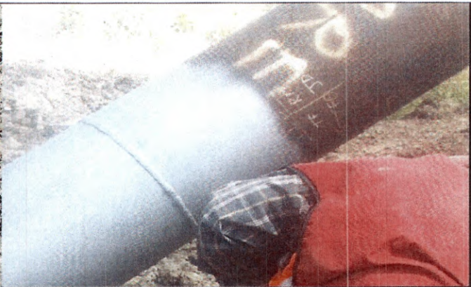
Sandblasting for coating