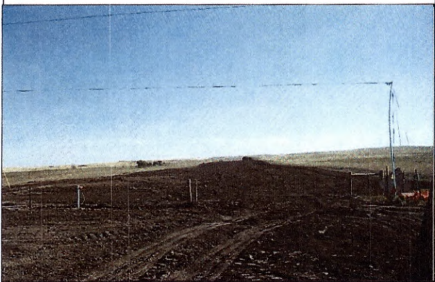
ROW after topsoil replacement/prior to seeding.