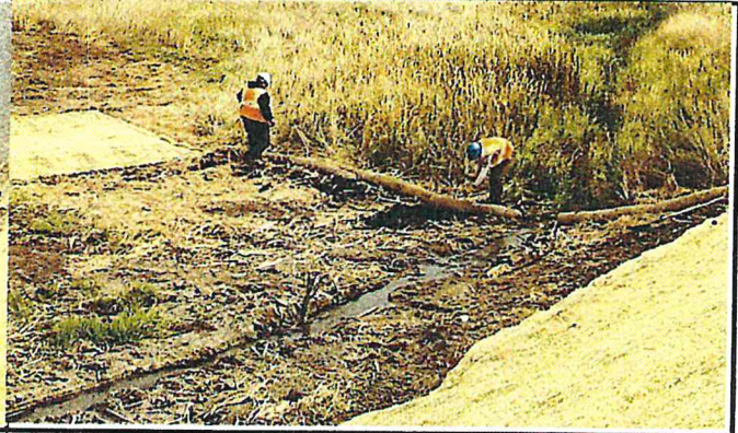
ECD being installed