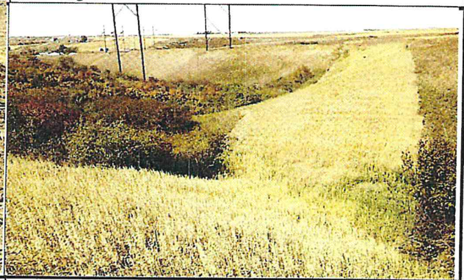
Vegetation retraining to coulee