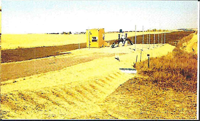
56 st. valve set