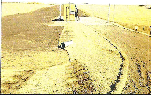
56 st. valve set