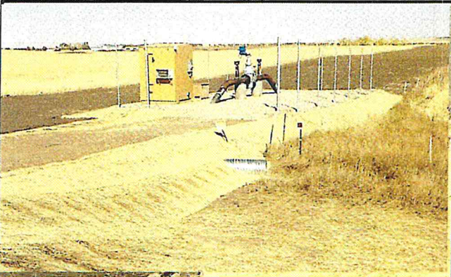
56 st. valve set