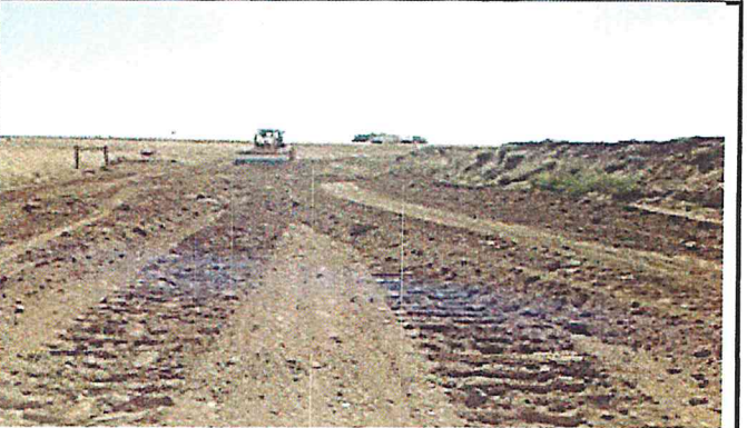
Dozer working ROW off Hwy 2.