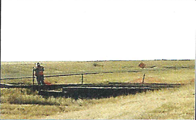
Mats on ROW