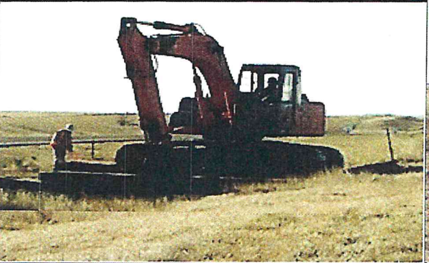
Mat Clean up