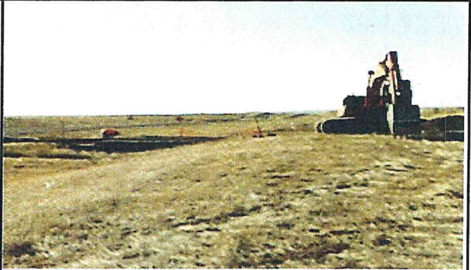
Mat Clean up