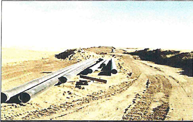
Well Pad pipe.