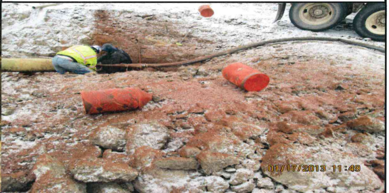
Retrieval of Dewatering PIGs