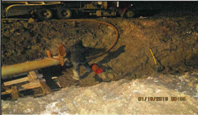
Retrieval of Drying PIGs