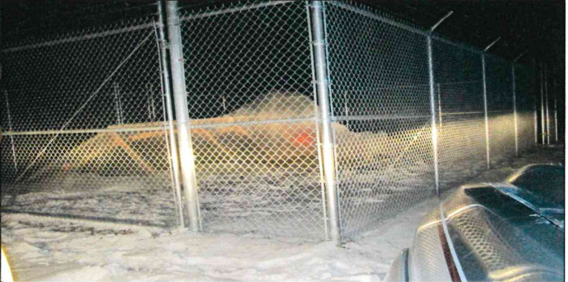
Monitoring of each valve site during dewatering and drying