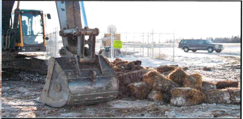
Hwy 153 Cleanup