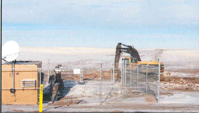
Hwy 153 Cleanup