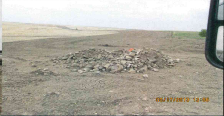
ROW Restoration And Rock Picking In Progress