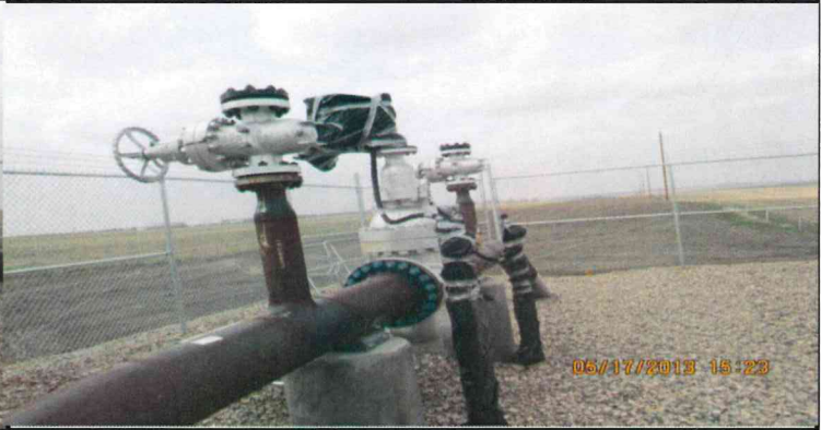
ROV Sites Taped In Preparation For Painting