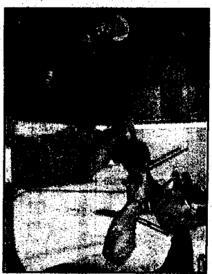
See Page 5