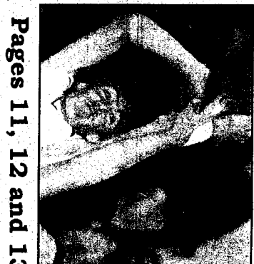
Pages 11, 12 and 13