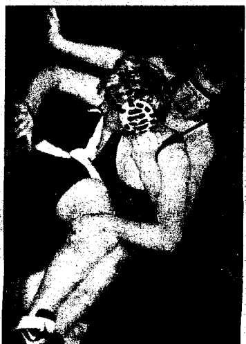
Sports seasons in full swing