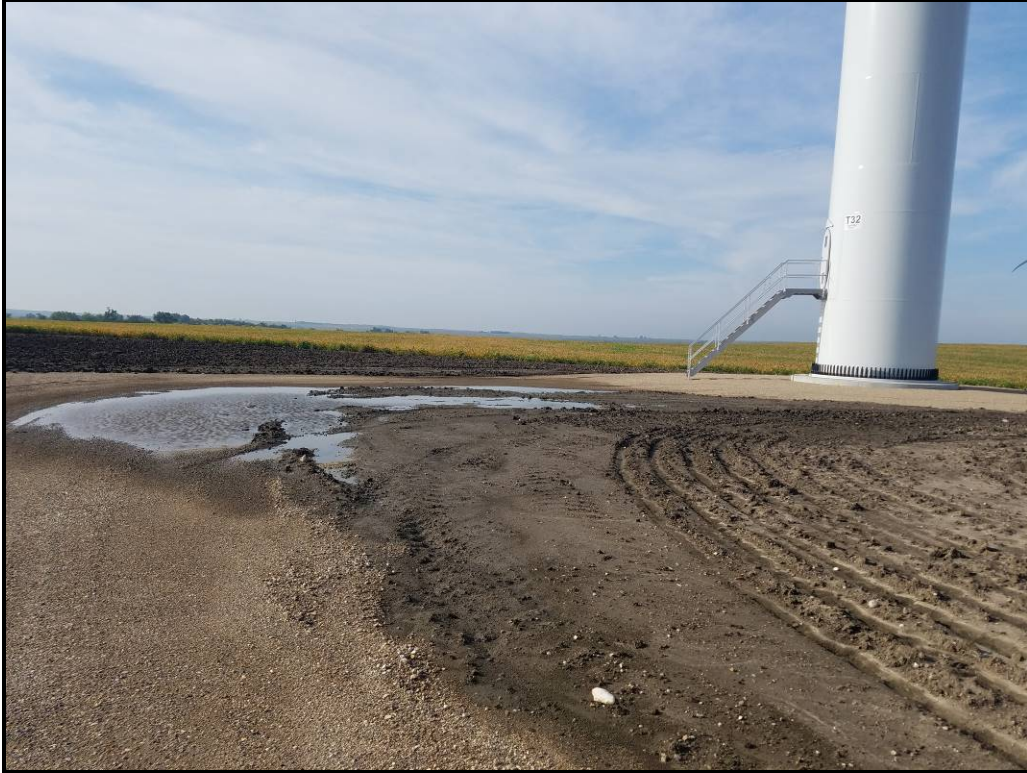
Photo 1. Photo of standing water and silt erosion onto the access road to Turbine 33. Photo taken facing south.