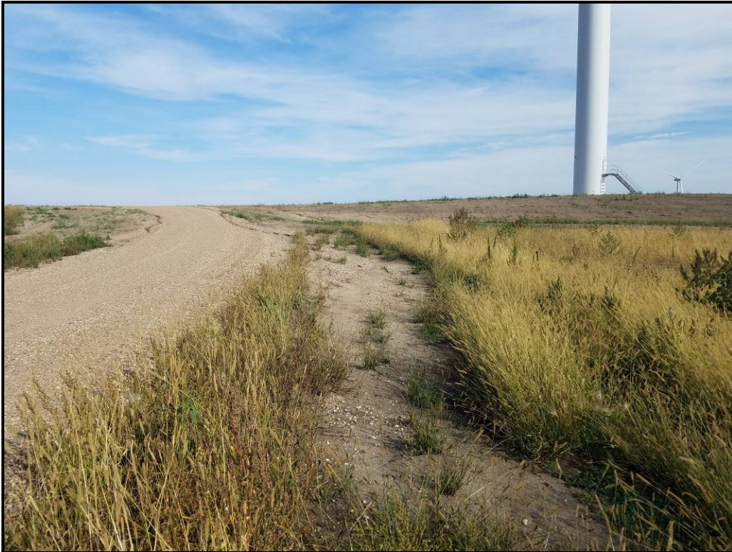
Photo 4. Photo of erosion on the access road near Turbine 39. Photo taken facing northwest.