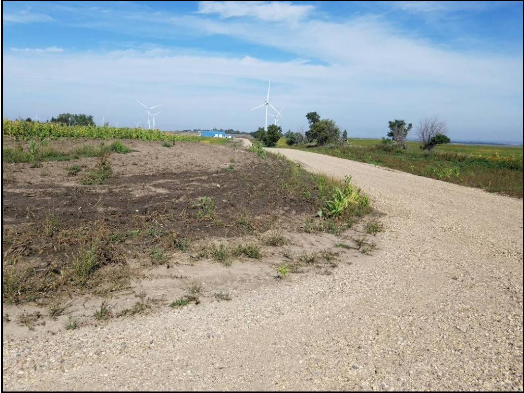
Photo 7. Photo taken facing north along access road to the Facility Office (blue building).