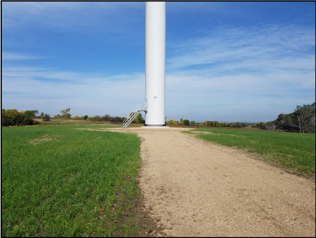
Photo 8. Photo of Turbine 3 facing northwest.