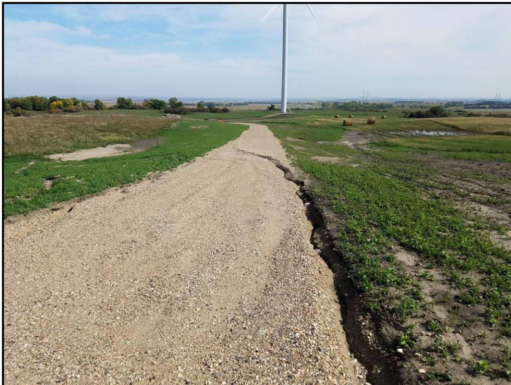
Photo 6. Photo of erosion on access road to Turbine 7. Photo taken facing southwest.