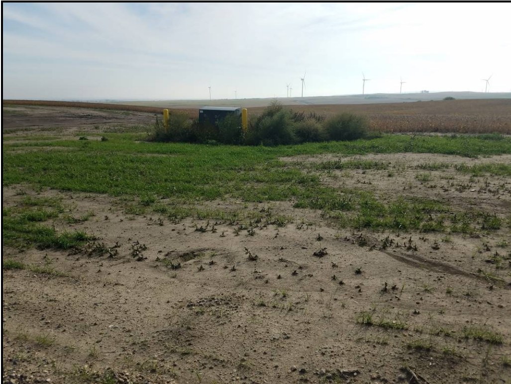
Photo 2. Photo of weeds (Canada thistle and kochia) growing around electrical box near Turbine 24. Photo taken facing east.