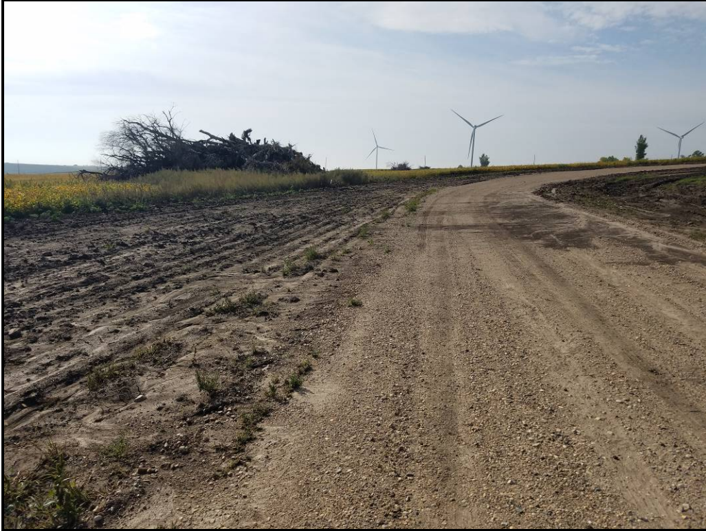
Photo 3. Photo of trees removed during construction near Turbine 26. Photo taken facing south.