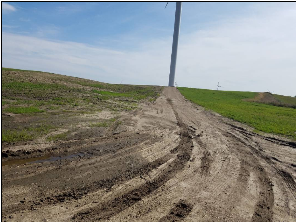
Photo 10. Photo of Turbine 14 and access road. Photo taken facing east.