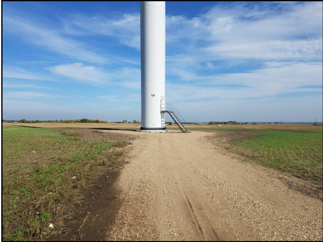
Photo 9. Photo of Turbine 64 facing North.