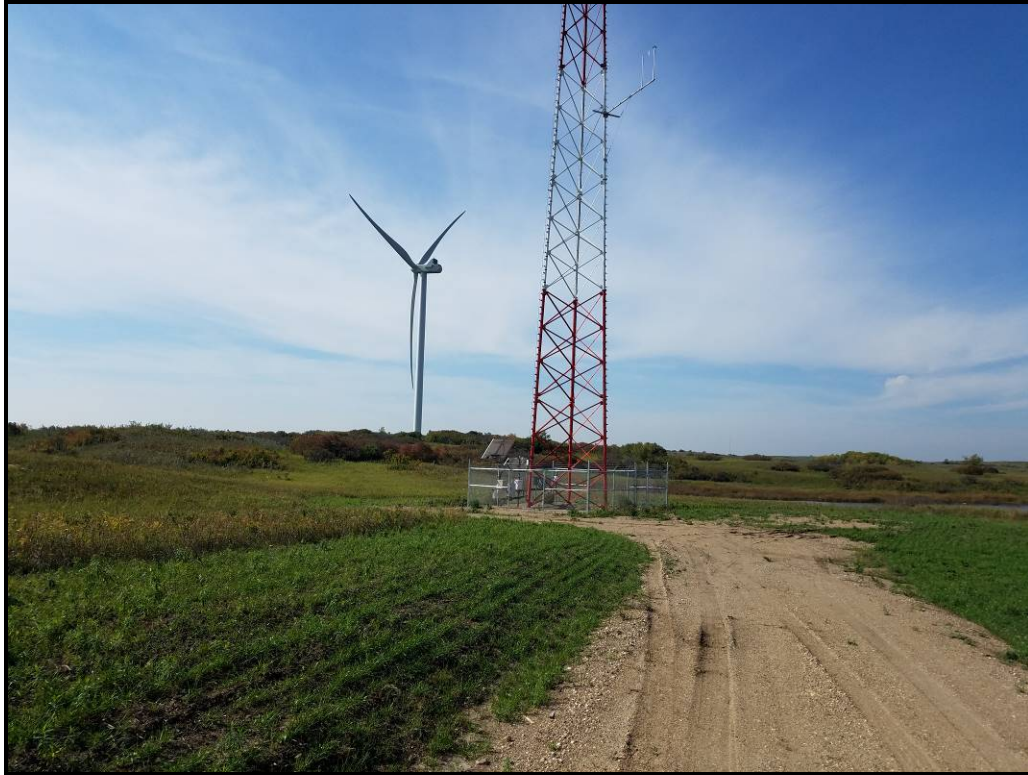
Photo 5. Photo of MET Tower and Turbine 12. Photo taken facing south.