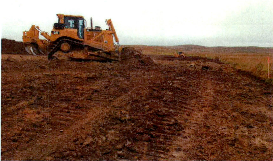
September 26, 2013 – Final topsoil stripping grading with the Canadian border in the foreground.