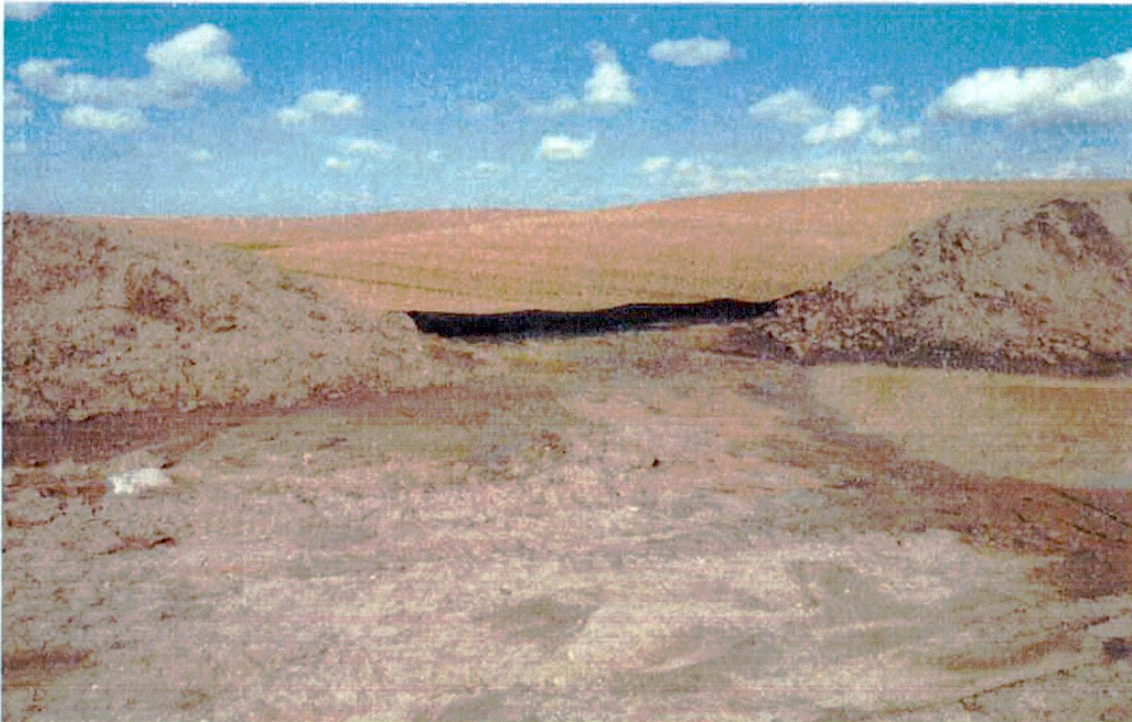
September 26, 2013 – Silt fence between soil berms to control sediment migration.