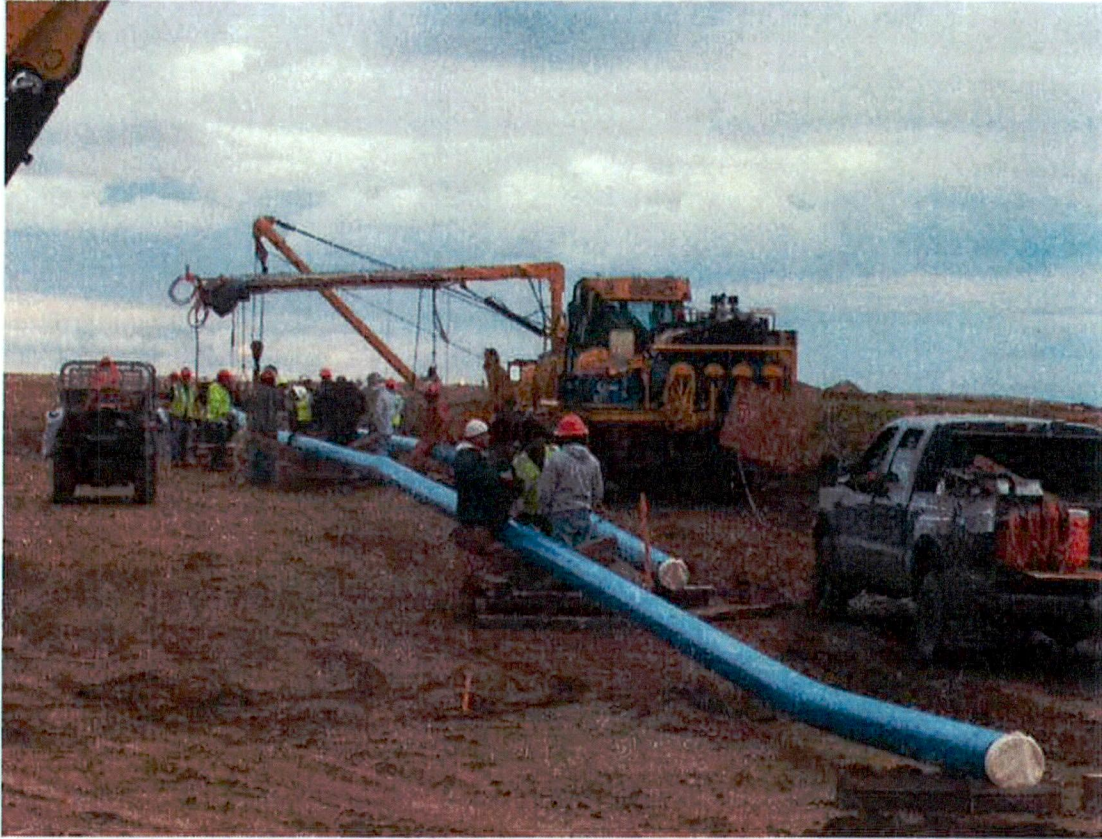
September 27, 2013 – Lead welding crew at MP37.82.

Trenching activities and pipe installation continued to MP8.00. Pipe stringing operations continued to MP62.00 during this reporting period.