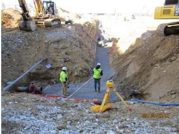
05-03 Pipe trench E4746 south view