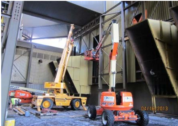
04-16 Column line 1 structural modifications