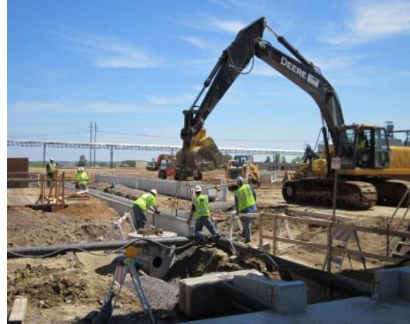
06-10 Ash pipe trench installation SE view