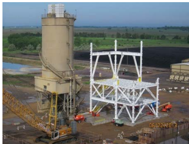
06-22 Waste ash/pebble lime silo