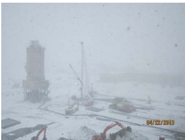
04-22 Waste ash/pebble lime silo