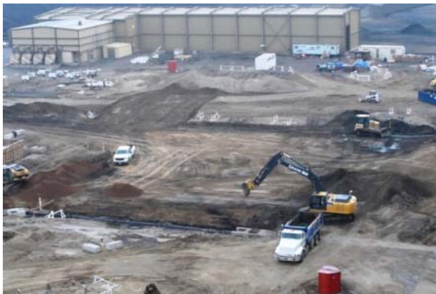
05-29 Baghouse excavation