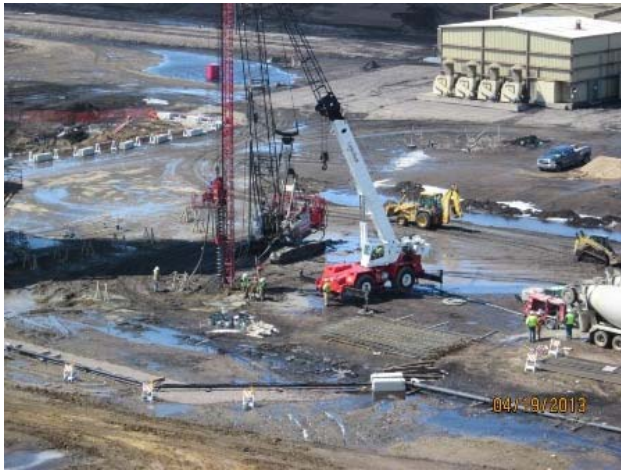
04-19 Auger cast pile installation waste ash/pebble lime silo

The following photographs illustrate various construction activities on the Project during the quarter.