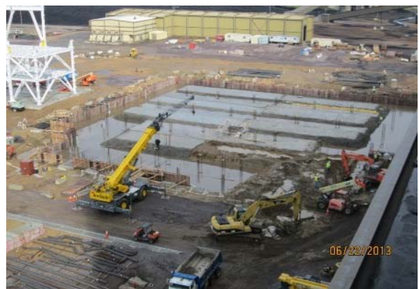
06-22 Baghouse SW view