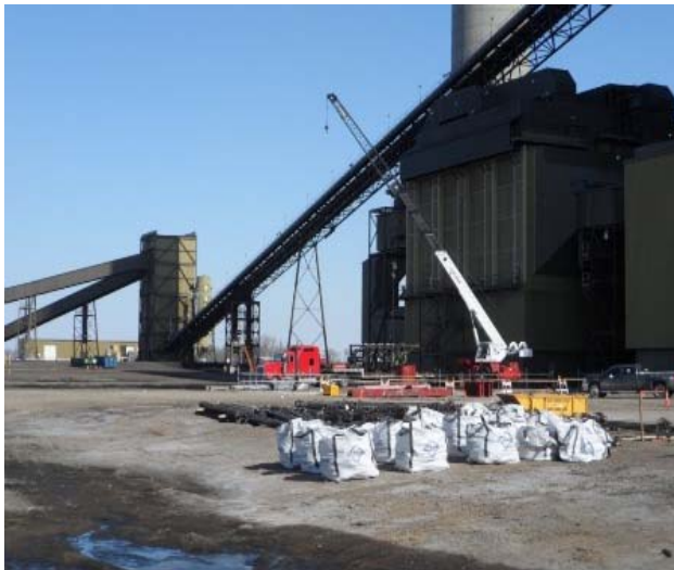
04-03 Plant south