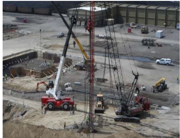
05-07 Production piles south SCR tower