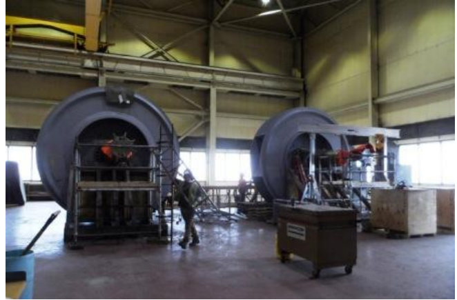
03-14-14 ID fan rotors stored on third floor