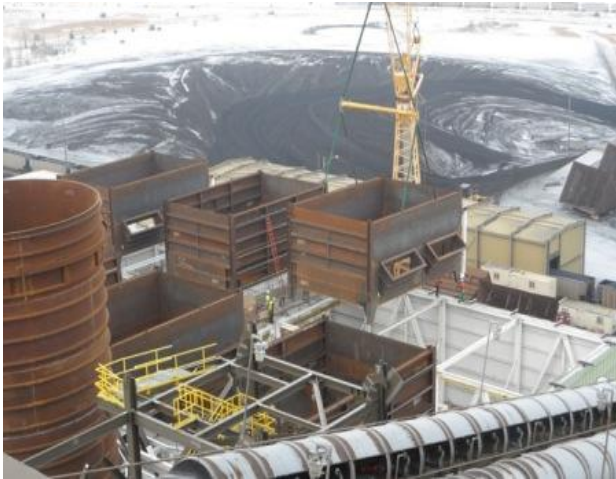
01-10-14 Baghouse F6 lower module set in place

The following photographs illustrate various Project construction activities during the quarter.