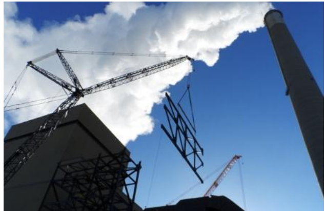
01-07-14 SCR north 03 truss lift