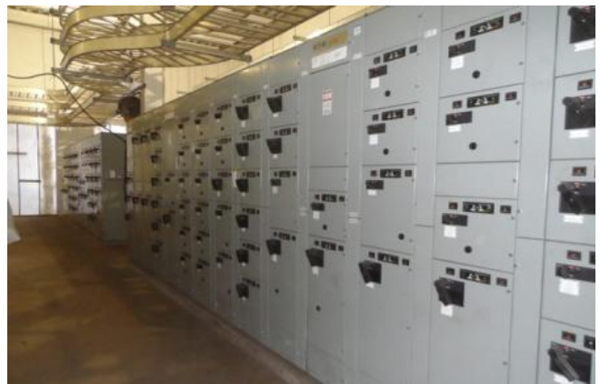
02-1-14 MCC in electrical room