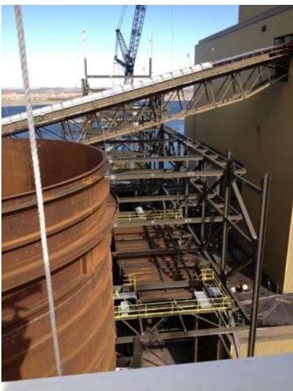
03-13-14 Center SCR