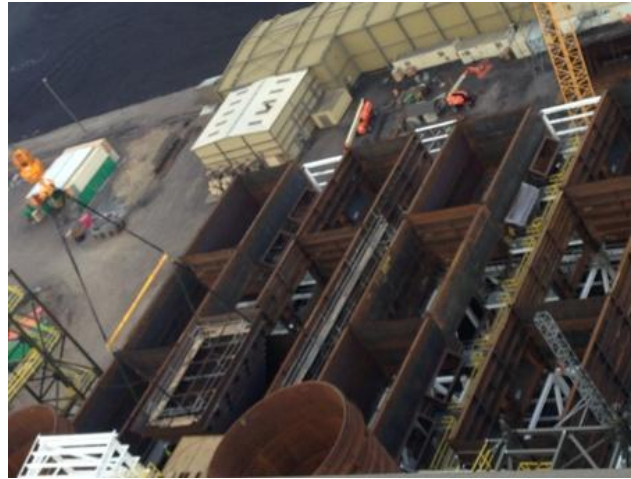
03-01-14 Setting D07 hopper