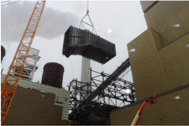
03-04-14 G13 duct lift