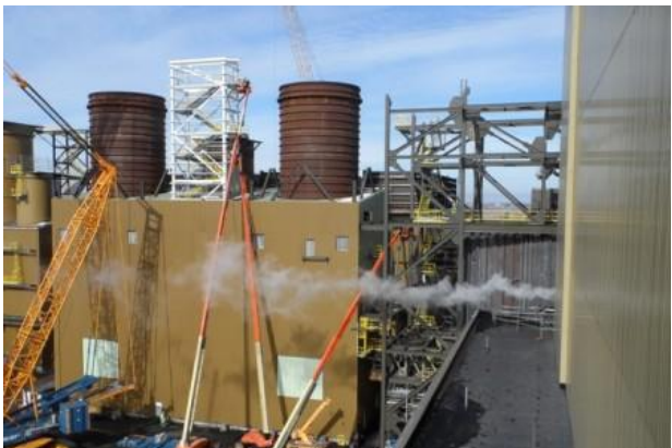
03-11-14 CFB & south SCR