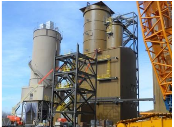
03-11-14 Waste ash/pebble lime building