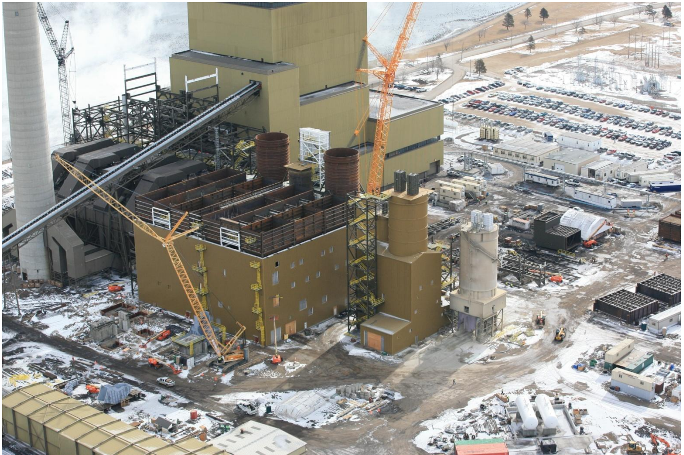
03-28-2014 Aerial View Taken

Safety is very important to us. We are taking extra steps to ensure a safe work site. The table below is included to provide information on recordable and lost-time injuries and near miss incidents for the total labor hours worked on the Project through March 31, 2014: