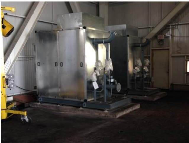
01-17-14 Setting pebble lime blowers inside WA/PL building